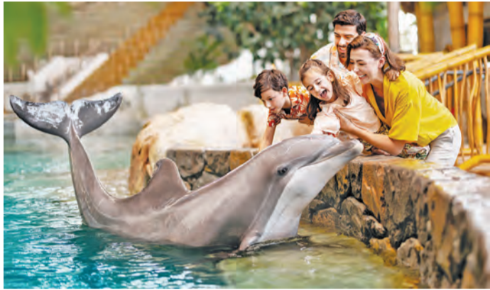
SeaWorld Abu Dhabi