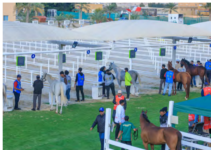
Participating horses are seen at the Bahrain International Endurance Village ahead of the event

Today, the Bahrain International Endurance Village will witness the organisation of international qualification races covering distances of 120 km and 100 km, a local race of 100