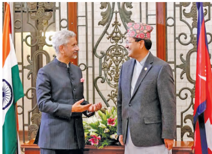
Nepal's Minister of Foreign Affairs NP Saud speaks with his Indian counterpart Subrahmanyam Jaishankar (L) in Kathmandu

Further details of the agreement have not been made public, but Independent Power Pro-