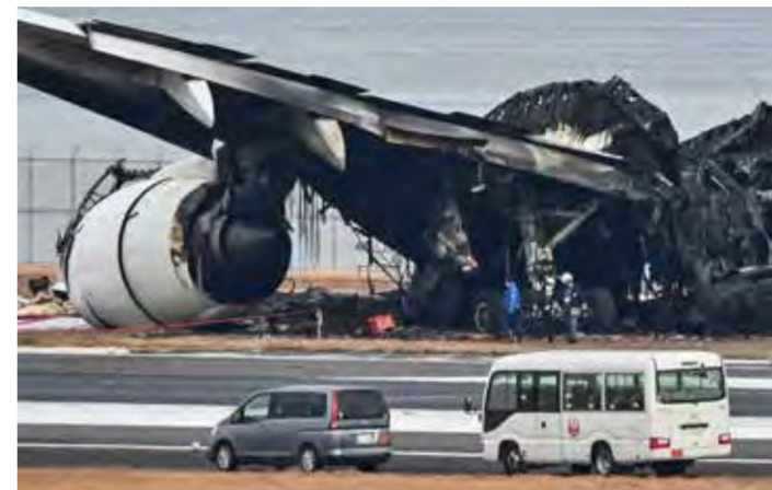
Officials look at the burnt wreckage of a Japan Airlines (JAL) passenger plane on the tarmac at Tokyo International Airport at Haneda in Tokyo

It took 18 minutes to evacuate the entire plane, with the pilot the last person to set foot on the tarmac at 6:05 pm.