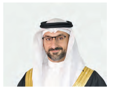
Abdulla bin Adel Fakhro, Minister of Industry and Commerce

Directorate at the ministry grants licenses for promotional campaigns, commercial