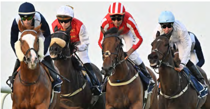
Action from a previous meeting at REHC

● Alba Cups to be won in each of the day's races, which make up the 14th meeting of the season