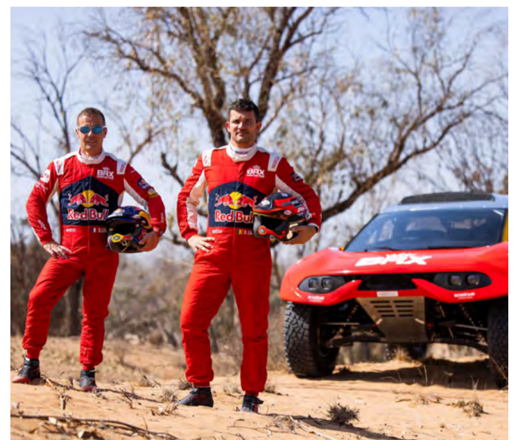
Sebastien Loeb and Fabian Lurquin with their BRX Prodrive Hunter

This year's Dakar is the fifth time it is being held in Saudi, and it will be the opening round of the 2024 World Rally-Raid Championship.