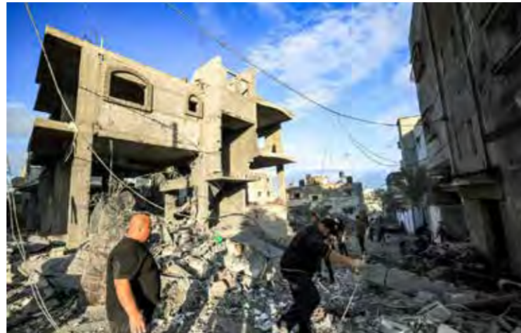
People inspect the rubble of a building where the displaced Palestinian Jabaleh family were sheltering after it was hit by Israeli bombardment in Rafah

The Gaza health ministry reported "dozens of martyrs and more than 100 wounded in the continued barbaric aerial and artillery bombardment of citizens"