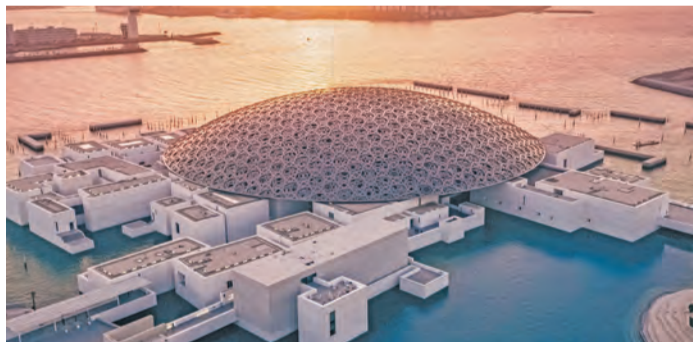
Louvre Abu Dhabi

Next stop, SeaWorld Yas Island! This watery wonderland whisked us through eight thematic zones, where we came face-to-fin with playful dolphins, majestic manta rays, and even curious Arctic foxes. As the sun dipped below the horizon, we glided through the lush mangroves aboard a boat, the silence broken only by the