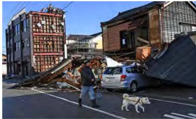
A man walks a dog past destroyed buildings in Anamizu, Ishikawa prefecture