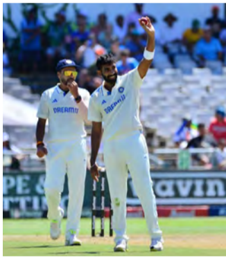
Jasprit Bumrah raises the ball after taking his fifth wicket

Kohli (12) fell to Kagiso Rabada and Marco Jansen before Shreyas Iyer hit the winning boundary with his only scoring stroke.