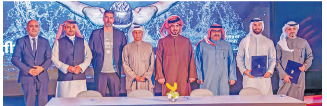
HH Shaikh Khalid bin Hamad Al Khalifa with other officials at yesterday's ceremony