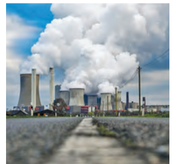
Vapor rises from the cooling towers of a lignite-fired power station

Germany resorted to the fuel in the wake of the Rus-