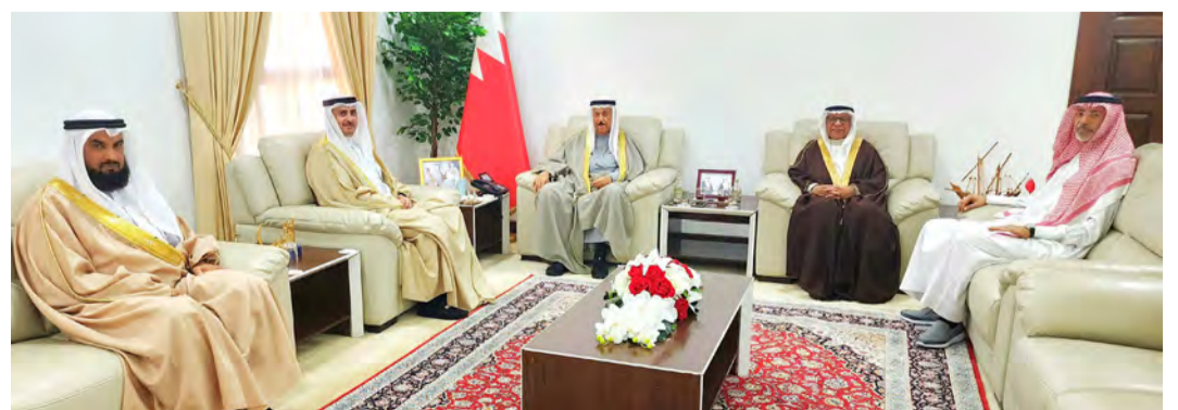
The officials at their meeting

The SCIA president congratulated the chairmen on obtaining the royal trust from His Majesty King Hamad bin Isa Al Khalifa in appointing them within the