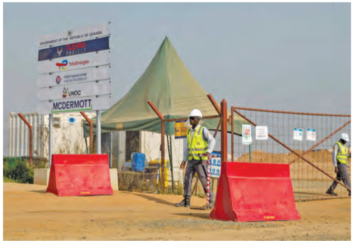
Guards work at TotalEnergies' central processing facility construction in Buliisa, Uganda

Tilenga targets oil under the rich Murchison Falls nature reserve in western Uganda with a planned 419 wells, trigger-