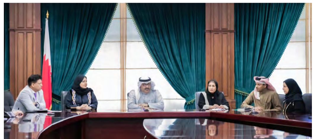
The Education Minister with the assistant principals