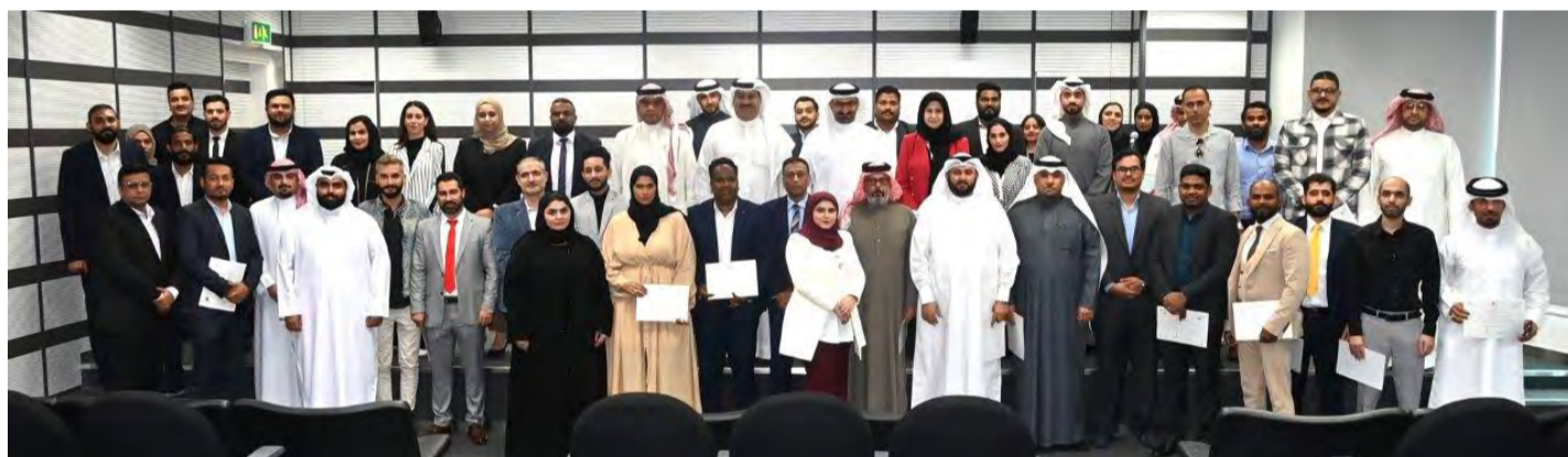
Ministry officials and shop representatives during the awarding

Throughout November and December last year, 1,122 establishments participated in the initiative, which witnessed a great turnout from businesses across all governorates.