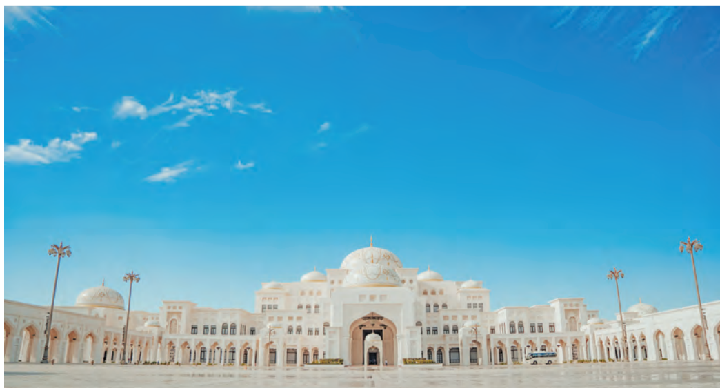
Qasr Al Watan