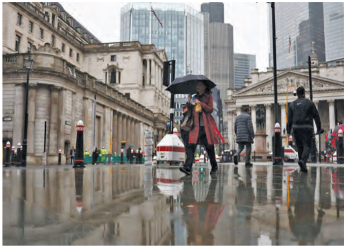
A pedestrian with an umbrella walks by the Bank of England building (L) and Stock Exchange building (R), in the financial district, central London

"With Western nations threatening more forceful actions to