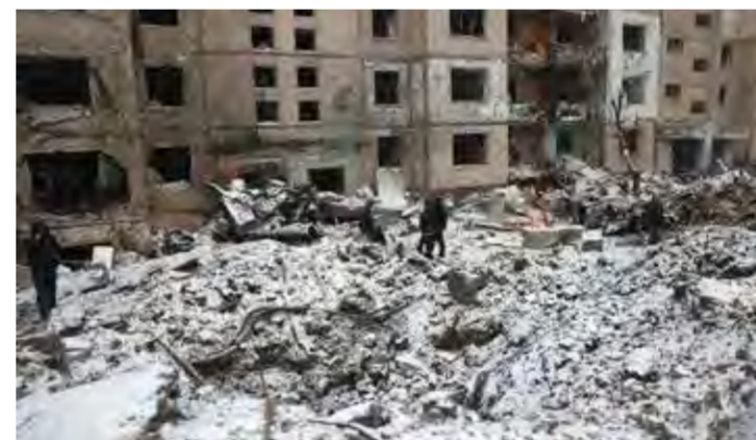
Police officers and local residents inspect damage outside a destroyed high-rise building following a Russian missile attack in central Kyiv

"The total number of dead as a result of the enemy missile attack on December 29 is 32 people," said the head of the Kyiv military administration Sergiy Popko.