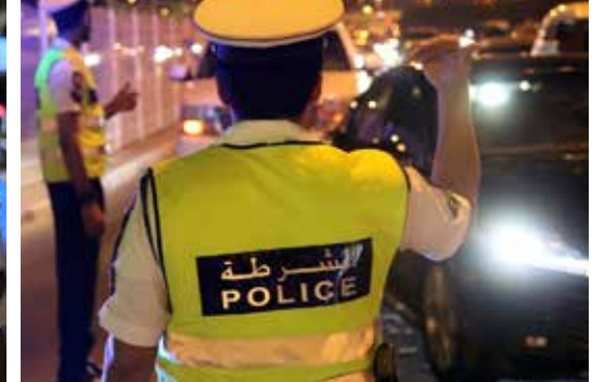
Police officers work round the clock to protect everyone's safety

They implemented a number of security measures and cy's Operations Department de-