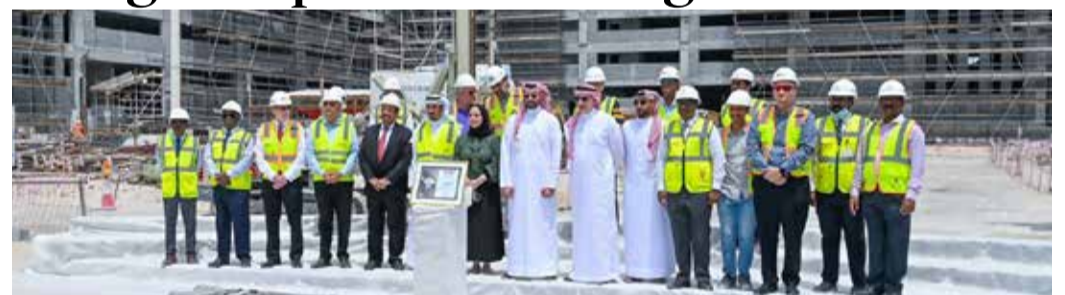
Ministry of Housing officials and other stakeholders at the building construction site