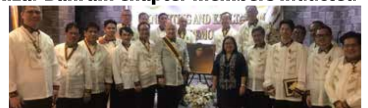
The Knights of Rizal-Bahrain Chapter with new members and top Philippine Embassy officials