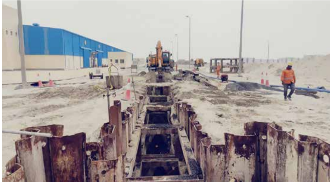
The main sewage water carrier construction work in progress

According to Eng. Al Khayyat, the project includes the building of a major sewage conveying