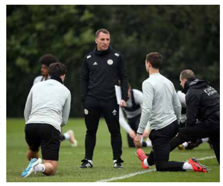
Brendan Rodgers looks on during a training session (file photo)

Long-serving goalkeeper first European final.