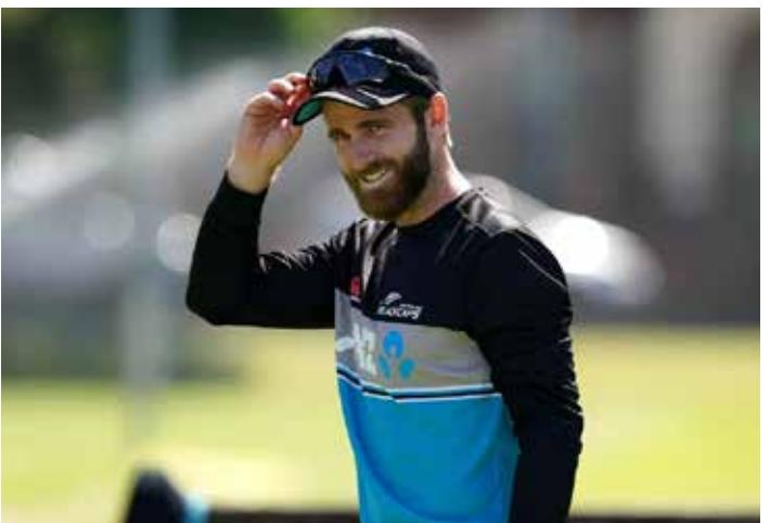
Kane Williamson reacts during a training session (file photo)

Immediately after last year's mained in England to beat India World Championship final in about." Southampton.