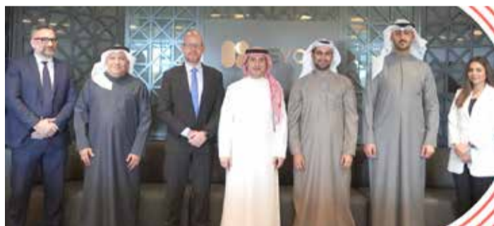
Officials following the deal signing

The announcement follows the signing of an MoU in 2022, which will see Beyon Connect delivering its digital postbox solution, OneBox, and OneID, a new platform to register a unique digital identity. OneID will be made available as a mo-