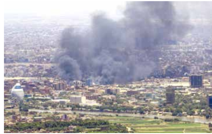
Smoke billows during fighting in the Sudanese capital Khartoum

The foreign ministry accused the RSF of attacking the Indian embassy in Khartoum, the latest in a spate of such incidents which the diplomatic mission