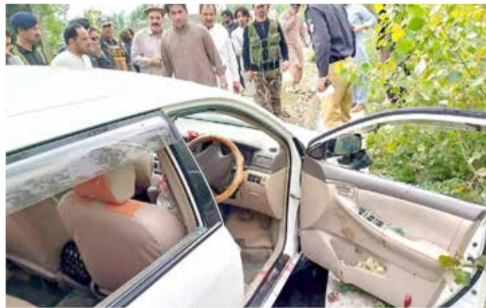
Security personnel and officials at the site of sectarian violence in a school

Officials said five teachers and two labourers were gunned