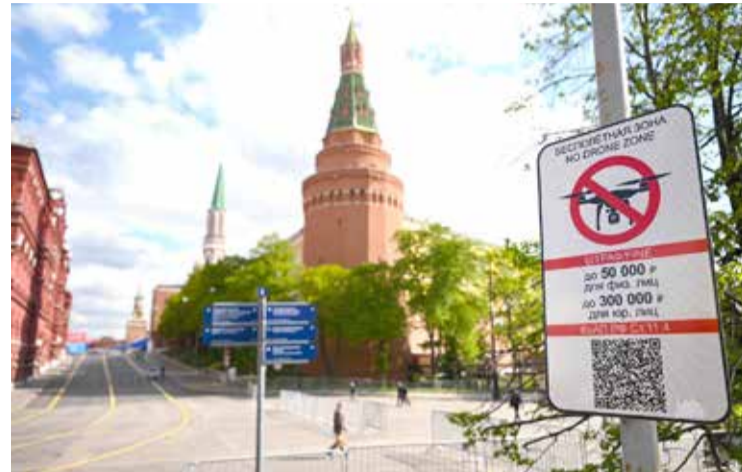
A "No Drone Zone" sign sits just off the Kremlin in central Moscow

Ukraine has denied responsibility, with President Volodymyr Zelensky saying "We do not at-