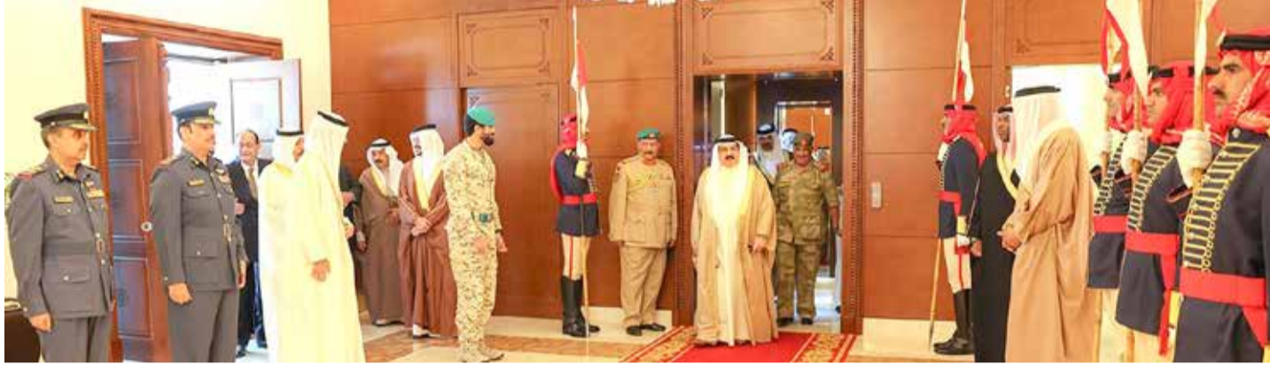
HM King departs for UK

The ceremony is also the first for UK in 70 years and only the