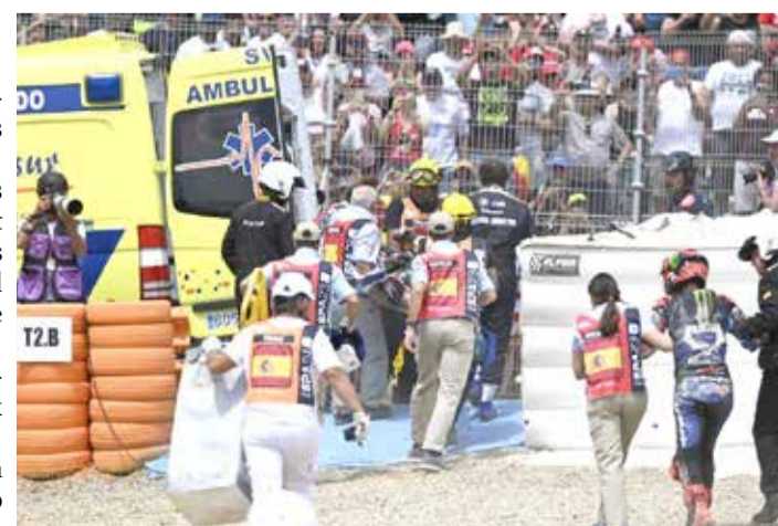
Rescuers tend to Yamaha French rider Fabio Quartararo (R) and Aprilia Portuguese rider Miguel Oliveira after falling during the Spanish MotoGP

The French MotoGP takes place between May 12-14.