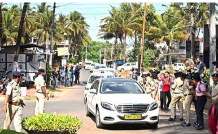
A vehicle carrying Pakistan's Foreign Minister Bilawal Bhutto Zardari arrives in a convoy to attend the SCO meeting in Banaulim in Goa