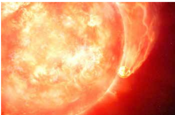
An artist's impression shows a star devouring one of its planets AFP | London

Scientists said that they have observed a dying star swallowing a planet for the first time, offering a preview of Earth's expected fate in around five billion years.