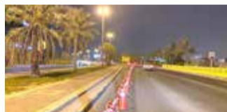
Traffic diversions are seen at a highway in the Kingdom

the ministry said it notified the public of these diversions through local newspapers and social media channels and suggested alternate routes.