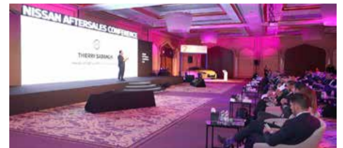
Nissan Aftersales Conference