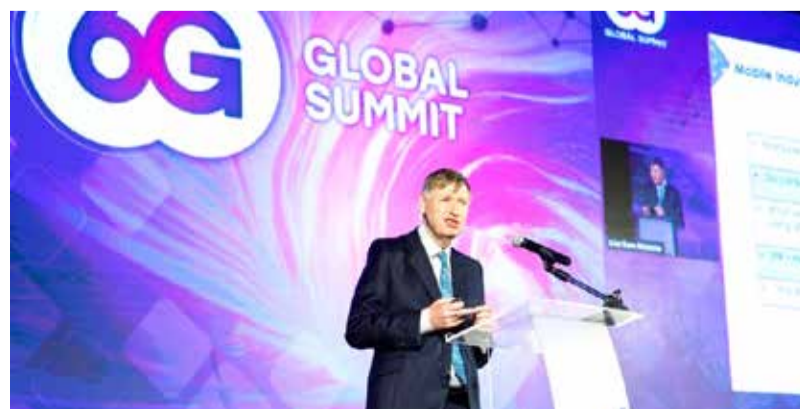
The Global 6G Summit, hosted by the Telecommunications Regulatory Authority (TRA), successfully concluded yesterday in a hybrid format, gathering telecommunications and related industries' representatives and decision-makers from across the globe. The two-day event revolved around various topics concerning 6G network technologies, such as 6G standards' research and coordination, 6G's economic potential, and how it can contribute to a more sustainable future. The summit featured keynote addresses and panel discussions from leading industry professionals hailing from Bahrain, the United Arab Emirates, Jordan, Thailand, China, Europe, the United Kingdom, Canada, and other countries.