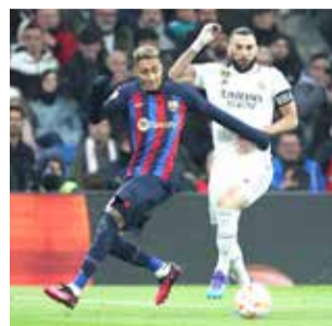
Barcelona's Raphinha (L) vies with Real Madrid's Karim Benzema during a match (file photo)