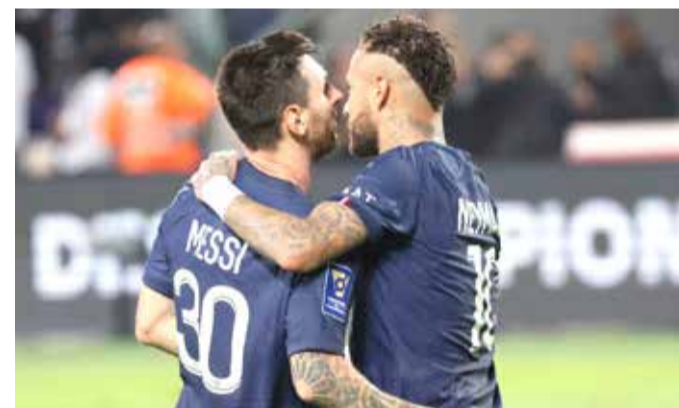
PSG's Lionel Messi (L) and Neymar celebrate during a match (file photo)