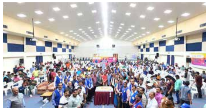
Labour Day celebration organised by ICRF

sponsors, and medical teams were on hand from Shifa Al Jazeera Medical Centre and Al Rabea Medical Centre to provide first aid if required.