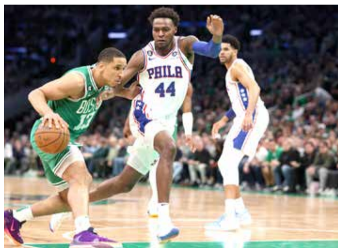
Malcolm Brogdon #13 of the Boston Celtics drives to the basket against Paul Reed #44 of the Philadelphia 76ers

After Wednesday's rout, Sixers coach Doc Rivers will have