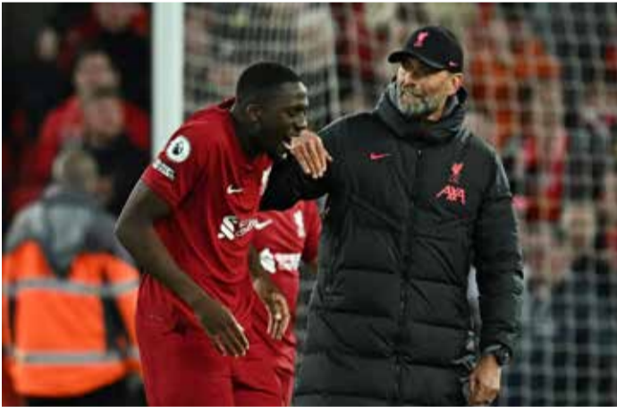
Liverpool's German manager Jurgen Klopp (R) jokes with Liverpool's French defender Ibrahima Konate (R)

Klopp, the Liverpool manager and former Dortmund coach, has a history of run ins with match officials and is facing charges from the English Football Association for his rant at