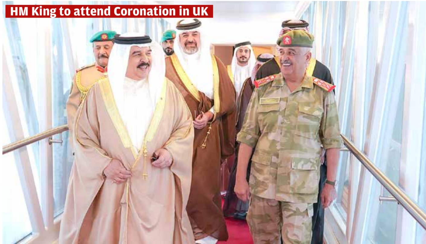
At the invitation of His Majesty King Charles III of the United Kingdom, Head of the Commonwealth, His Majesty King Hamad bin Isa Al Khalifa yesterday departed for the United Kingdom to attend the coronation ceremony. (Story on page 2)