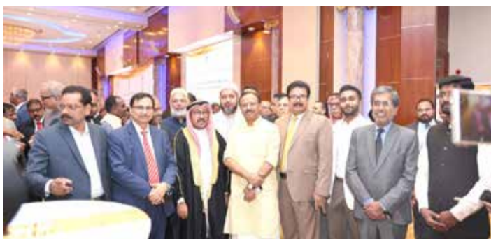
Minister Muraleedharan during meetings yesterday at the Indian Embassy

close bilateral interaction at the higher political level, and we are very confident that this visit will further progress our relations in all spheres, especially in trade and investment," the Ambassador said.