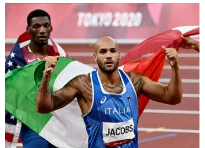
Fred Kerley Marcell Jacobs