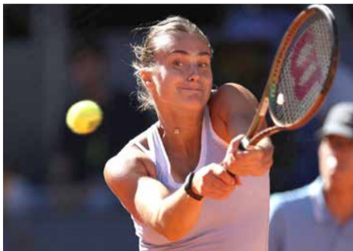
Belarus' Aryna Sabalenka returns the ball to Greece's Maria Sakkari

From 3-3 in the opening set, Sabalenka won nine of the last 11 games including the last five. Aslan Karatsev won the battle