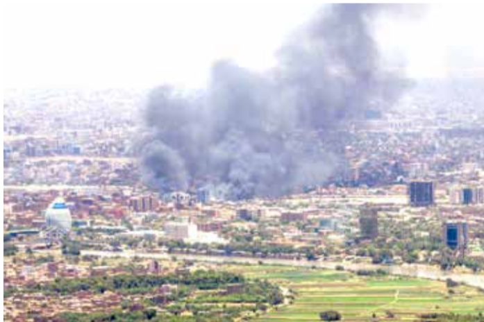
Smoke billows during fighting in the Sudanese capital Khartoum

US President Joe Biden on Thursday threatened to impose new sanctions over Sudan's conflict, saying the fighting "must end", as gunfire and explosions rocked Khartoum for a 20th straight day.