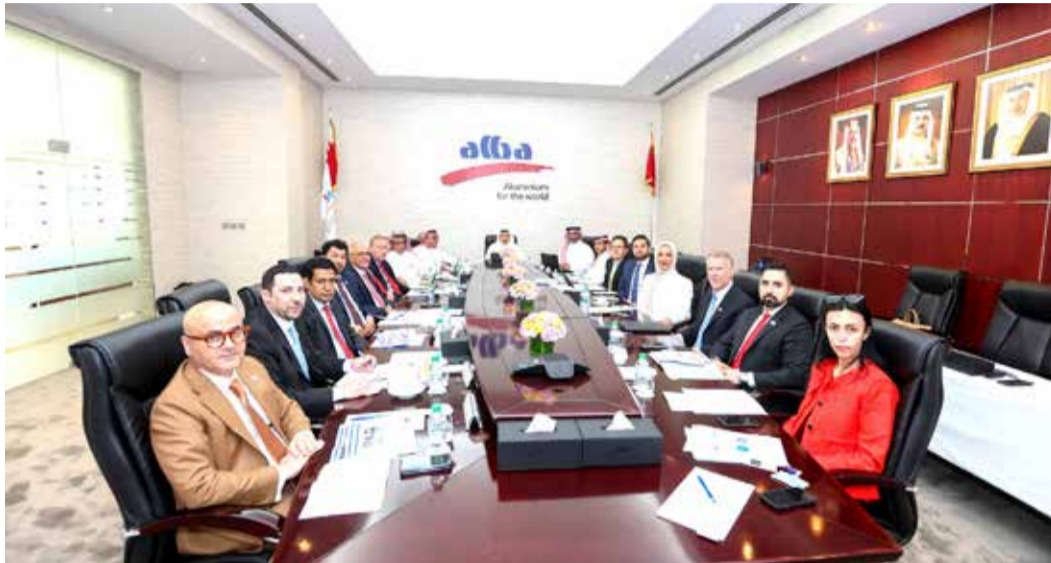
Alba board members during a meeting yesterday

Looking ahead, Alba said it expects market uncertainty to continue to cloud the Aluminium market and LME prices. Alba also said smelters' cuts in Europe are likely to keep the