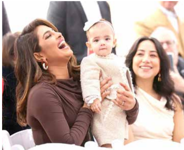
Priyanka Chopra with her daughter

“I’ve been really protective of this chapter of my life with my daughter. Because it’s not about my life only. It’s her’s, too. I was in the operating room when she came out. She was so small, smaller than my hand. We spent every single day with her on my chest, on my husband’s chest. I