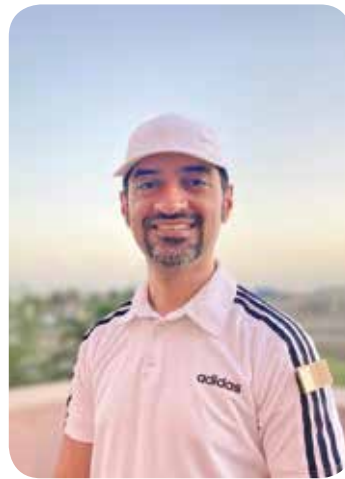
Wael bin Nasser Al Mubarak, the Minister of Electricity and Water Affairs