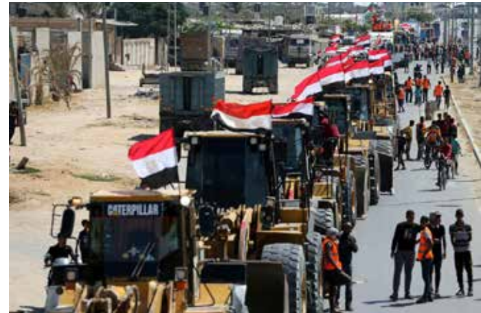
Building equipment, sent by Egypt for Palestinians, arrive in southern Gaza Strip

"We rushed with all our money, equipment, and what we