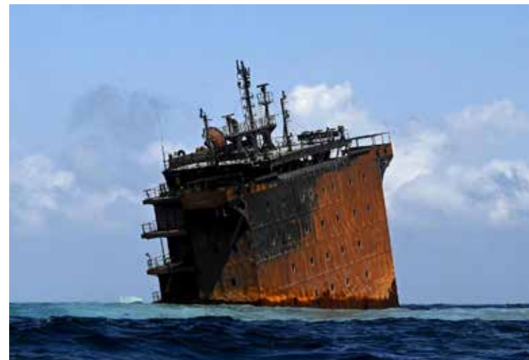
MV X-Press Pearl sinks after burning outside Colombo's harbour

oyed for oil spill from 'dangerous cargo' that burnt for 13 days