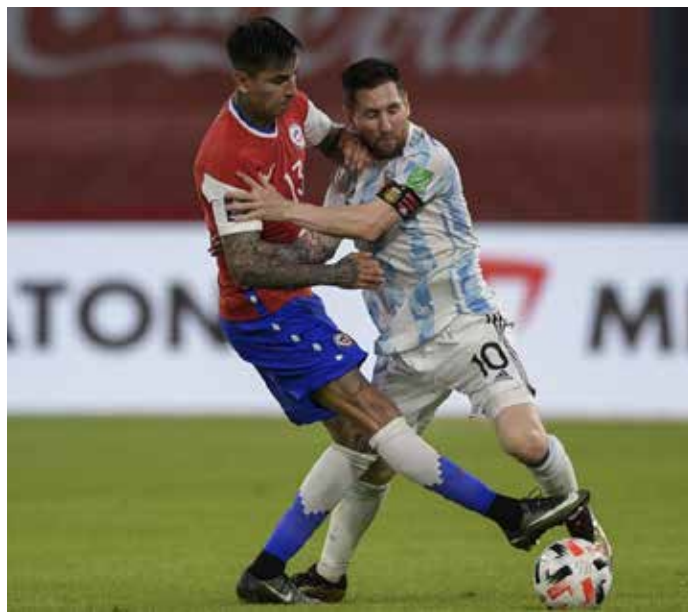
Chile's Erick Pulgar (L) and Argentina's Lionel Messi vie for the ball

though, and the hosts were awarded a penalty following a VAR check when Guillermo Maripan recklessly brought down Lautaro Martinez in the box.