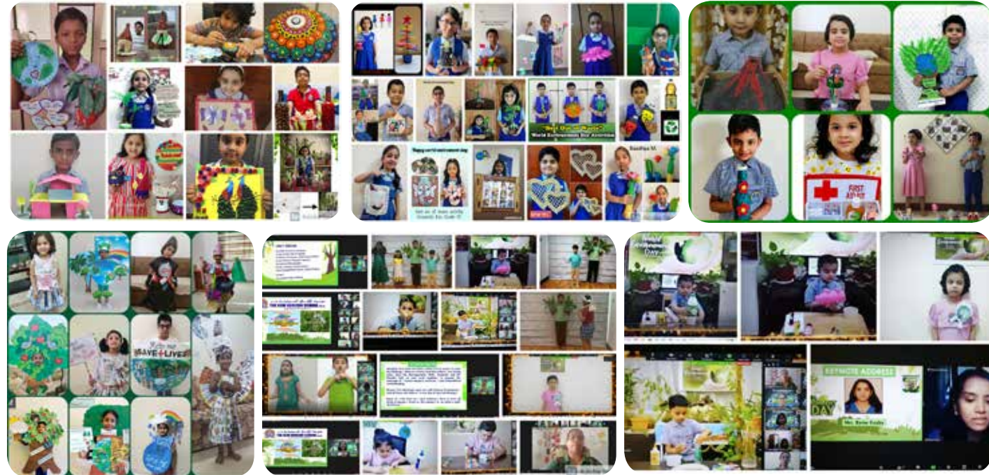
The New Horizon School observed World Environment Day on 3rd June 2021 with the Theme Ecosystem Restoration. The school's Science Department conducted a special assembly with a skit "Protect Our Nature" on the importance of plants for existence. Students presented a song on 'Giving Back life to our Mother Earth'. Kindergarten students presented a video highlighting how best we can use waste to protect our environment. The students, as part of an activity 'Best out of Waste', created useful products using discarded materials