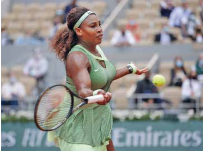
Serena Williams hits a return

The 39-year-old Williams had already seen yet another of her potential title rivals exit