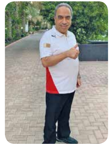
Kamal bin Ahmed Mohammed, the Minister of Transportation and Telecommunications