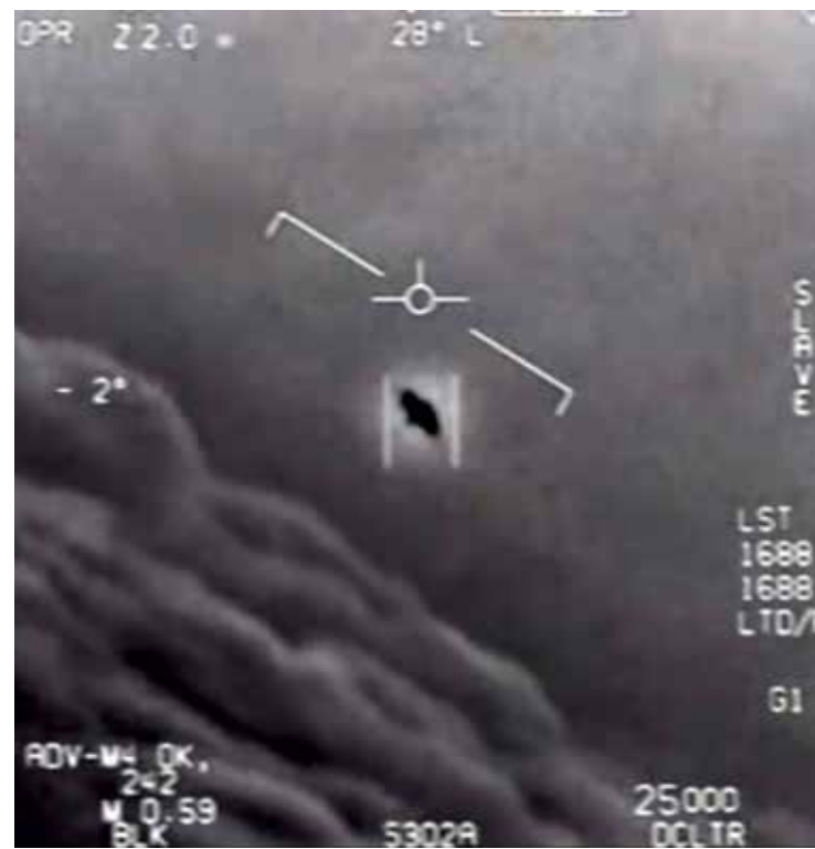
A still image from video released by the Department of Defense shows a 2004 encounter near San Diego between two Navy F/A-18F jets and an unknown object

One senior official briefed on the report said intelligence and military officials increasingly worry the phenomena could be China or Russia experimenting