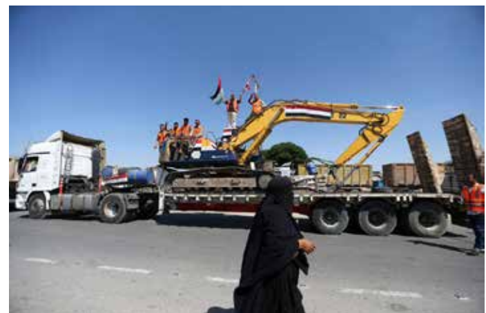
A woman walks past building equipment, sent by Egypt for Palestinians

It had previously been opening the crossing for only a few days at a time to allow stranded travellers to pass.