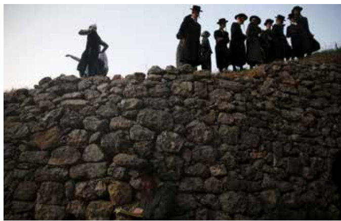
Ultra-Orthodox Jews take part in the "Mayim Shelanu" ceremony to collect water from a natural spring, near Jerusalem