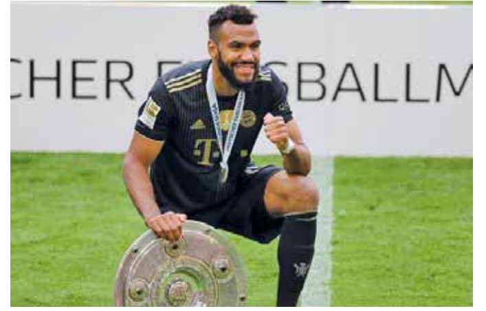
Bayern Munich's Eric Maxim Choupo-Moting poses with the championship trophy