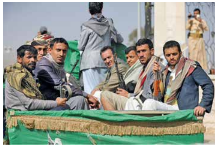
Armed Houthi followers ride on the back of a truck after participating in a funeral of Houthi fighters killed in recent fighting against government forces in Yemen's oil-rich province of Marib, in Sanaa, Yemen

The US special envoy for Yemen, Tim Lenderking, returned on Thursday from a trip to Saudi Arabia, Oman, the United Arab Emirates and Jordan, where he discussed the humanitarian and economic crisis in Yemen with government officials, Yemenis and international partners, the department said