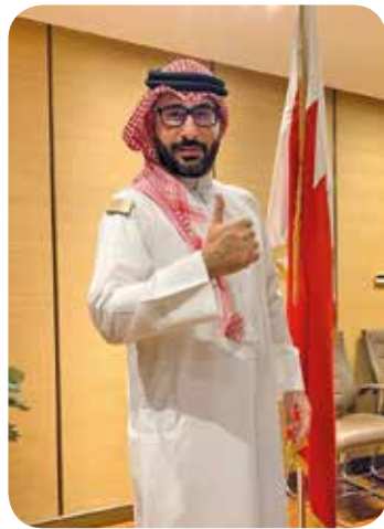
Aymen Tawfiq Almoayyed, the Minister of Youth and Sports Affairs