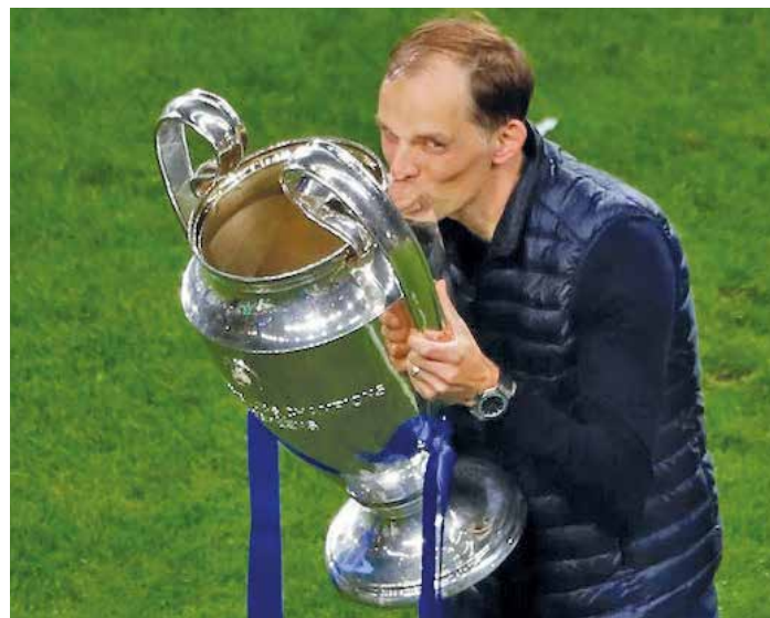
Chelsea's coach Thomas Tuchel celebrates with the Champions League trophy

"Chelsea Football Club is very happy to confirm that, following our triumph in the Champions League, Thomas Tuchel's contract has been extended by