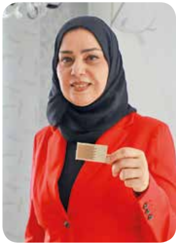
Fawzia bint Abdullah Zainal, the Speaker of the House of Representatives