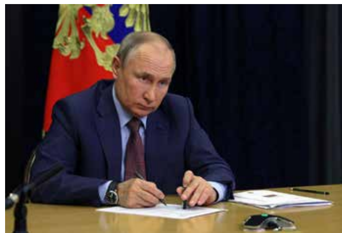
Russian President Vladimir Putin chairs a meeting with leaders of the United Russia party via a video conference

Russian President Vladimir Putin yesterday signed legislation that bars members of "extremist" organisations from running for office, a move allies of jailed Kremlin critic Alexei Navalny say aims to sideline them from parliamentary election this year.