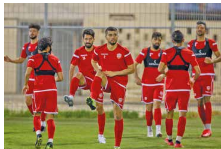
Bahrain national team players doing drills as they resumed training last night in preparation for their match with Iran on Monday

"There is no doubt that winning with this result will boost our confidence. Despite scoring eight goals, we missed chances as well and this should not hap-