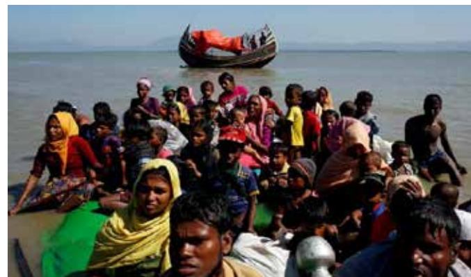
Rohingya refugees sit on a makeshift boat as they get interrogated by the Bangladesh Border Guard