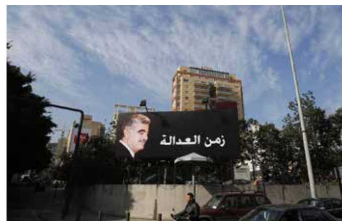
A billboard bearing a portrait of late Lebanese premier Rafic Hariri is displayed with the Arabic slogan "The Era of Justice" on a main road in the Lebanese capital Beirut (file photo)

The STL is estimated to have cost between $600 million and $1 billion since it opened in 2009.