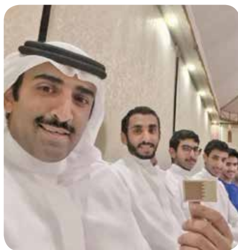
Shaikh Mohammed bin Khalifa Al Khalifa, OII Minister

Works Minister Essam Khalaf also posted thumbs up