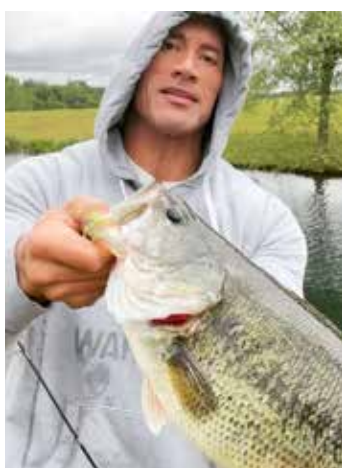
Dwayne Johnson with his fish

really quickly," he told his followers. "I just hauled out this good, I would say six, seven, possibly eight-pounder. Look at the beautiful belly on this fish, beautiful colours too as well. This is one nice healthy fish."