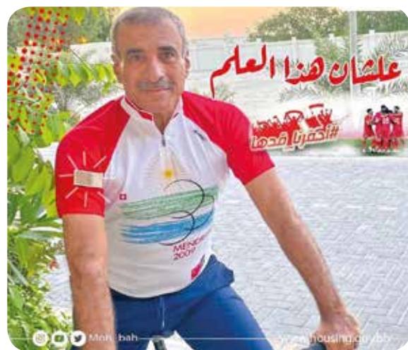
Bassem bin Yacoub Al Hamer, the Minister of Housing