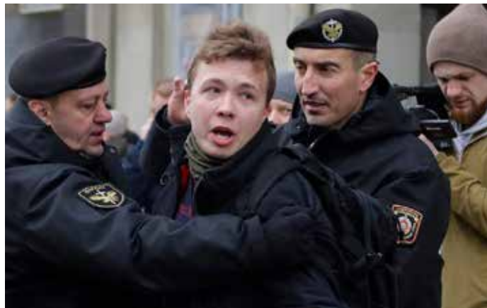
Belarus police detain journalist Roman Protasevich in Minsk (file photo) to land.