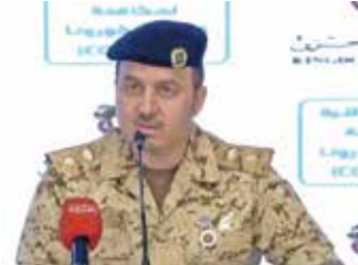
Coronavirus pandemic," he added.

"We will explain the medical and scientific aspect of the concept of the booster dose, which is one of the strategies in place for eliminating the