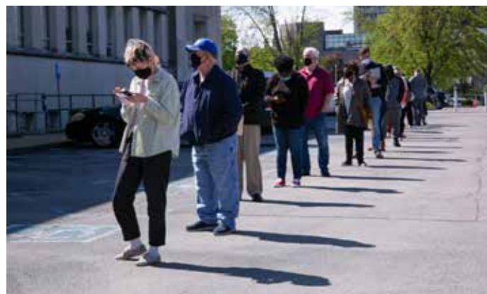
People line up outside a newly reopened career center for in-person appointments in Louisville, US

"There are still a lot of people unemployed, but there does not seem to be a lot of eagerness to