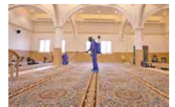
Sterilisation of mosques progressing

Separately, Health Ministry announced opening new facilities to treat COVID-19 patients who are not critical.