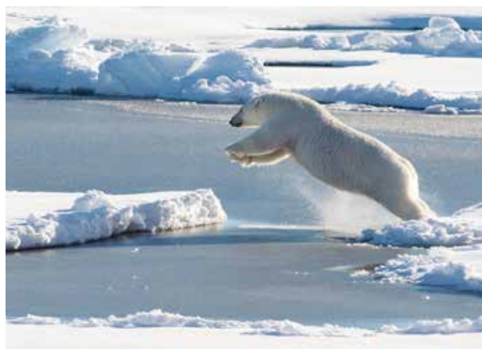
A polar bear jumps to an iceberg in the Arctic

Scientists had adjusted for this using a map of snow depth