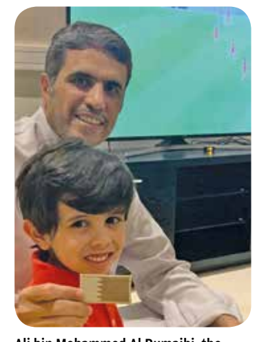
Ali bin Mohammed Al Rumaihi, the Minister of Media Affairs

for National Team on the ministry's Instagram account.