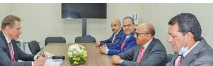
Dr Al Zayani with Mikhail Murashko, the Minister of Health of the Russia

Minister of Foreign Affairs, on enhancing bilateral and trade ties.