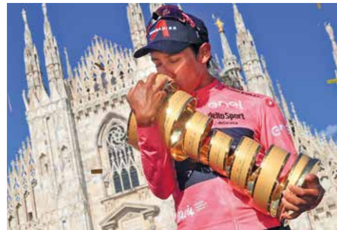
Team Ineos rider Colombia's Egan Bernal kisses the race's Trofeo Senza Fine (Endless Trophy) on the podium after winning the Giro d'Italia 2021