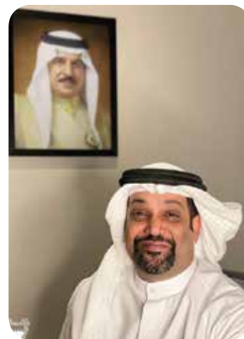
Shaikh Salman bin Khalifa Al Khalifa, the Minister of Finance and National Economy