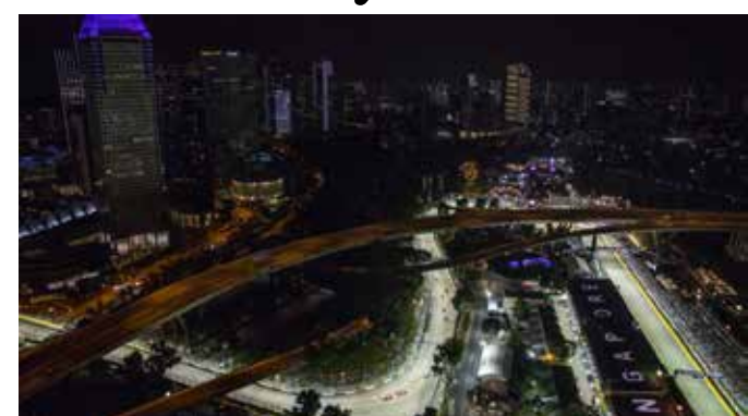
A general view during the Formula One Grand Prix of Singapore in 2018