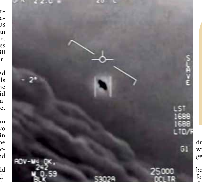
A still image from video released by the Department of Defense shows a 2004 encounter near San Diego between two Navy F/A-18F jets and an unknown object