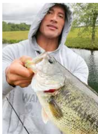
Dwayne Johnson with his fish

really quickly," he told his followers. "I just hauled out this good, I would say six, seven, possibly eight-pounder. Look at the beautiful belly on this fish, beautiful colours too as well. This is one nice healthy fish."