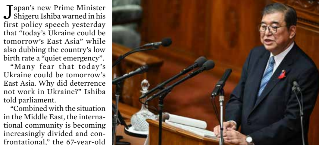
Japan's new Prime Minister Shigeru Ishiba delivers his inaugural policy address

Japan's new Prime Minister Shigeru Ishiba warned in his first policy speech yesterday that "today's Ukraine could be tomorrow's East Asia" while also dubbing the country's low birth rate a "quiet emergency."