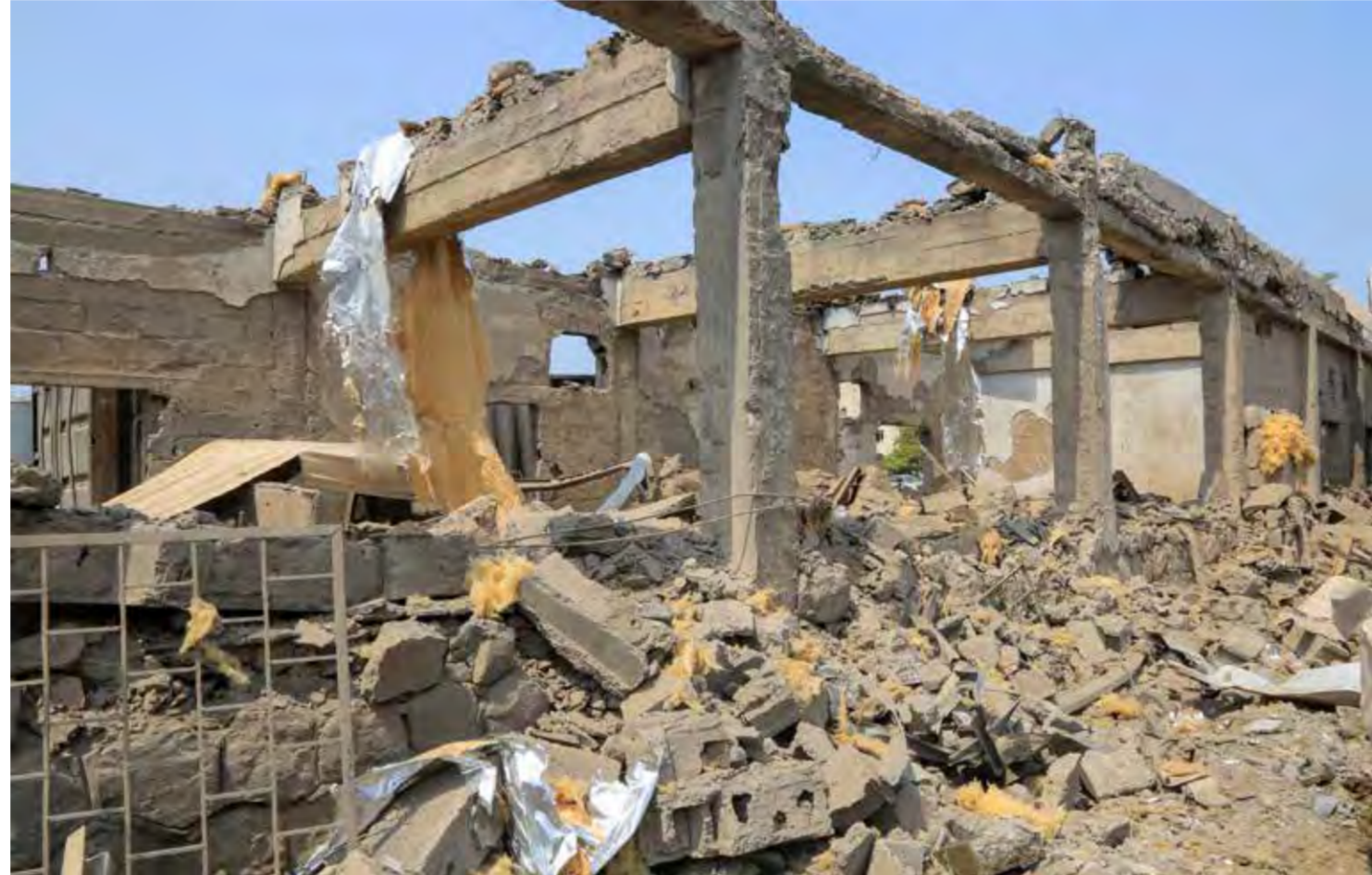
A picture shows a view of the destruction at a power station at the port in Yemen's rebel-held Hodeida city

The US and Britain have repeatedly struck Huthi targets in Yemen since January in response to attacks by the rebels on shipping in the Red Sea and the Gulf of Aden.