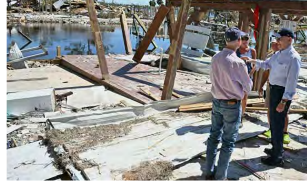
US President Joe Biden participates in a tour and briefing of an area affected by Hurricane Helene in Keaton Beach, Florida