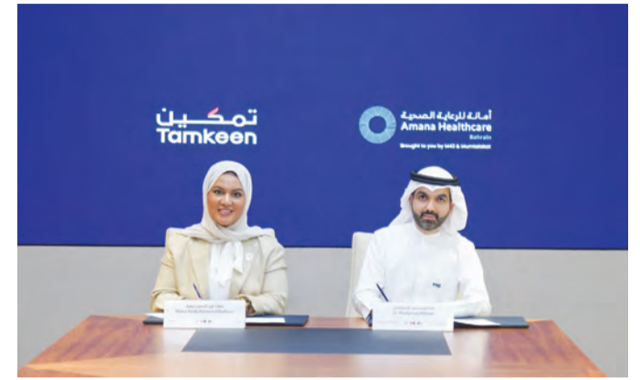
The deal signing TDT | Manama

The Labour Fund "Tamkeen" has announced its collaboration with Amana Healthcare to attract top talent to Bahrain to deliver specialized rehabilitation and long-term care services for individuals with complex medical needs. This collaboration will create promising job opportunities for Bahrainis and strengthen the Kingdom's position as a growing hub for specialized healthcare services.