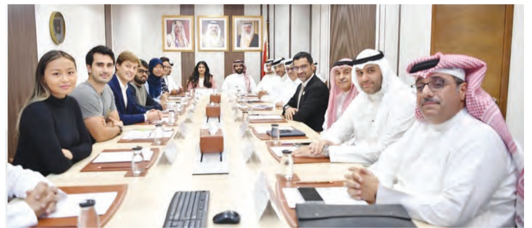
Wael bin Nasser Al Mubarak, the Municipalities Affairs and Agriculture Minister, met with a delegation from the International Institute for Management Development (IMD). The meeting reviewed the government efforts towards developing infrastructure and digital infrastructure, and developing and implementing smart city solutions. The meeting also discussed activities of the "Smart Cities Summit" organised by the ministry annually as a specialised conference in the field of AI and the transformation to smart cities.