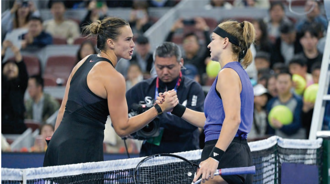
Czech Republic's Karolina Muchova (R) shakes hands after winning against Belarus's Aryna Sabalenka

Sabalenka's streak of victories saw her claim titles in Cincinnati