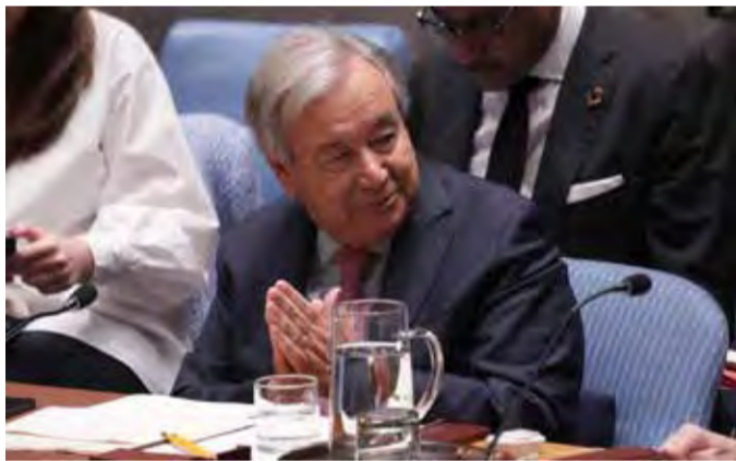
Antonio Guterres AFP | New York

The United Nations Security Council offered its full support to Secretary-General Antonio Guterres, after Israel said he was "persona non grata" for not quickly condemning Iran's ballistic missile barrage.