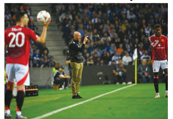
Manchester United's coach Erik Ten Hag speaks to Marcus Rashford (R)