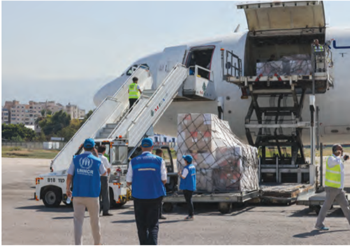
Ground staff unload a medical aid shipment provided by the World Health Organization (WHO) and the United Nations High Commissioner for Refugees (UNHCR), from a plane at the Beirut International Airport

"An airlift... landed in Beirut earlier this morning with 30 metric tonnes of trauma and surgical supplies, enough to treat tens of thousands people," the World Health Organization's regional director Hanan