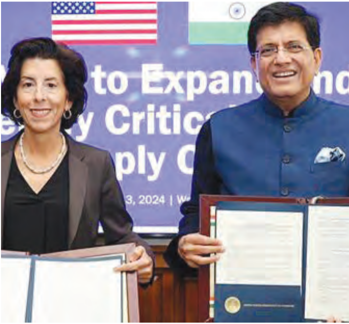
Union commerce and industry minister Piyush Goyal exchanges MoUs with US secretary of commerce Gina Raimondo at the 6th India-US Commercial Dialogue in Washington DC on Thursday.

Both sides will also identify ways to facilitate "commercial development of US and Indian critical minerals exploration, extraction, processing and refining, recycling, and recovery,"