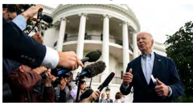
U.S. President Joe Biden speaks to the press