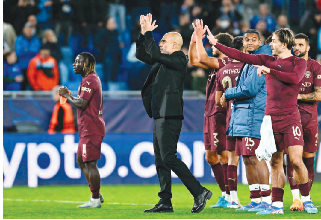
Manchester City's Spanish manager Pep Guardiola (C) and players celebrate with fans

The English champions deny any wrongdoing, claiming they have a "comprehensive body of irrefutable evidence" to clear their name as they battle to avoid a potential points deduction or even expulsion from the Premier League.