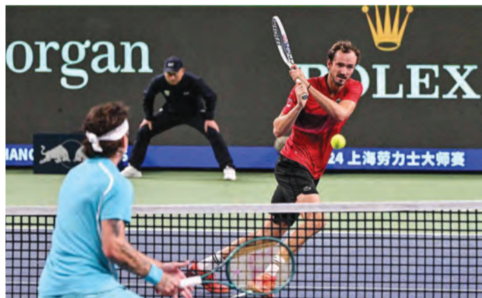
Russia's Daniil Medvedev (R) hits a return to Brazil's Thiago Seyboth Wild (L)

But Medvedev persevered, making up the gap and then getting a crucial break in the 11th game, before winning the set 7-5.