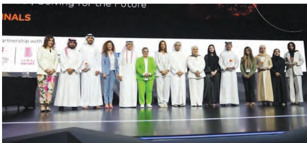
In pictures, the Bahrain Fintech Forward 2024, held at Exhibition World Bahrain.

The final event was attended by Noor bint Ali Al Khulaif, Minister of Sustainable Development and Chief Executive of the Bahrain Economic Development Board, and Rawan bint Najeeb Tawfiqi, Minister of Youth, alongside industry experts.