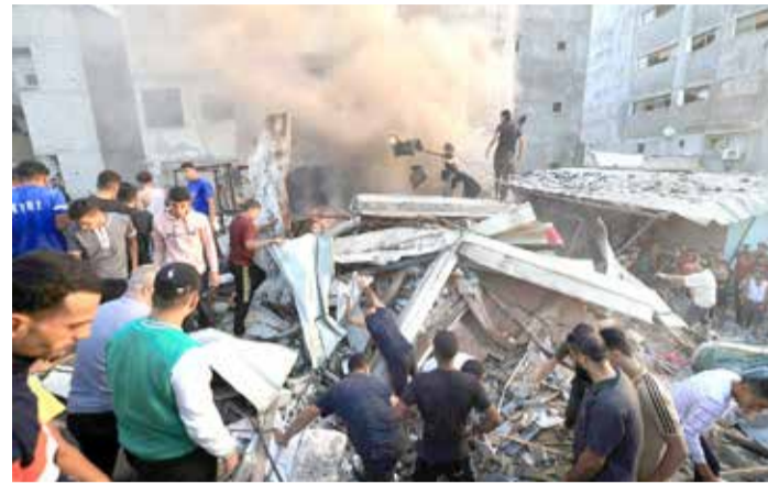
Palestinian search through the rubble of a collapsed building looking for victims and survivors following a strike by the Israeli military on Khan Yunis

The United Nations agency for Palestinian refugees said its school is being used as a "shelter