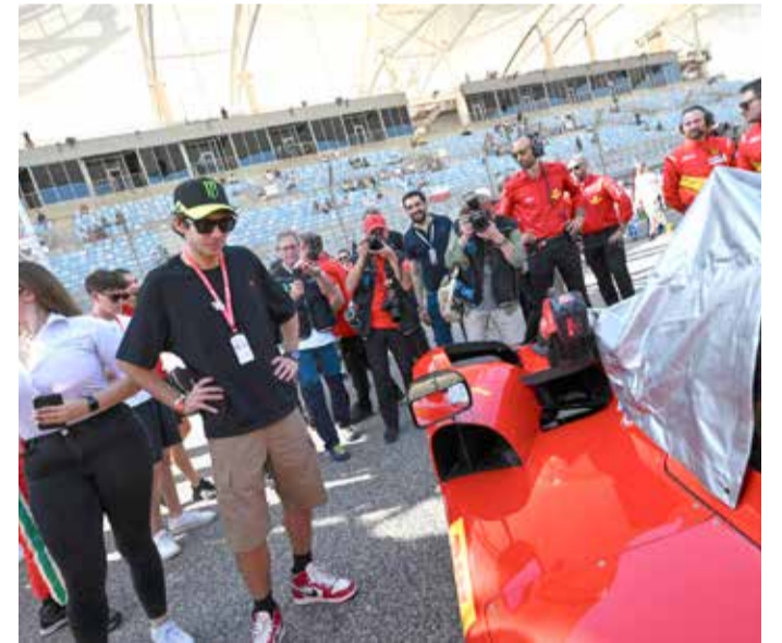
Valentino Rossi on the grid ahead of yesterday's Bapco Energies 8 Hours of Bahrain

There are a total of 18 cars set to take part in Sunday's pro-