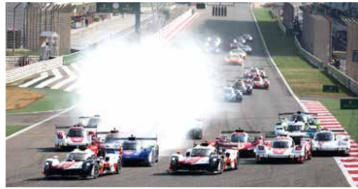
The Toyota Hybrids lead the 36-car WEC field into the first turn after the start of yesterday's race