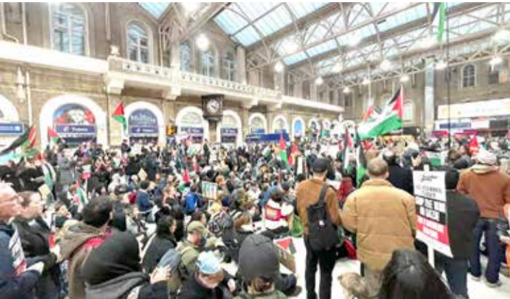
Demonstrators take part in a protest inside Charing Cross station in London