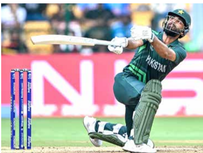
Pakistan's Fakhar Zaman plays a shot

Set a mammoth 402-run target initially, Zaman lifted Pakistan to 160-1 after 21.3 overs before a 90-minute stoppage due to rain led to a revised target for Pakistan.