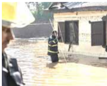
Rescuers search for people trapped during a flood

Bridges and roads have been destroyed by the downpour, making it difficult to reach affected households, the Somali Regional State Communication Bureau said in a statement, with damage to livestock, crops and