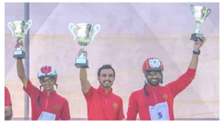
Winners celebrate with their trophies

Team Victorious dominated the podium of the 120km race as