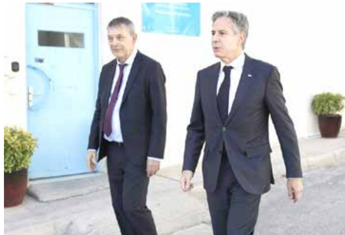
US Secretary of State Antony Blinken (R) walks next to UN Relief and Works Agency for Palestine Refugees in the Near East (UNRWA) Commissioner-General Philippe Lazzarini in Amman

In Turkey, Blinken would "underscore the importance of