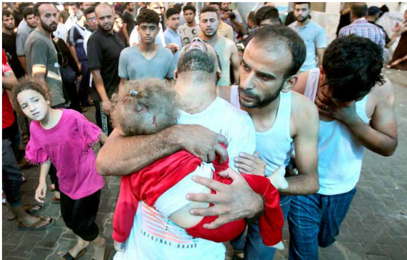
A man reacts as he carries a toddler into the Al-Shifa Hospital following the bombing by the Israeli military of a home in Gaza City's Mansura neighbourhood, in the eastern suburb of Shujaiya

The primary goal of these text messages is to establish a direct line of communication with citizens and residents during emergencies, ensuring swift and efficient dissemination of critical information.