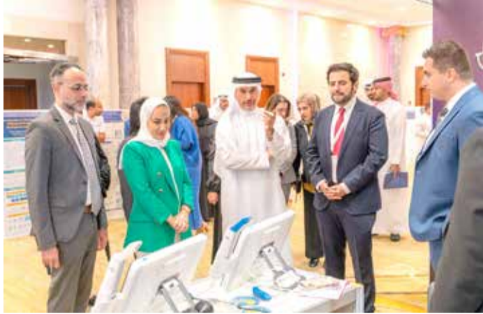
Participants during the conference

Speaking during the closing ceremony, she highlighted their focus on regular examinations, raising awareness, ed-