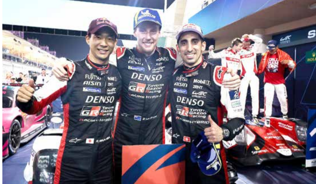
Toyota Gazoo Racing's #8 crew of, from left, Ryo Hirakawa, Brendon Hartley and Sebastien Buemi celebrate their race win and title triumph

The winners per category were awarded their respective trophies in the podium ceremonies at the end of all the action. Handing over the trophies were