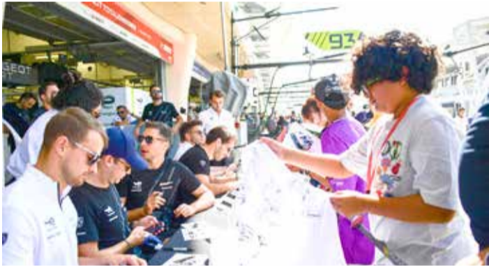
Fans have memorabilia signed by WEC drivers in the autograph session