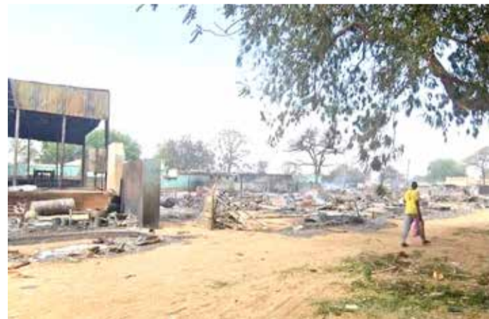
A man walks past a devastated market area in al-Fasher, the capital of Sudan's North Darfur state

In nearly seven months of war, more than 10,400 people have been killed, according to a conservative estimate from