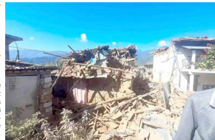
Damaged houses lie in ruins, in the aftermath of an earthquake at Pipaldanda village of Jajarkot district

"I thought we were going to die," he added. "No one has an-