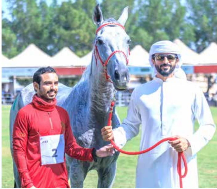
HH Shaikh Nasser bin Hamad Al Khalifa with a winner