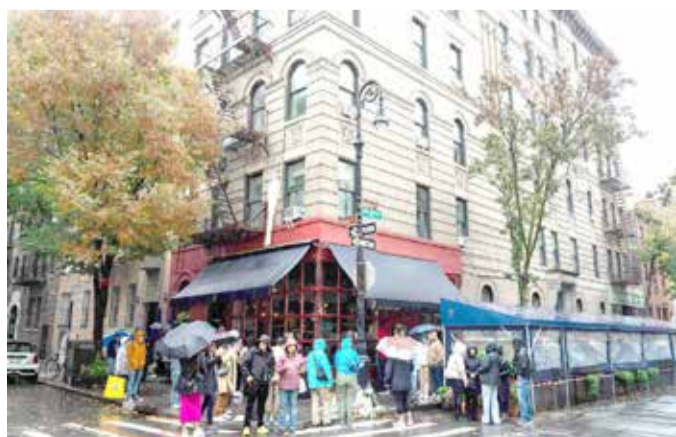
People stand in line to pay tribute to actor Matthew Perry outside the apartment building which was used as the exterior shot in the TV show "Friends" in New York

TMZ cited sources saying that no illicit drugs were found at his home, although several medications were discovered including antidepressants and anxiety medication.