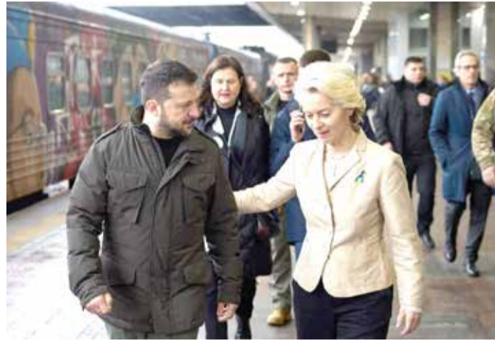
Ukraine's President Volodymyr Zelensky (L) greets EU Commission President Ursula von der Leyen (R) at the railway station in Kyiv

With the war now in its 20th month and Ukraine struggling to gain ground in its counter-