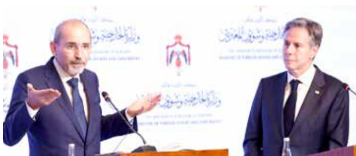
US Secretary of State Antony Blinken (R) and Jordanian Deputy Prime Minister and Foreign Minister Ayman Safadi hold a press conference

Speaking at a news conference in Amman about sparing civilians and speeding up aid deliveries, the US top diplomat