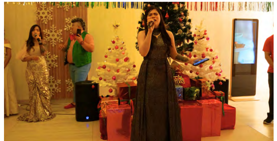
La Rosa Hotel in Juffair marked the festive season with a dazzling Christmas Tree Lighting Celebration yesterday. The event featured live performances, vibrant decorations, and a visit from Santa Claus, bringing joy to attendees. Staff members, dressed in festive attire, joined in the celebrations, spreading holiday cheer and camaraderie.