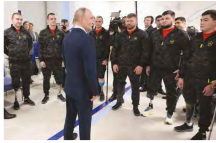
Russia's President Vladimir Putin visits a prosthetic and rehabilitation centre for service members who were wounded while participating in the Russian military action in Ukraine, in Moscow