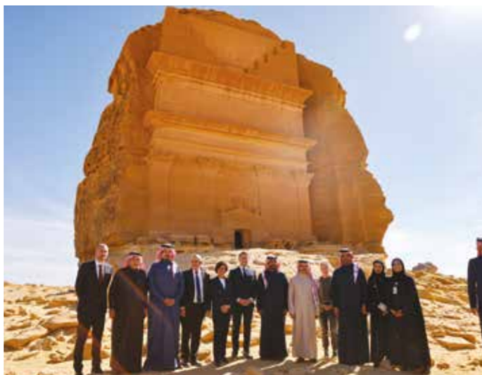
French President Emmanuel Macron (C) poses for a picture with members of his delegation and Saudi officials during a visit to the archaeological site of al-Hijr (Hegra), near the northwestern Saudi city of AlUla

President Emmanuel Macron completed his state visit to Saudi Arabia yesterday as France's government faced being ousted in a no-confidence vote. Macron flew out after viewing the ancient AlUla heritage site, a cornerstone of the conservative country's nascent tourism industry, at the end of his three-day tour. The first French state visit to Saudi Arabia since 2006 came against the backdrop of a major political crisis that threatens to force out the minority government of Prime Minister Michel Barnier. An evening no-confidence vote, after Barnier forced through a social security financing bill using executive powers, could topple a French government for the first time in more than 60 years. The turmoil follows a snap parliamentary election called by Macron in the summer that left the far-right National Rally as the largest single party in the National Assembly but with no faction holding a majority. Speaking to travelling reporters on Tuesday, Macron rejected