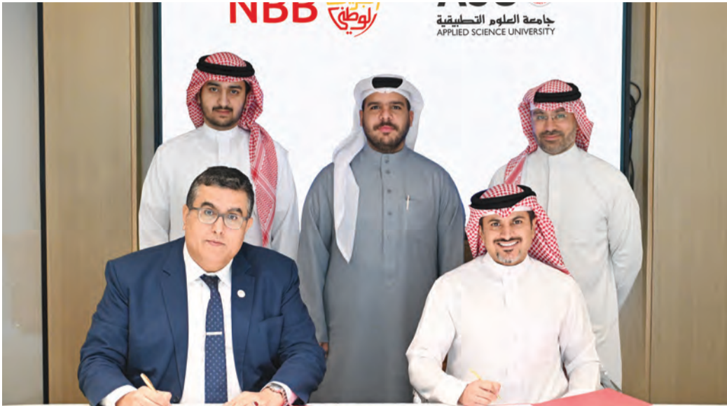
NBB and ASU officials sign the agreement