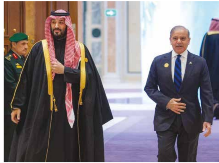
environmental issues, particularly water scarcity and drought, which pose serious threats to societies worldwide. He emphasized that the summit coincides with Saudi Arabia's hosting of the 16th Conference of the Parties of the United Nations Convention to Combat Desertification (UNCCD COP16), highlighting the critical link between combating land degradation and securing sustainable water resources. He noted that the global water sector is facing unprecedented challenges, including prolonged droughts, increasing desertification, and declining availability of fresh water. These challenges necessitate collective international efforts to develop sustainable solutions and secure water resources for future generations. HRH the Crown Prince highlighted Saudi Arabia's leadership in addressing these issues, citing the Kingdom's introduction of water issues to the G20 agenda during its presidency in 2020. He also outlined the Kingdom's commitment of over $6 billion to more than 200 water development projects across 60 developing countries. Looking to the future, he announced the Kingdom's preparations to host the 11th World Water Forum in 2027 in collaboration with the World Water Council. He also introduced a groundbreaking initiative: the establishment of a global water organization headquartered in Riyadh. This organization aims to unite international efforts, foster innovative solutions, and promote collaboration to address global water challenges comprehensively. He concluded by inviting United Nations member states, international organizations, and private sector stakeholders to join the newly announced organization. He expressed hope that the collective efforts of the international community would lead to meaningful progress in addressing water challenges worldwide. The One Water Summit gathers governments, international organizations, financial institutions, and private sector representatives to explore actionable solutions to the global water crisis. With climate change, biodiversity loss, and pollution exacerbating water-related challenges, the summit also serves as a preparatory platform for the United Nations Water Conference in 2026.

His Royal Highness Prince Mohammed bin Salman bin Abdulaziz Al Saud, Crown Prince and Prime Minister of Saudi Arabia, inaugurated the One Water Summit. The summit was held under the joint chairmanship of HRH the Crown Prince, President Emmanuel Macron of France, President Kassym-Jomart Tokayev of Kazakhstan, and World Bank President Ajay Banga. It brought together international leaders to address global water challenges, according to the Saudi Press Agency (SPA). During his opening remarks, HRH the Crown Prince reaffirmed Saudi Arabia's commitment to advancing global solutions to water scarcity and environmental challenges. He welcomed attendees to Saudi Arabia and conveyed the greetings of the Custodian of the Two Holy Mosques King Salman bin Abdulaziz Al Saud. He underscored the significance of the One Water Summit as a platform to address pressing