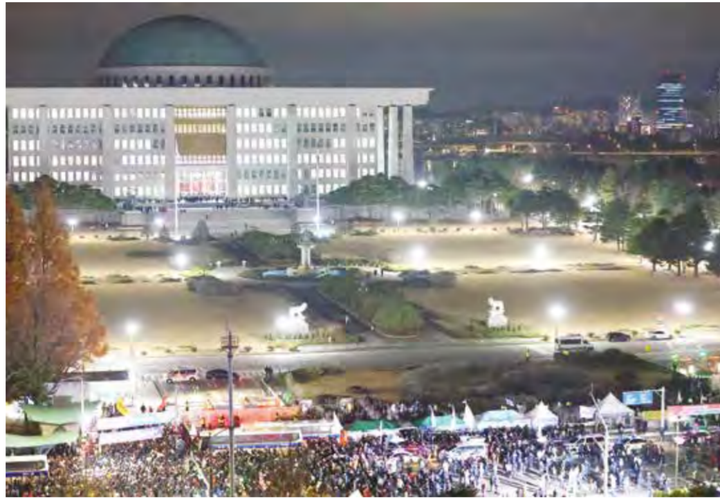
People gather outside the National Assembly in Seoul, after South Korea President Yoon Suk Yeol declared martial law. South Korea's President Yoon Suk Yeol on December 3, declared martial law, accusing the opposition of being "anti-state forces"

AFP | Seoul, South Korea After jumping fences and tussling with security forces to get into parliament and vote down the martial law overnight, South Korea's opposition lawmakers have filed a motion to impeach Yoon. The motion says Yoon "gravely and extensively violated the constitution and the law" and accuses him of imposing martial law "with the unconstitutional and illegal intent to evade imminent investigations... into alleged illegal acts involving himself and his family". Lawmakers could vote on the motion as soon as the early hours of Friday morning and Yoon's prospects look bleak. The opposition holds a large majority in the 300-member parliament and needs only a handful of defections from the president's party to secure the two-thirds majority needed to pass the motion. The main opposition Democratic Party has also filed a complaint of "insurrection" against the president, some of his ministers and top military and police officials -- which can carry a penalty of life imprisonment or even death. In a show of public anger with the president, thousands of protesters converged around his office in central Seoul on Wednesday evening after staging a rally in Gwanghwamun Square, demanding Yoon quit.