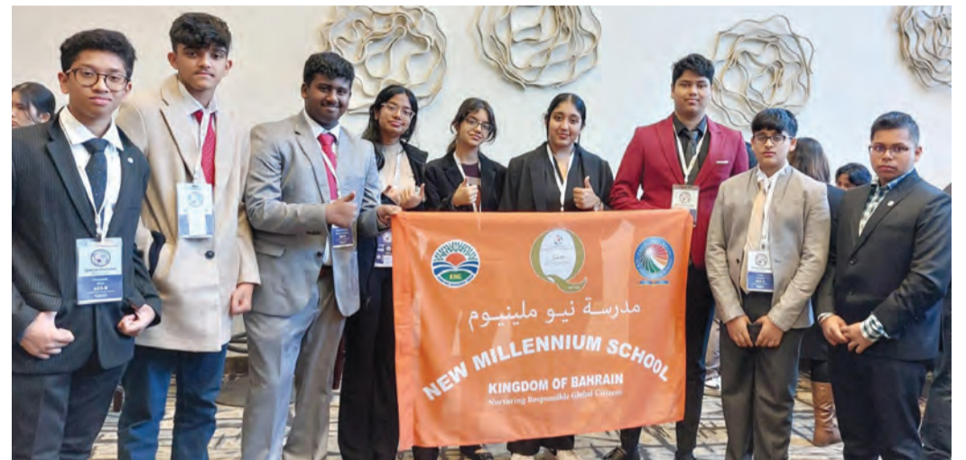
TDT | Manama

Scholars from New Millennium School (NMS) have once again demonstrated their academic prowess and commitment to excellence at the prestigious Tournament of Champions 2024, hosted by the World Scholar's Cup (WSC) at Yale University from November 12th to 18th.