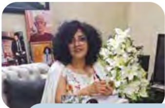
Iran frees Nobel winner for three weeks, sparking calls for 'permanent' release