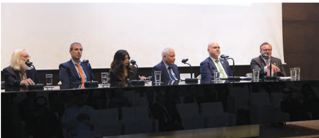
TDT | Manama

The American University of Bahrain (AUBH), in collaboration with “Search” -Shaikh Ebrahim Bin Mohammed Al Khalifa Center for Culture and Research, recently hosted an event to commemorate the 70th anniversary of the founding of the European Organization for Nuclear Research (CERN).