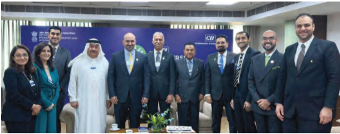
Officials at the summit during a photocall

He highlighted that India presents valuable opportunities for