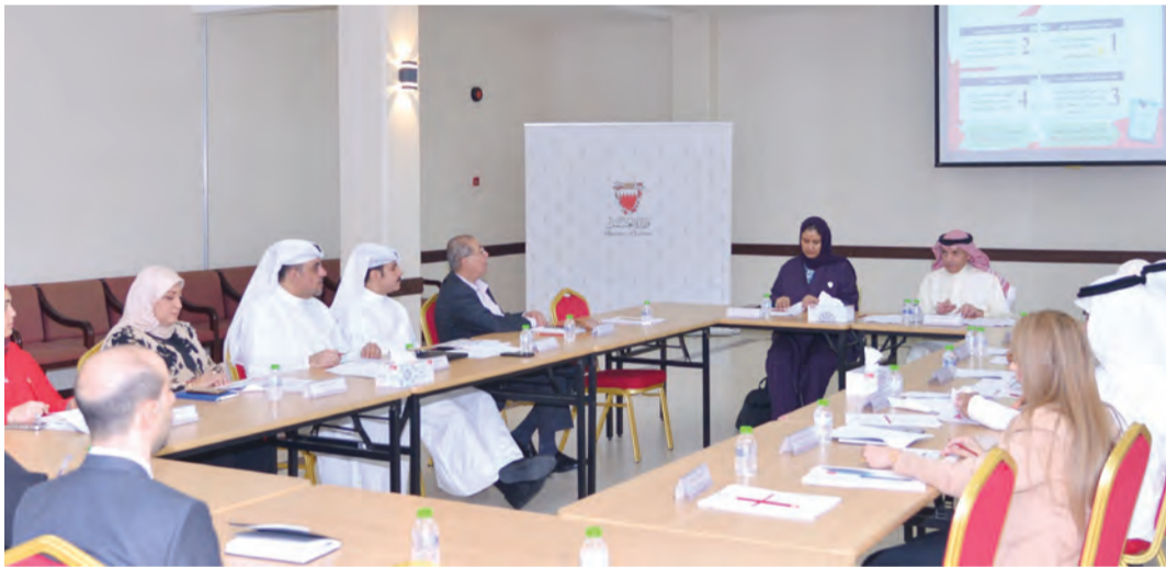
The Bahrain Experts National Platform Committee holds its first meeting at the Ministry of Labour

Initially, the platform is prioritising six strategic fields - financial services, insurance and banking, healthcare, manufacturing industries, information and communications, engineer-