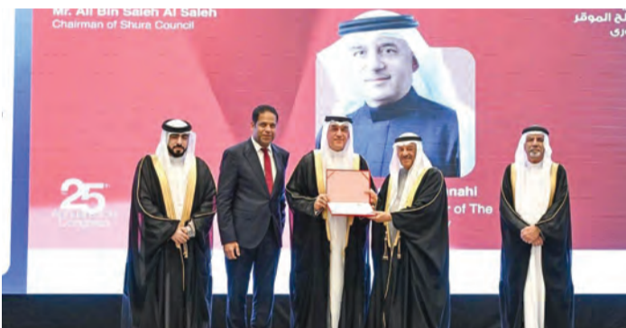
The award ceremony

ed as a speaker in the event's prominent panel discussion, "CEOs' Expectations of HR," where he shared valuable insights on aligning HR strategies with organizational objectives, inspiring industry leaders to adopt innovative and strategic