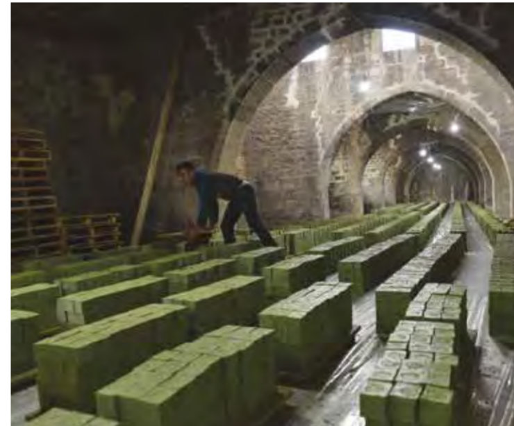
A Syrian worker stacks laurel soap at the Jbaili soap factory, an 800 year old artisanal soap manufacturer, in the old city of Syria's northern city of Aleppo

The UN's cultural organisation added Aleppo's famous soap to its intangible cultural heritage list Tuesday with Syria's second city again wracked by war. Artisans have brewed olive and laurel oil in large pots for some 3,000 years in the city -- which fell to Islamist-led rebels last week -- allowing the mixture to cool before cutting it into blocks, and stamping them by hand. Aleppo soap joins the city's traditional music, Al-Qudoud al-Halabiya, on UNESCO's list of intangible cultural heritage, while the city itself -- declared a world heritage site in 1986 -- was added to the organisation's endangered list in 2013 amid the country's civil war. Makers craft the product using "traditional knowledge and skills", said UNESCO, adding they rely on a mix of natural, locally produced ingredients and a drying process that can take up to nine months. Aleppo had been slowly recovering from the wounds inflicted by more than a decade of civil war when Islamist-led rebels captured the city last week in a shock offensive that put forces loyal to Syria's President Bashar al-Assad to flight. Of the 100 soap factories in the city only about 10 remain, with many having relocated to Damascus or neighbouring Turkey. But the soap remains essential to the families and communities involved in the trade. "The collaborative production process promotes community and family unity," said UNESCO.