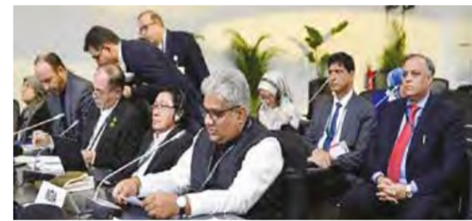
Bhupender Yadav

Union Minister for Environment, Forests, and Climate Change, Bhupender Yadav, articulated India's extensive efforts in tackling land degradation during the Ministerial Dialogue on Drought Resilience at CoP16 of the UNCCD held in Riyadh, Saudi Arabia. He detailed India's evolving journey in addressing environmental challenges, which aligns with the core objectives of the UN Convention to Combat Desertification. Yadav stressed the pivotal connections between desertification and socio-economic issues such as poverty. Underlining India's recognition of land degradation during previous COP meetings, he noted that during India's presidency at CoP 14, the country committed to restoring 26 million hectares of degraded land by 2030. This was seen as part of India's broader commitment to sustainable development and climate change adaptation. The minister applauded India's achievements, including the establishment of a Centre of Excellence on Sustainable Land Management. He also highlighted the support for the G-20's ambitious goal of planting 1 trillion trees by 2030, thereby strengthening carbon sinks. Yadav stressed the importance of proactive strategies to prevent and prepare for droughts while highlighting institutions like ISRO and National Remote Sensing Centre for their roles in offering invaluable drought management assessments and warnings.