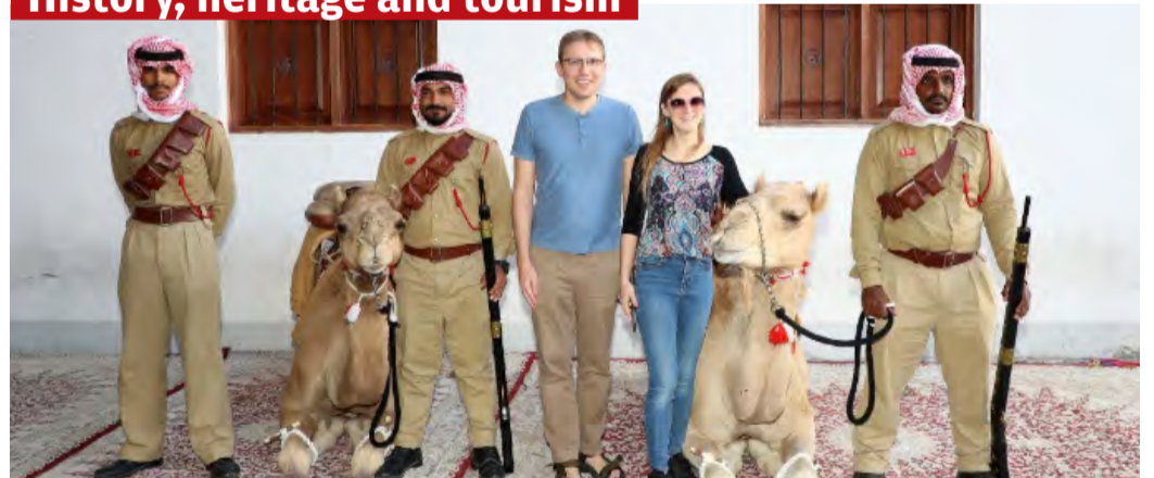
The Police Directorate has held an event at Bab Al Bahrain to inform visitors of this landmark in the history of Bahraini police and the forces' role in protecting security and general order. The event was held in cooperation with the Bahrain Tourism and Exhibitions Authority (BTEA) and some directorates of the Interior Ministry. The event included a parade of mounted police and a display of the old uniforms of Bahraini police personnel. The event aimed to highlight Bahraini heritage, and enhance the tourism experience.