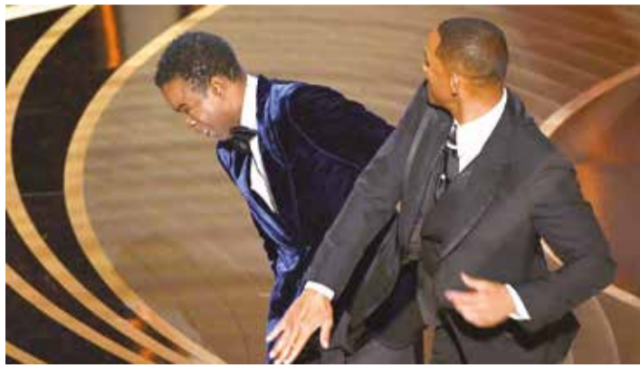
Will Smith (R) slaps Chris Rock onstage during the 94th Oscars

"Will Smith is significantly bigger than me. Will Smith played Muhammad Ali in a movie. You think I auditioned for