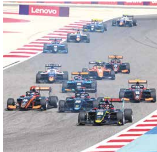
Action from the F3 Feature Race