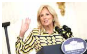
Washington, United States

US First Lady Jill Biden on Monday tested positive for Covid-19, the White House said. President Joe Biden tested negative. The 72-year-old first lady is experiencing "only mild symptoms," her office said, and will remain in the couple's home in Rehoboth Beach, Delaware. Jill Biden last tested positive for Covid a year ago. President Biden, 80, was administered a Covid test Monday evening and tested negative, the White House said, adding that he will continue regular testing and monitor for symptoms. The United States has been experiencing a rise in Covid cases and hospitalizations in recent weeks.