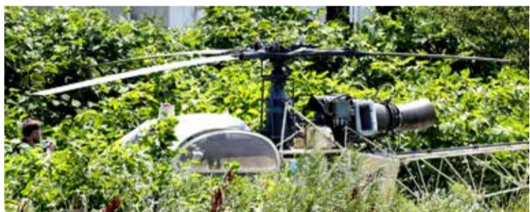
French helicopter Alouette II abandoned by French armed robber Redoine Faid after his escape from prison in Reau

cell to the waiting helicopter, which took off without any shots being fired. The entire operation took 10 minutes. Police later found the helicopter abandoned. He was re-captured three months later, hiding in the home of friend of a relative. Faid, who broke out of jail once before in 2013, taking warden's hostage and blowing up the prison gate, faces life imprisonment for the repeat offence. He has a history of robberies involving armoured vehicles and hostage-taking and at the time of