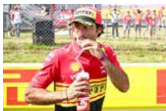
Carlos Sainz Jr

Two men stole his watch, worth at least an estimated