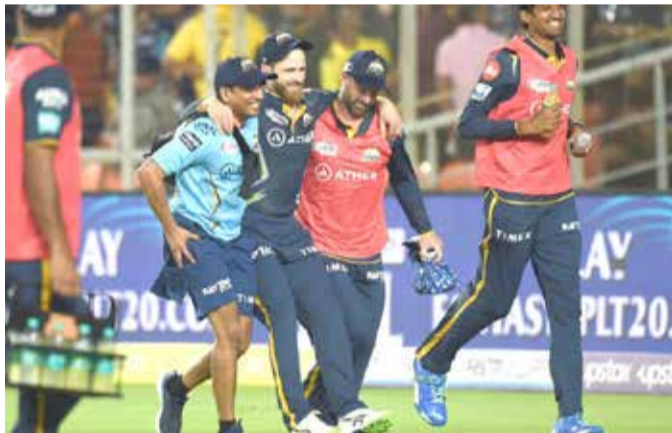
Gujarat Titans' Kane Williamson (C) is helped by teammates back to Pavilion after he was injured during the Indian Premier League