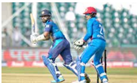
Sri Lanka's Kusal Mendis plays a shot