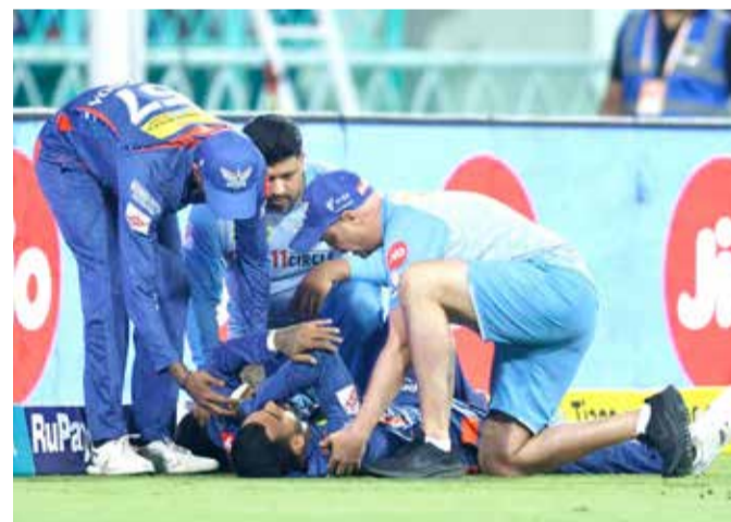
Lucknow Super Giants' KL Rahul (C) is being helped by a medic during the Indian Premier League