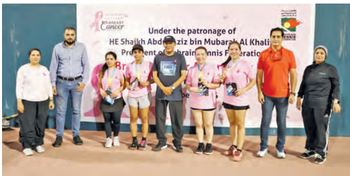
Officials with the players during the awarding ceremony

The event highlighted the Women's Committee's ongoing dedication to social responsi-