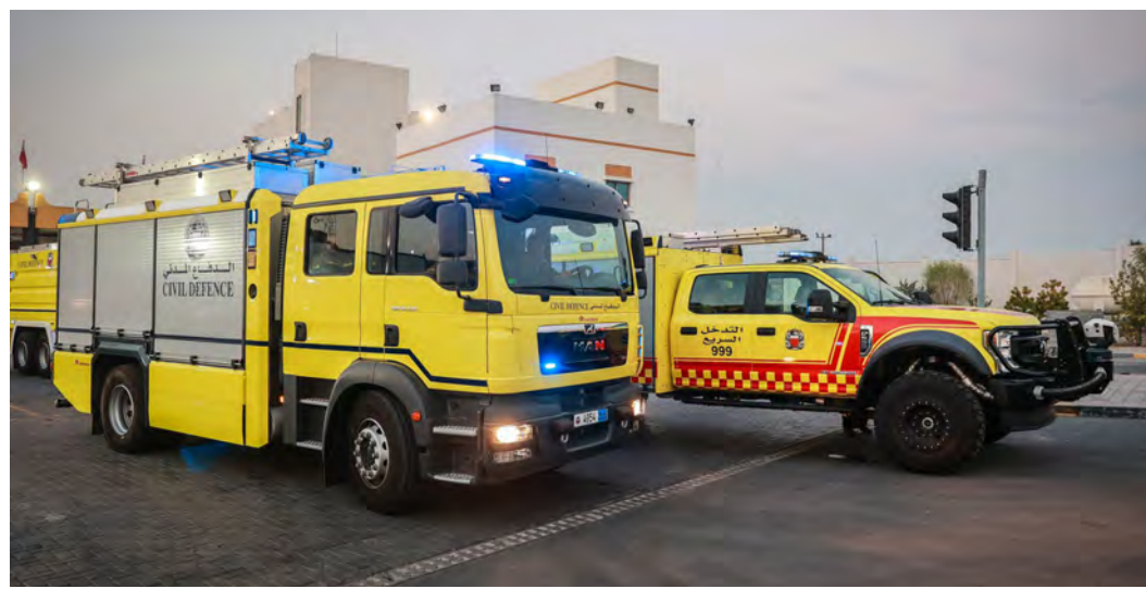
The emergency responders remain vigilant and ready to assist the community in times of need

Despite this minor decline in overall call volume, the figure still represents a considerable and demanding workload for