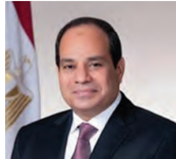
President El Sisi

HRH the Crown Prince and Prime Minister also sent a similar cable to Prime Minister Dr. Mostafa Madbouly.