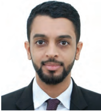
The family's lawyer

According to the case files, medical assessments deter-