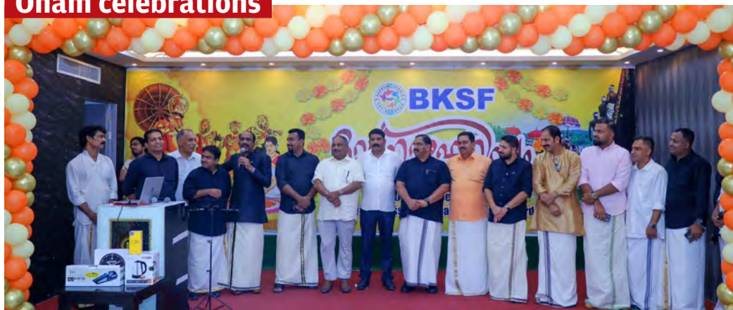
The Bahrain Kerala Social Forum (BKSF) conducted Onam Celebration at K City Business Centre Party Hall Manama. Among the 750 attendees, 200 were Indian social workers. Celebrations included cultural, arts and sports activities followed by OnaSadhya, the feast.