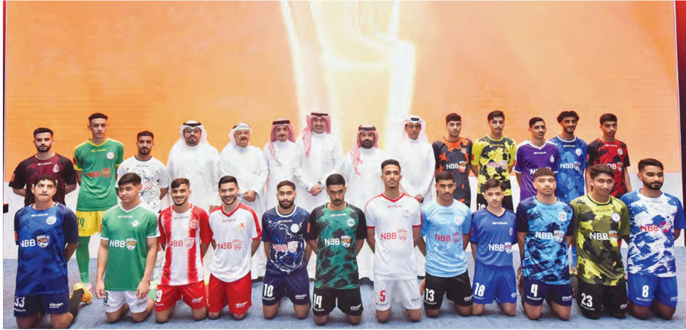
NBB and BFA officials with key figures from Bahrain's sports community