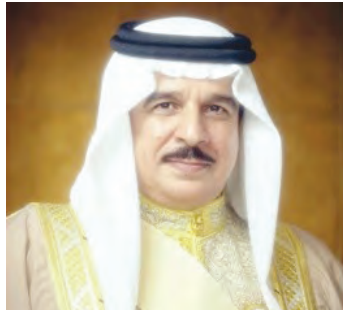
HM the King

Egypt celebrates the 6th of October anniversary, marking the 1973 war victory, and symbolizing national pride and military achievements.