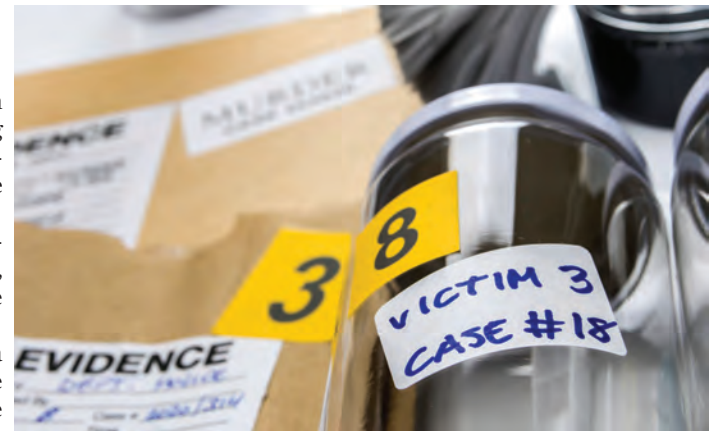
Part of the evidence

The complainant attempted to justify these messages by claiming she was only trying to buy time.