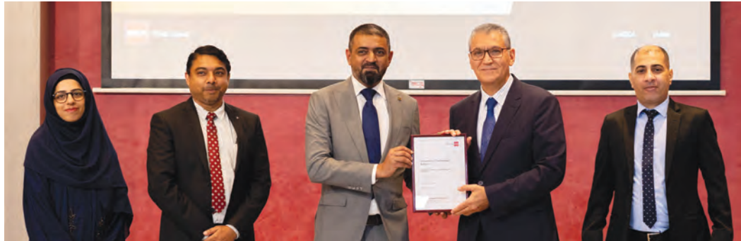
UTB officials receive the ACCA recognition certificate

The ACCA exemption offers students a fast-track route to becoming ACCA-qualified professionals by exempting them from specific ACCA exams. UTB's BS in Accounting and Finance programme will allow students to achieve global recognition in