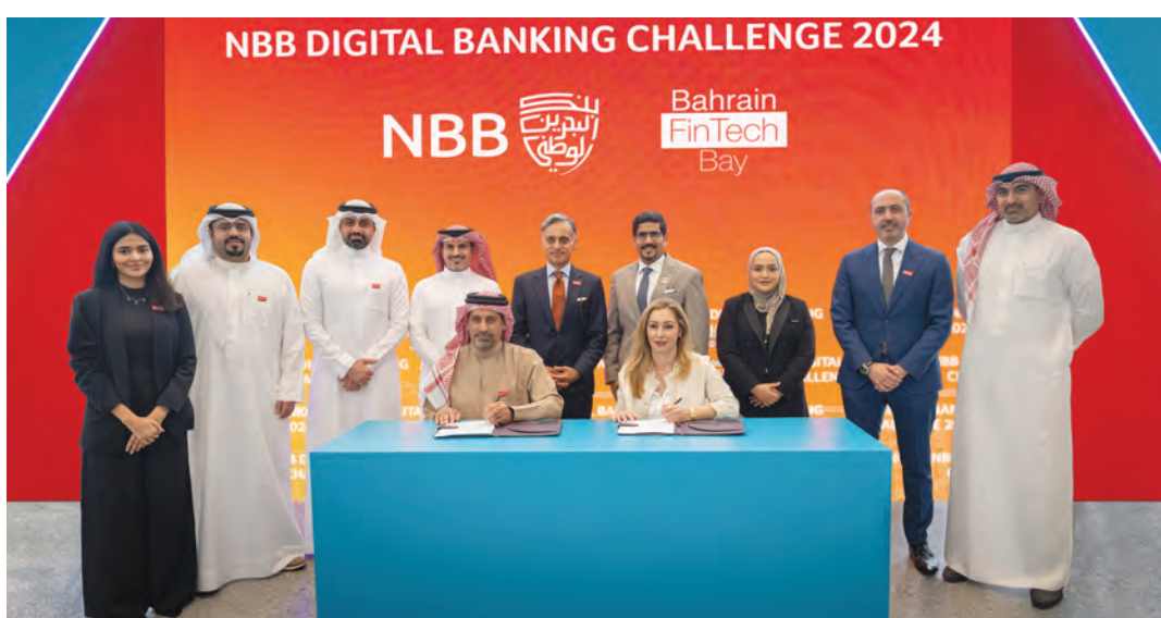
Officials during a photocall after the launch ceremony

Building on the success of the inaugural cohort, the NBB Digital Banking Challenge 2024 invites aspiring innovators aged 18 to 24 to develop sustainable banking solutions. The initiative provides attendees with the chance to win