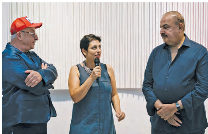
Rashid bin Khalifa Al Khalifa with visitors at the event

pays homage to Bahrain's maritime history, intertwining rhythmic repetition with the island's cultural heritage.