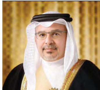
HRH Prince Salman