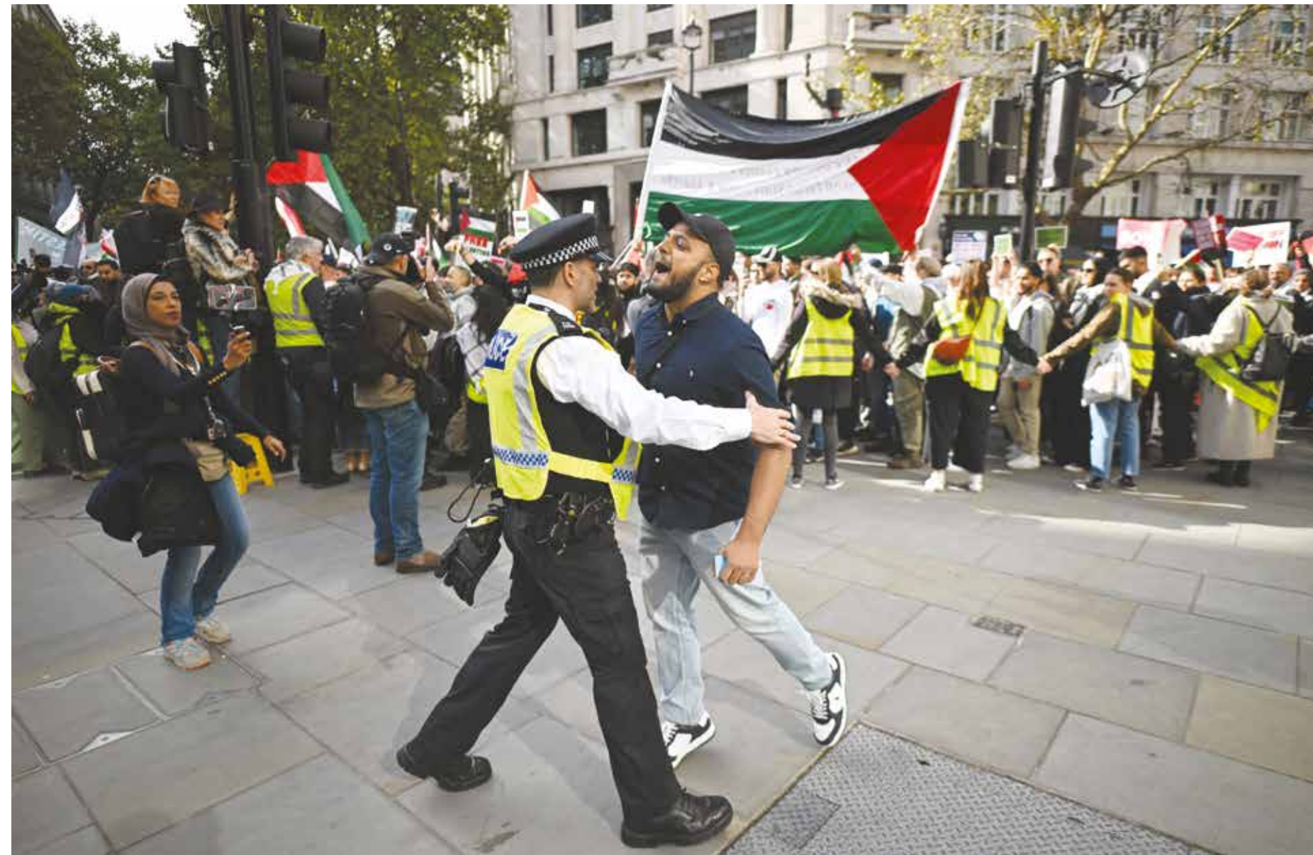
A police officer restrains a pro-Palestinian activists attempting to get closer to pro-Israeli counter demonstrators, during a March for Palestine in central London