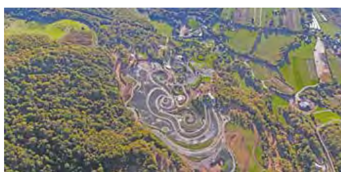
The "Starry Night" park, near Central-Bosnian town of Visoko