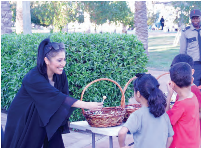
MP Al Dhaen with the Southern Governorate officials, Isa Town's Rubber Walkway locals, and children

al importance of tree planting, saying: "Bringing back the tradition of planting trees in our communities is vital. It's part of our heritage, something Bahrainis have valued for generations."