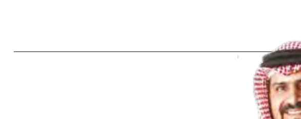
CAPTAIN MAHMOOD AL MAHMOOD