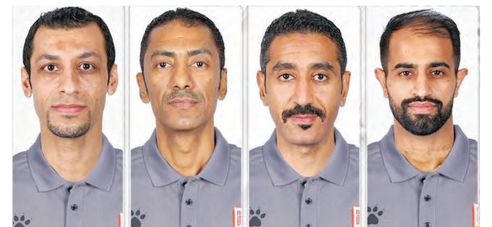
Bahraini refereeing team members