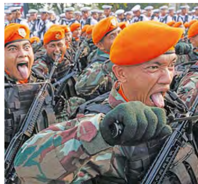
Soldiers take part in a military parade during celebrations marking the 79th anniversary of the Indonesian Armed Forces (TNI) in front of the National Monument (MONAS) at Merdeka Square in Jakarta