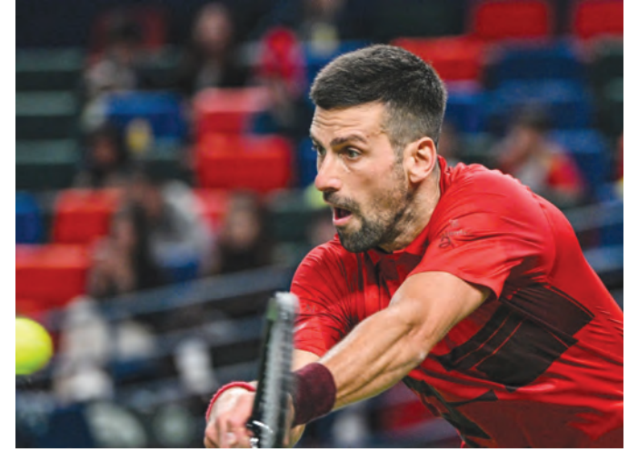
Novak Djokovic in action | Shanghai

Novak Djokovic said it took time to "get the rust off" as he fought through two tiebreaks to make his way into the third round of the Shanghai Masters yesterday.