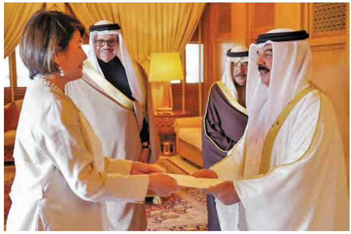
HM the King receives the new ambassadors' credentials

The ambassadors conveyed the greetings of the heads of dant health and happiness and manitarian Work and Youth Af- ala, Royal Protocols Chief. HM King Hamad wished the Bahrain and its people further