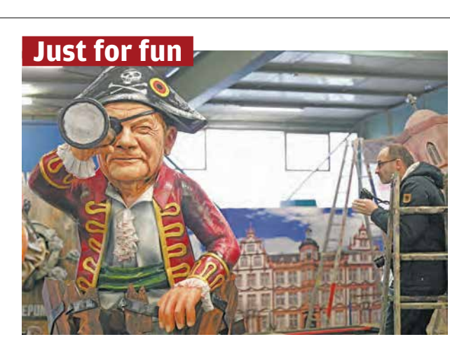
A carnival float depicting German Chancellor Olaf Scholz wearing an eyepatch and trying to look from a platform is pictured ahead a press conference on the shrove monday procession of the carnival season in Mainz.