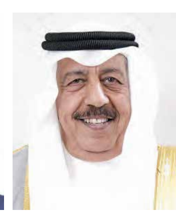
MP Najib Al Kuwari