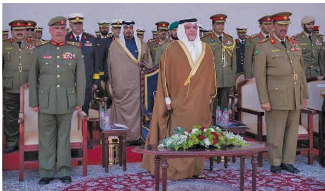
HRH Prince Salman with senior BDF and government officials at the event

He expressed his congratulations to Field Marshal Shaikh Khalifa bin Ahmed, and the BDF's personnel, on the 56th anniversary of the establishment of the BDF.