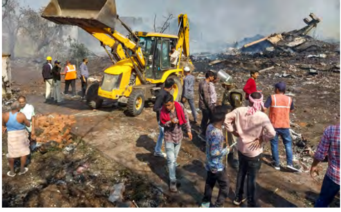
Rescue personnel and local residents gather near a firecracker plant following an explosion at Harda district in India's Madhya Pradesh state