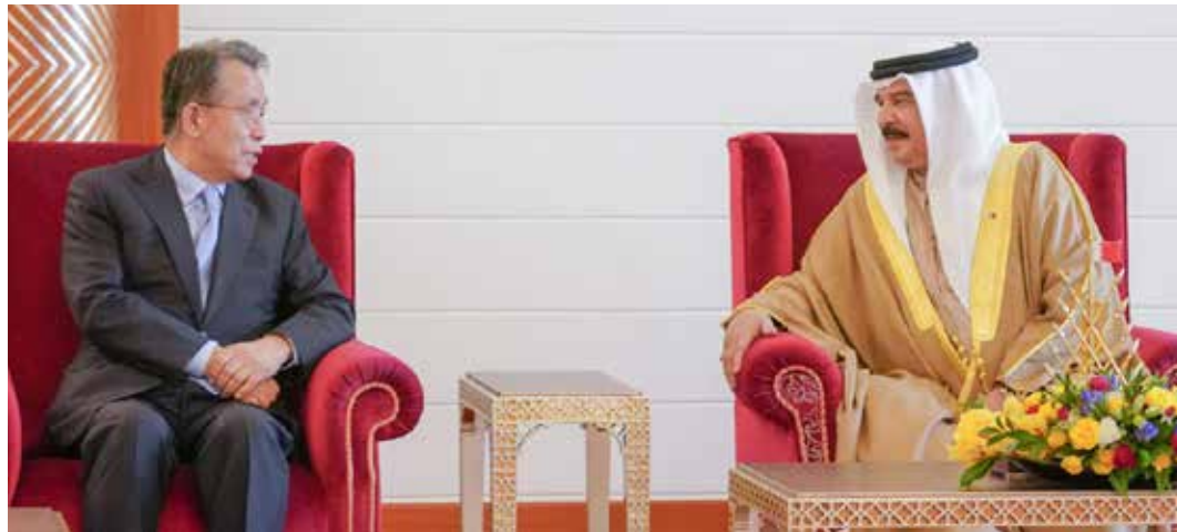
HM the King receives the former UNGA presidents

The delegation of the UNGA former presidents comprised CPUNGA Chairman, President of the 56th session Dr Han Seung-soo, Deputy Chairman and