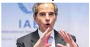
UN nuclear watchdog chief Rafael Grossi

Production will jump to more than 34 kilogrammes of highly enriched uranium per month, compared to 4.7 kilogrammes previously, added the report to the IAEA's board of governors.