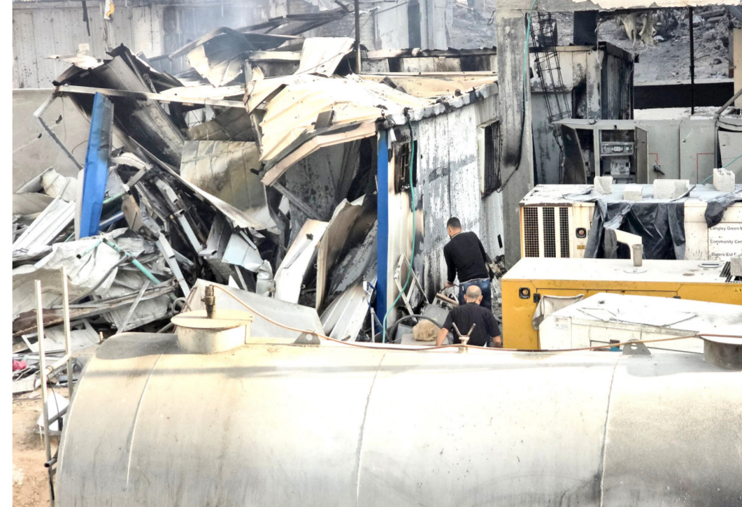
People check the damage outside the Kamal Adwan hospital in Beit Lahya in the northern Gaza Strip