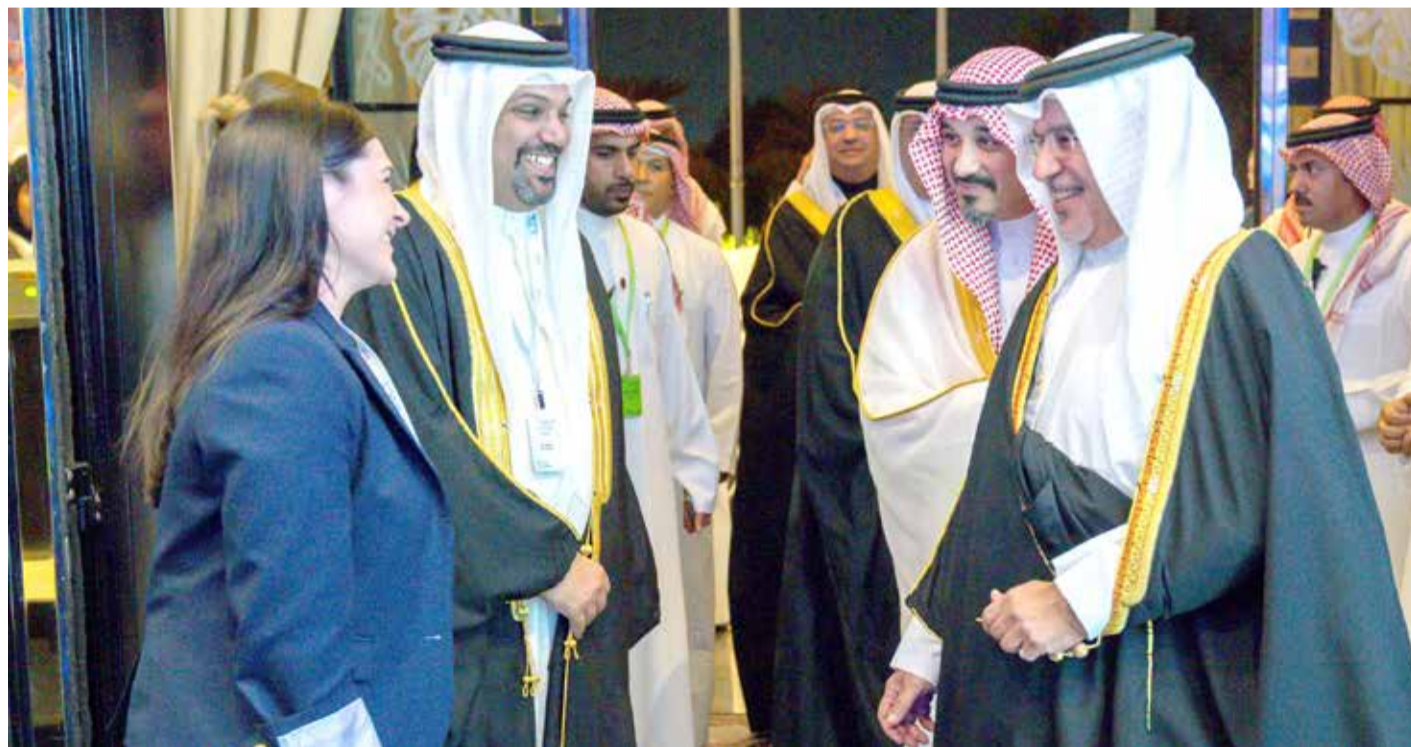
In pictures, the inauguration of the 20th edition of the IISS Manama Dialogue security conference

HRH CP, PM inaugurates 20th IISS Manama Dialogue