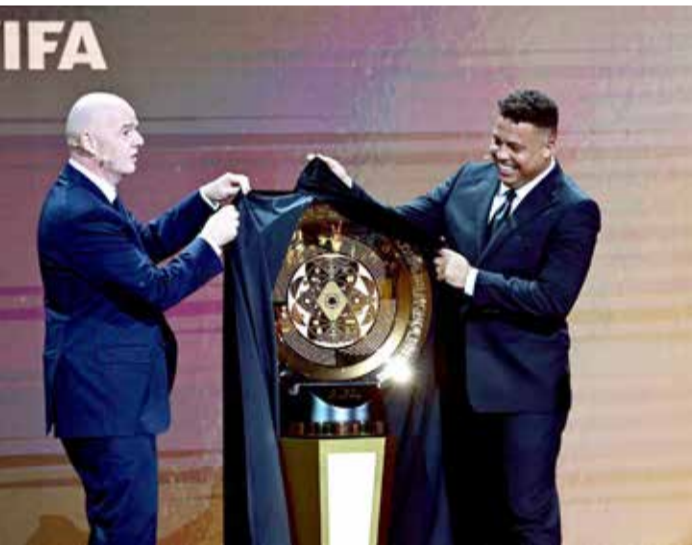
FIFA President Gianni Infantino (L) and Brazilian former soccer player Ronaldo unveil the trophy during the 2025 FIFA Club World Cup Draw ceremony

Paris Saint-Germain were drawn in a tough group with Atletico Madrid, Copa Liberta-