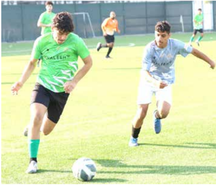
Action from a match

Quarterfinal matches are set to begin on Sunday, December 8, with notable clashes including Ahmed Al-Imran School against Brights International School and Al-Hidaya Al-Khalifiya facing Modern Knowledge School.