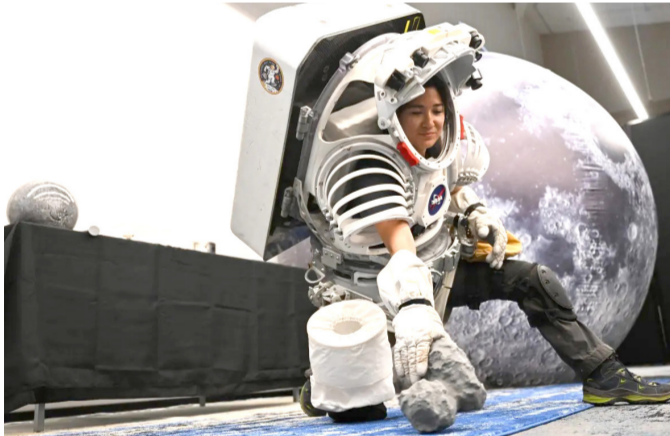
A person is seen in an unpressurized mockup spacesuit used for moonwalk tests during a media event for NASA's Joint EVA and Human Surface Mobility Test Team Field Test 5 (JETT5) to practice moonwalking operations for the Artemis lunar missions