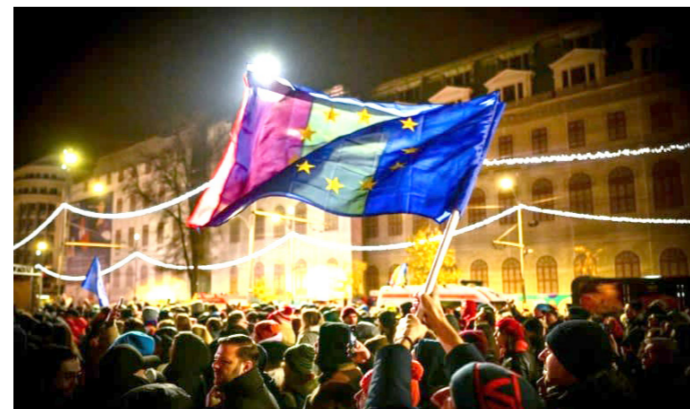
Demonstrators hold EU and Romanian national flags during a pro-European rally against Georgescu and Russia, including "massive" social media promotion and cyber-attacks. The court said it had decided "to annul the entire electoral process for the election of the President of Romania... to ensure the correctness and legality of the electoral process".

Romania's constitutional court announced yesterday that it had annulled the presidential election following allegations of Russian interference, effectively cancelling the second-round run-off that had been due to take place this weekend. Romanian authorities had cried foul after far-right outsider Calin Georgescu topped the first round of presidential elections on November 24, a surprise result in the EU and NATO member bordering Ukraine. On Wednesday, the presidency declassified documents detailing a slew of allegations