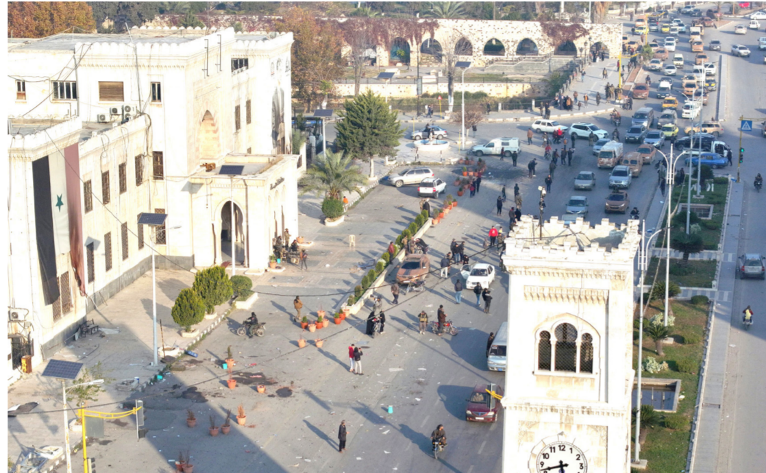
This aerial picture shows the municipality building in Syria's city of Hama after anti government fighters captured the city

Syrian rebel forces aim to topple Assad's regime in strategic advance