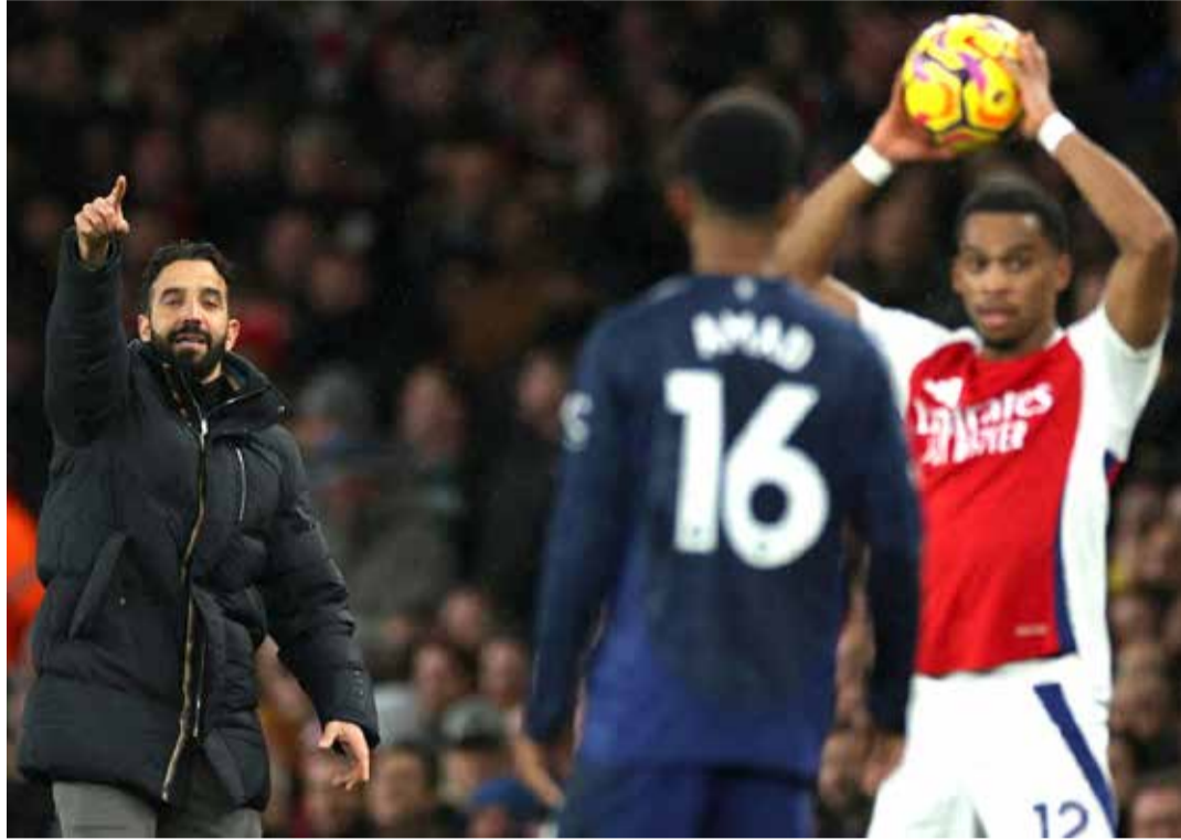
Manchester United's Portuguese head coach Ruben Amorim (L) shouts instructions to the players from the touchline during the match against Arsenal (file photo)

Everton's 4-0 thrashing at Old Trafford last weekend was the first time United had won a