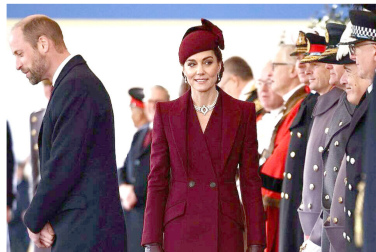
Britain's Catherine, Princess of Wales greets dignitaries as she arrives ahead of a Ceremonial Welcome