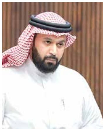
Abdulwahid Qarata, MP

The justification for these measures is clear: rogue workers are driving local families into