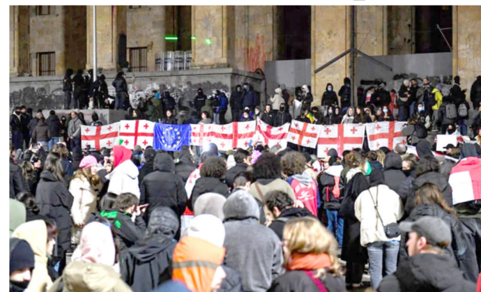
Anti-government protesters with flags of Georgia and European Union rally in front of the parliament during against alleged electoral fraud and Kobakhidze's shock announcement last week that Georgia would not seek European Union membership talks until 2028.

Georgia's Prime Minister Irakli Kobakhidze yesterday claimed victory in a "battle" against the pro-Western opposition, even as a crisis fuelled by his suspension of EU talks showed no signs of easing. Tbilisi has been engulfed in turmoil since the governing Georgian Dream party -- accused by critics of creeping authoritarianism and steering the country back towards Russia -- declared that it had won a disputed October 26 election. Tens of thousands have taken to the streets to protest