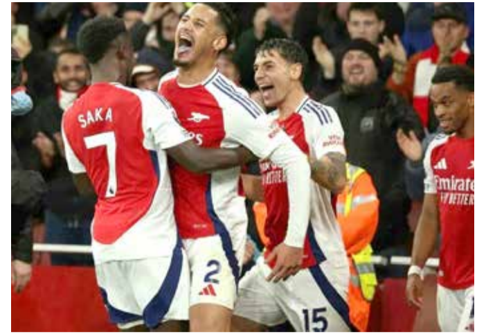
Arsenal's players celebrate a goal (file photo)