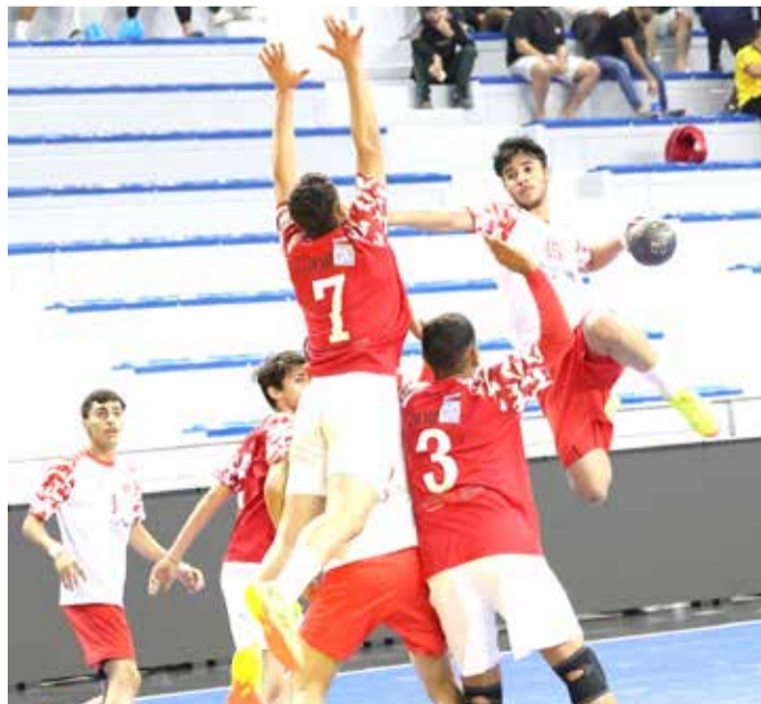
Action from the match

The return leg is scheduled for Sunday, December 8, at the same venue. Hamdan City will face Sheikh Khalifa Institute, while Ahmed Al-Imran takes on Al-Hidaya Al-Khalifiya.