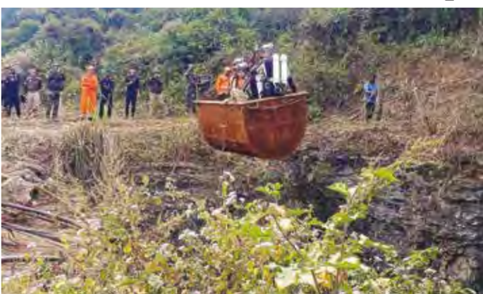
Divers enter a flooded pit in a coal mine using a pulley port staff swiftly responded" to try to bring the miners out. Images released by the military showed divers in scuba kit being lowered into a deep shaft in a metal bucket.

Indian search teams including military divers worked yesterday to reach several coal miners trapped underground after water flooded the shaft a day earlier, rescue officials said. Nine men are reported to be trapped in the mine, with a rescue report saying three bodies had been spotted. Locals said at least 27 workers had entered the mine on Monday morning in the Dima Hasao region of India's northeastern state of Assam, with many managing to escape as gushing waters swamped the pit workings. State government minister Kaushik Rai told AFP that more