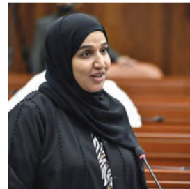
MP Jalila Al Sayed