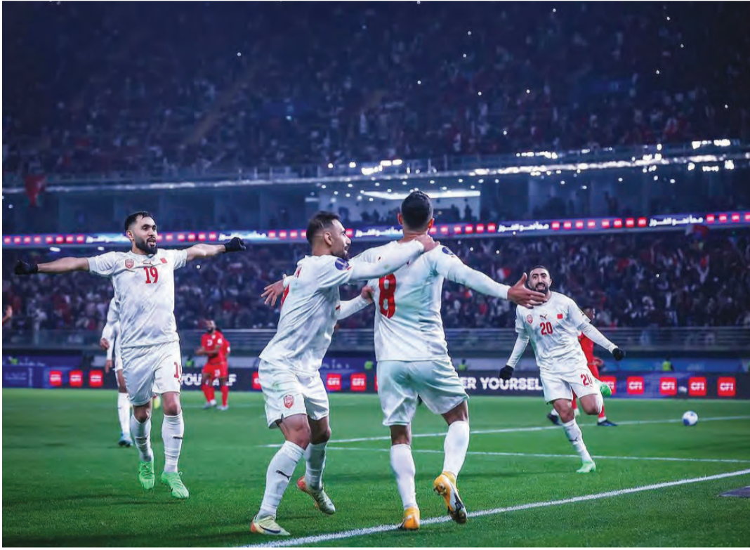
Bahrain's players celebrate Gulf Cup final against Oman

Fresh off Gulf Cup win, Bahrain prepares for crucial World Cup qualifying matches