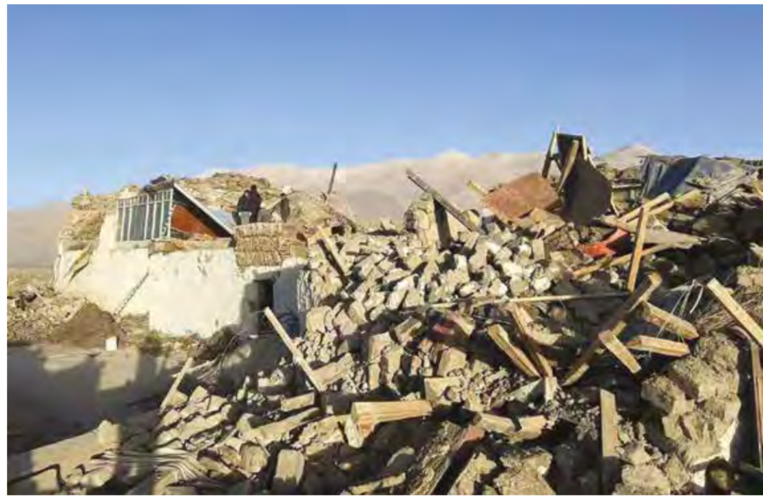
People stand amid damaged houses in the aftermath of an earthquake in Tonglai Village, Dingri in the Tibetan

A devastating earthquake in China's remote Tibet region killed at least 126 people and damaged thousands of buildings yesterday, state media reported, with tremors also felt in neighbouring Nepal's capital Kathmandu and parts of India. Videos published by China's state broadcaster CCTV showed houses destroyed with walls torn apart.