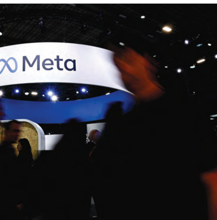
A logo of US company's Meta is displayed at the Porte de Versailles exhibition center in Paris

Trump has been a harsh critic of Meta and Zuckerberg in recent years, accusing the company of supporting liberal policies and being biased against