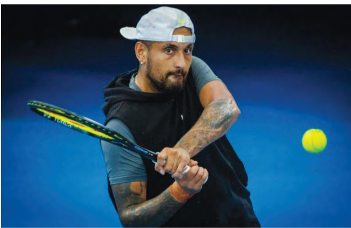
Nick Kyrgios in action

But the 2022 Wimbledon finalist was among the nominations put forward for their tie with Sweden after his return to