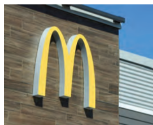
Logo of McDonald's is seen outside a restaurant