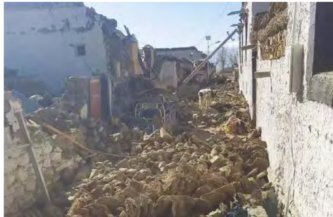
Damaged houses in Shigatse, southwestern China's Tibet region

injured as of 7:00 pm, CCTV said. Twenty-eight people in critical condition were transferred to hospital for treatment and 3,609 houses had collapsed, it added. The China Earthquake Networks Center (CENC) measured the quake's magnitude as 6.8, while the US Geological Survey reported it as 7.1. When tourist Meng Lingfang arrived in the town of Lhatse, 65 kilometres from the epicentre, "the buildings had cracked open." "Some of the older houses collapsed, and a large part of the buildings made from bricks had cracked open, with big fissures,"