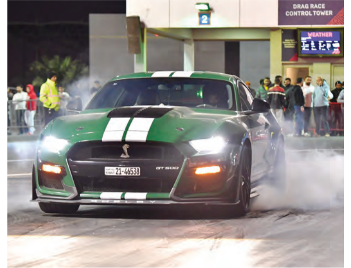
Action from a previous event at BIC

Night is the perfect opportunity for an engaging, yet friendly, duel. Both participants will be able to push their vehicles to their very limit within the secure and controlled environment at BIC.