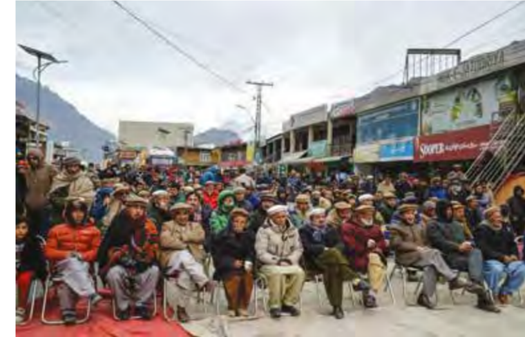
Residents stage a sit-in protest against power outages in Hunza Valley AFP | Khaplu