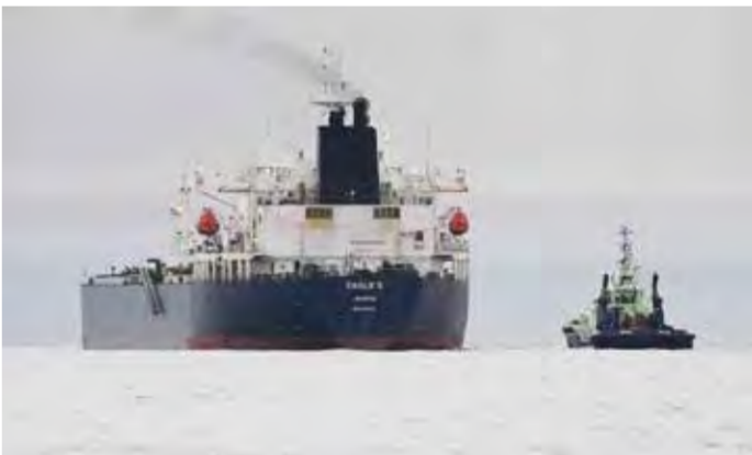
Divers enter a flooded pit in a coal mine using a pulley Islands flag, is suspected of land and Estonia in the Baltic having damaged the EstLink 2 on December 25, putting it out of electricity cable between Fin-

The Swedish navy said yesterday it had recovered from the Baltic Sea the anchor of an oil tanker suspected of belonging to Russia's 'shadow fleet' and damaging four underwater telecom cables and one power cable on December 25. Sweden sent a submarine rescue vessel to assist Finland in the investigation last week. "The HMS Belos has located and lifted the anchor and handed it over to Finnish authorities," Swedish navy spokesman Jimmie Adamsson told AFP. The Eagle S, flying the Cook