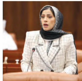
MP Basma Mubarak