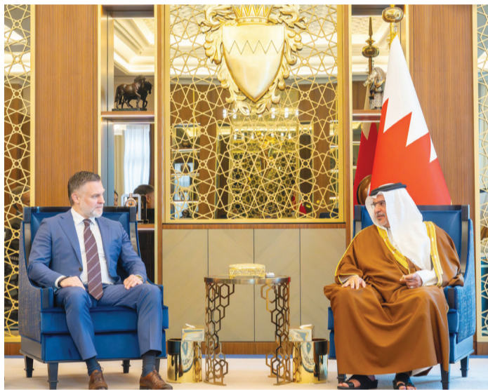
HRH Prince Salman with H.E. Kirill Bychkov

During the meeting, discussions focused on ways to enhance bilateral relations and cooperation, as well as the latest regional and international de-