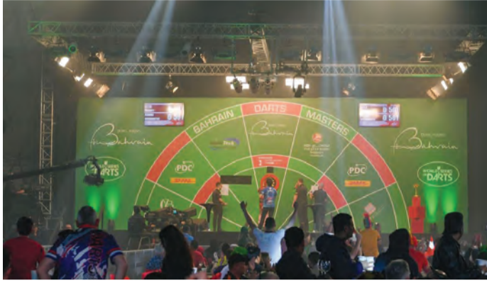
Action from a previous Darts Masters event

Also set to thrill fans are last year's World Champion Luke Humphries and top star Rob