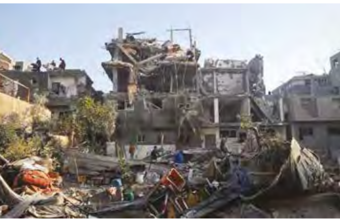
People look for their belongings amid the debris of destroyed buildings following an Israeli air strike on Bureij camp in the central Gaza Strip