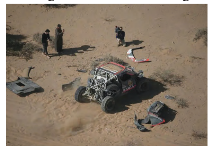
The Dacia of French driver Sebastien Loeb is seen after crashing