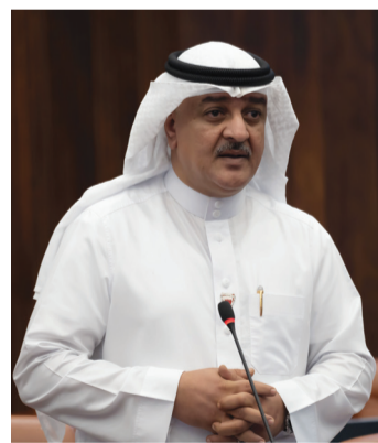
MP Jalal Kadhem