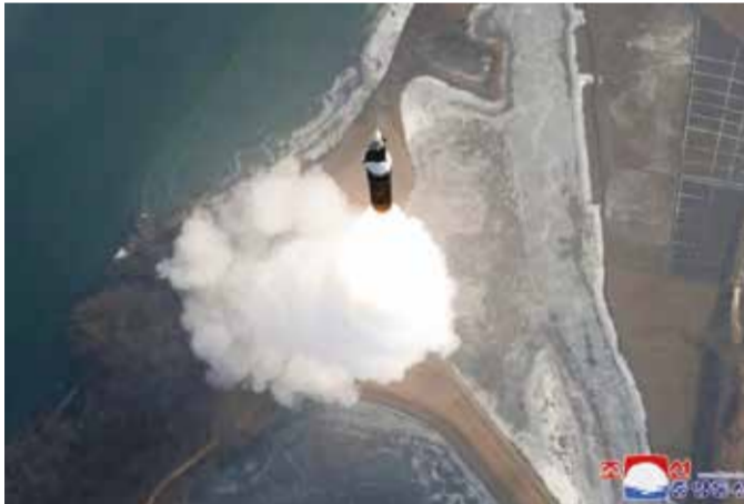
A view shows the launch of a hypersonic missile at an undisclosed location | Seoul

North Korean leader Kim Jong Un said a new hypersonic missile system tested this week would help deter the country's Pacific rivals, state media reported yesterday, as Washington's top diplomat visited the region. The test came two weeks before the inauguration of US president-elect Donald Trump, who has previously tried to woo North Korea, and coincided with US Secretary of State Antony Blinken's visit to the South. "The hypersonic missile system will reliably contain any rivals in the Pacific region that can affect the security of our state," Kim, who oversaw the launch, said in comments carried by KCNA yesterday. KCNA cited the use of a "new compound of carbon fibre" in the missile's engine, which experts warned could allow Pyongyang to hit further targets with technology only the United States, Russia and Chi-