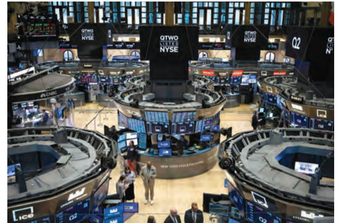
Traders work on the floor of the New York Stock Exchange (file photo)