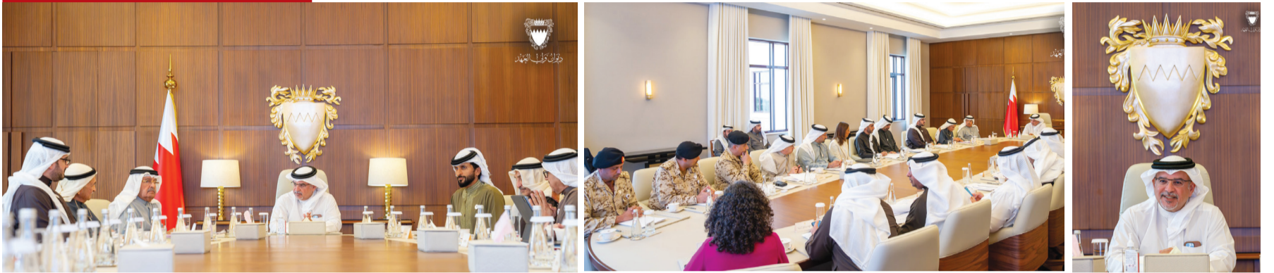
His Royal Highness Prince Salman bin Hamad Al Khalifa, the Crown Prince and Prime Minister, chaired the 499th Government Executive Committee meeting. Discussions included developments regarding the National Social Health Insurance Program, the outcomes of the 2024 'Taqqeem' evaluation of government service centres, and priority draft laws.