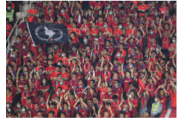
Fans cheer for Guangzhou FC

The effective demise of the eight-time Chinese Super