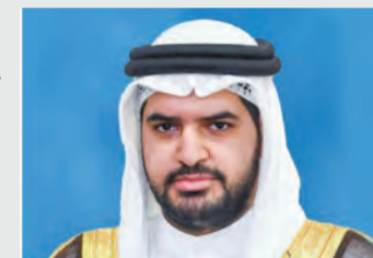
HH Shaikh Isa bin Ali Al Khalifa

In a message brimming with pride, His Highness congratulated His Majesty King Hamad bin Isa Al Khalifa and His Royal Highness Prince Salman bin Hamad Al Khalifa, Crown Prince and Prime Minister. He also acknowledged the pivotal contributions of His Highness Shaikh Nasser bin Hamad Al