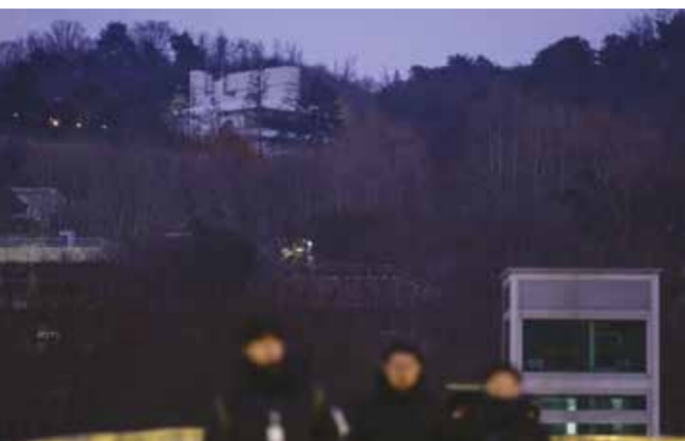
The residence (top) of impeached President Yoon Suk Yeol is seen in Seoul by hundreds of guards preventing his detention. "The arrest warrant re-

South Korean anti-graft investigators secured a new court-ordered arrest warrant yesterday for impeached President Yoon Suk Yeol, whose failed martial law bid threw the country into turmoil. The former star prosecutor has refused questioning three times after his bungled December 3 martial law decree plunged South Korea into its worst political crisis in decades. As anti-graft officials and police got their fresh warrant from the same court that issued the first order, Yoon remained holed up in his residence surrounded