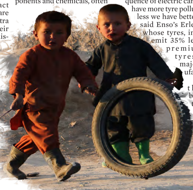
Afghan children play with a tyre along a street in Argo district of Badakhshan province

will deliver an optimal in-vehicle experience by enabling real-time display of critical driving information, as well as seamless playback of graphics-rich video content and games on multiple displays.