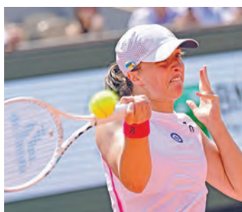
Poland's Iga Swiatek

World number one Swiatek improved her record at Roland Garros to 26-2 after beating