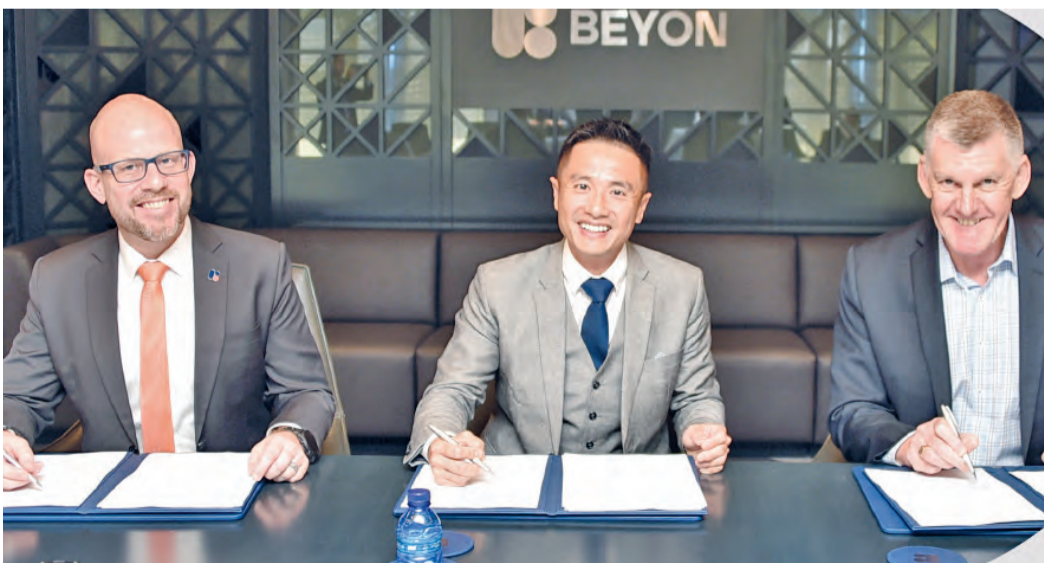
The deal signing

ONEVIEW will provide customers with a digital postbox and enable public authorities and businesses to interact with them digitally, removing the