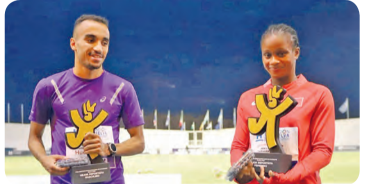
Salwa Eid Naser with her winner's trophy alongside men's 1,500m winner Isaac Nader of Portugal