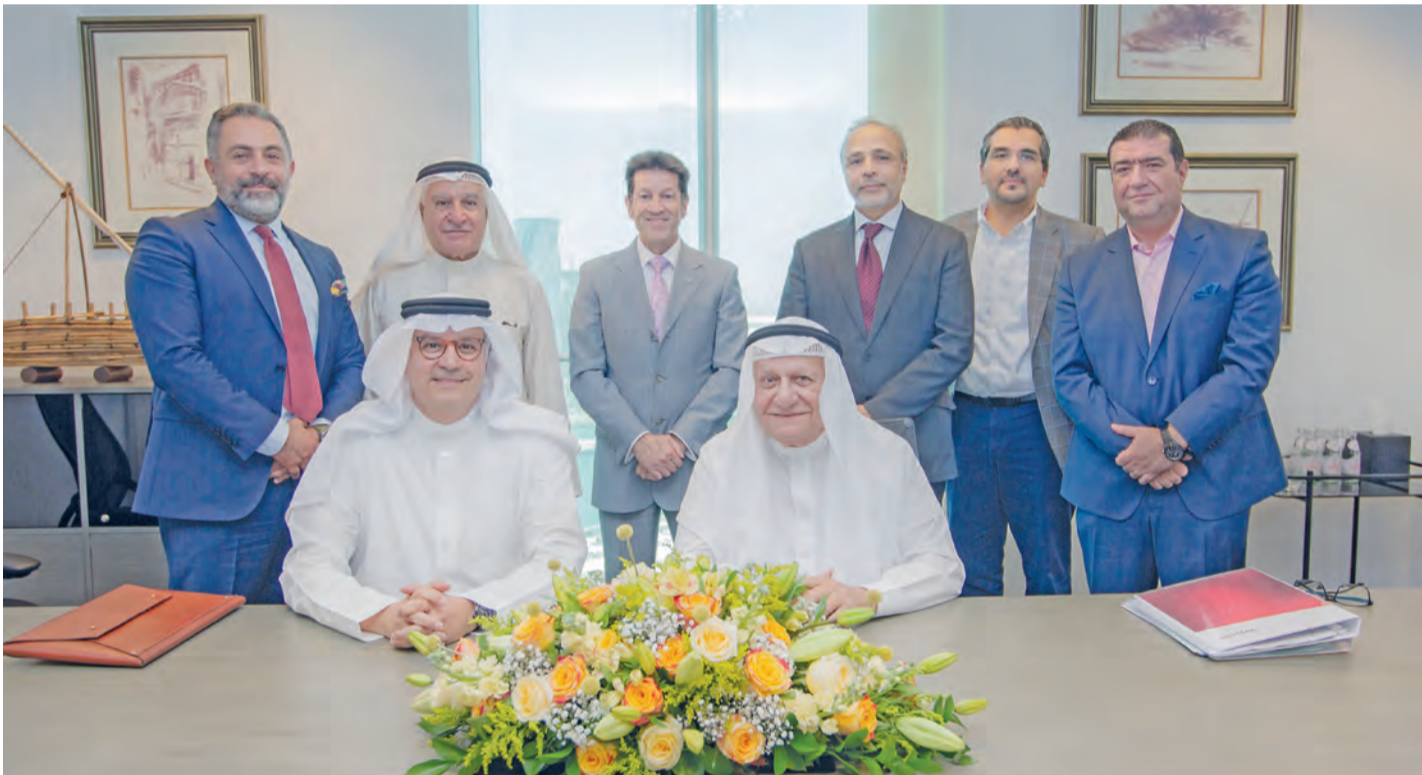
Officials following the deal signing

Gulf Hotels Group is a public limited liability company quoted on the Bahrain Stock Exchange incorporated in 1967, under the name of Bahrain Hotels Company.