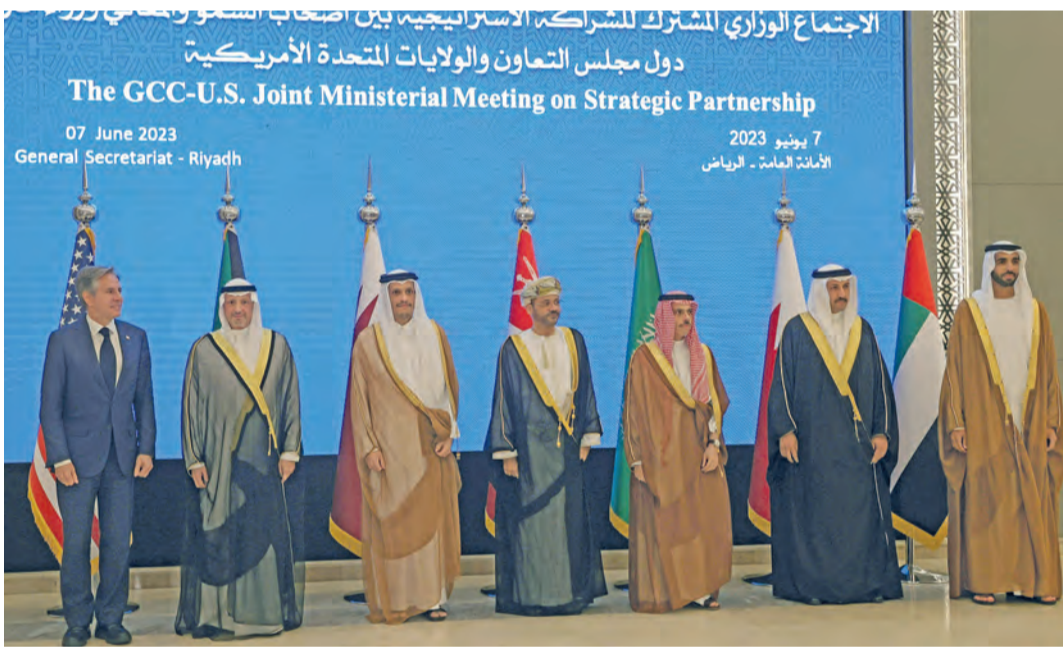
US Secretary Blinken, left, poses with GCC ministers yesterday.

Relations between the decades-old allies have been strained in recent times, mainly over human rights and oil, after US pleas for help in bringing down skyrocketing prices last