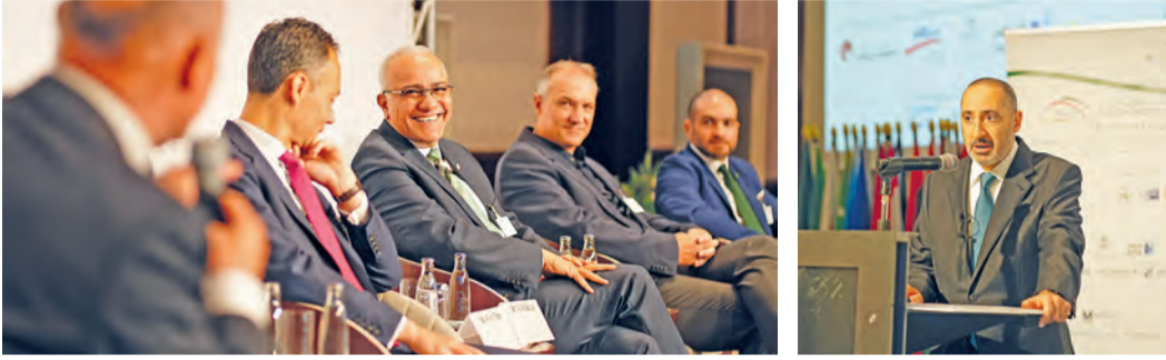
The 26th Arab German Business Forum held in Berlin, Germany