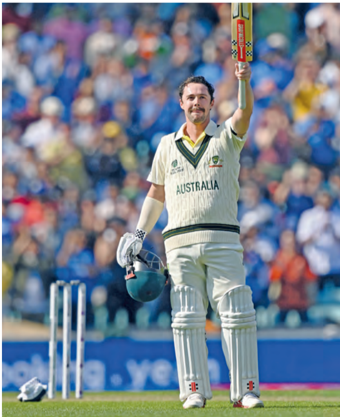
Australia's Travis Head celebrates his century

India captain Rohit Sharma elected to bowl under overcast skies and on a green-tinged pitch that promised to assist a