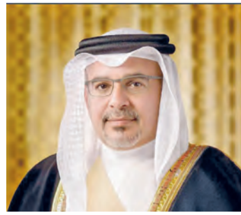
HRH Prince Salman

His Royal Highness highlighted the Bahrain Defence Force's continued development as a result of the support and directives issued by His Majesty King Hamad bin Isa Al Khalifa, the Supreme Commander of the Armed Forces.