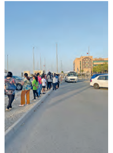
Visitors queuing at the shuttle

files, although children under the age of 12 enter for free. The hours of operation are 4 pm to 11 pm. However, the ship will be closed on Mondays.