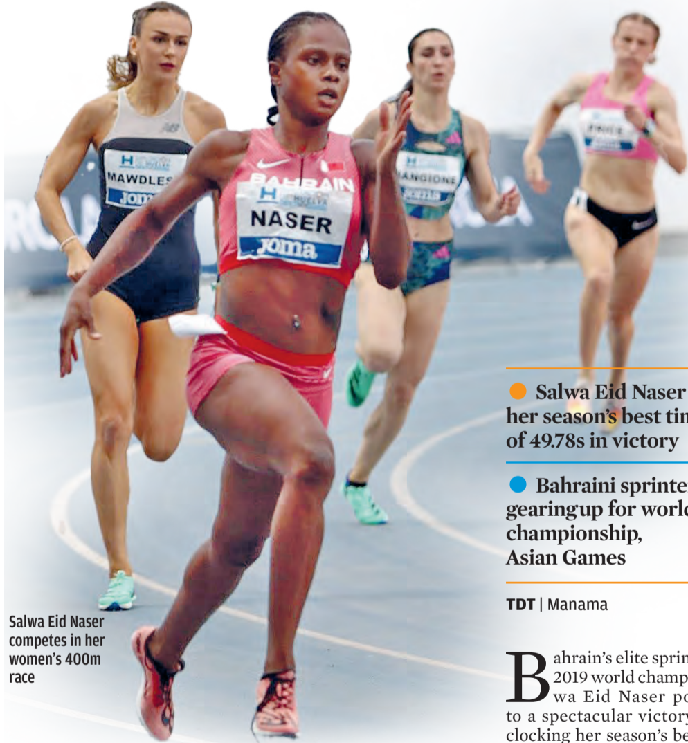
Salwa Eid Naser competes in her women's 400m race

Bahrain's elite sprinter and 2019 world champion triumphs in women's 400m race in Spain meeting