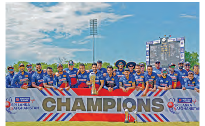
Sri Lanka's players pose with the trophy