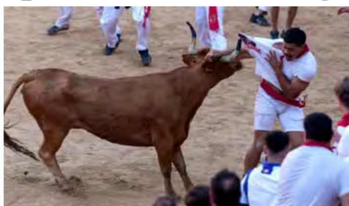
A participant is hit by a young cow after the "encierro" (bull-run) of the San Fermin festival in Pamplona

Six people were hurt yesterday in Spain's traditional annual San Fermin bull running festival, with one participant gored and five suffering bruising, local government sources said. A 37-year-old Spanish man emerged from his goring with slight injuries, officials said. The curtain went up on nine days of festivities on Saturday as thousands of revellers dressed in white clothes and red scarves filled the city's main square for the "chupinazo" -- the firecracker which launches an event dating back to medieval times.