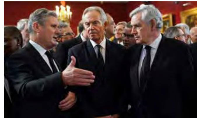
Britain's Labour leader Sir Keir Starmer, Britain's former Prime Ministers Tony Blair and Gordon Brown speak together ahead of a meeting

In a piece headlined "My advice to Keir Starmer", Blair wrote in the Sunday Times that "all over the western world, traditional political parties are suffering disruption." "Where the system allows new entrants to emerge, they are running riot everywhere. Look at France or Italy. "We need a plan to control immigration. If we don't have rules, we get prejudices," he added. Blair, the only Labour leader to lead his party to three consecutive election victories starting with his own landslide win in 1997, couched his "advice" in an article about harnessing the power of artificial intelligence (AI). He said he believed digital ID technology offered the best solution to controlling irregular immigration, a key issue on the doorstep during the election campaign. It won five seats in the Westminster parliament and 14 percent of the vote, prompting Farage to warn that it will target Labour voters next.