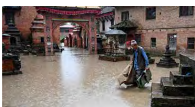
A resident wades through flood after Hanumante river overflowed following heavy rain in Bhaktapur on the outskirts of Kathmandu

missing, police said yesterday. Flooding in neighbouring India, as well as in downstream Bangladesh, has also caused widespread damage and impacted millions. "Police are working with other agencies and locals to find the missing people," Nepalese police spokesman Dan Bahadur Karki told AFP. Those killed and missing are in multiple locations. Monsoon rains from June to September bring widespread death and destruction every year across South Asia, but the numbers of fatal floods and landslides have increased in recent years. Experts say climate change and increased road construction are exacerbating the problem. Parts of Nepal have been receiving heavy rainfall since Thursday, prompting disaster authorities in the Himalayan nation to warn of flash floods in multiple rivers.