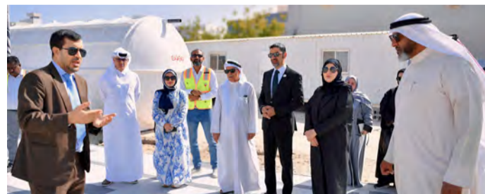
Officials during the inspection

The walkway spans an area of 11,608 square meters and