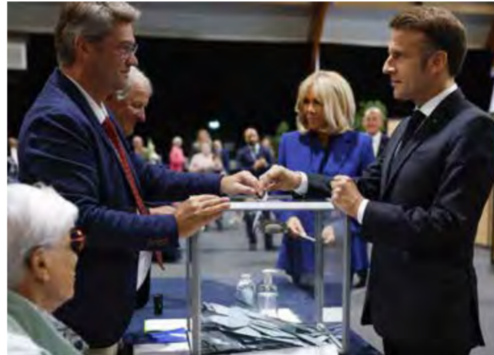
France's President Emmanuel Macron (C), flanked by his wife Brigitte Macron, casts his ballot to vote

French voters turned out in large numbers yesterday for the final round of a high-stakes election that is expected to leave the far right as the biggest force in a deeply divided parliament. By 5:00 pm (1500 GMT), according to interior ministry figures, some 61.4 percent of voters had turned out -- the most at this stage of a legislative race since 1981, with three hours of polling to go. President Emmanuel Macron called the snap elections three years ahead of time after his forces were trounced in June's European parliament vote, a gamble