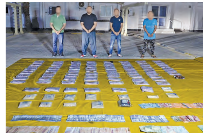
The picture released showing the suspect and confiscated drugs, money TDT | Manama

In a significant operation, police have arrested four individuals found in possession of over 84 kilograms of assorted narcotic drugs and 18,500 narcotic pills, valued at approximately half a million dinars. The arrests were announced by the Anti-Narcotics Department of the General Directorate of Criminal Investigations and Forensic Evidence.