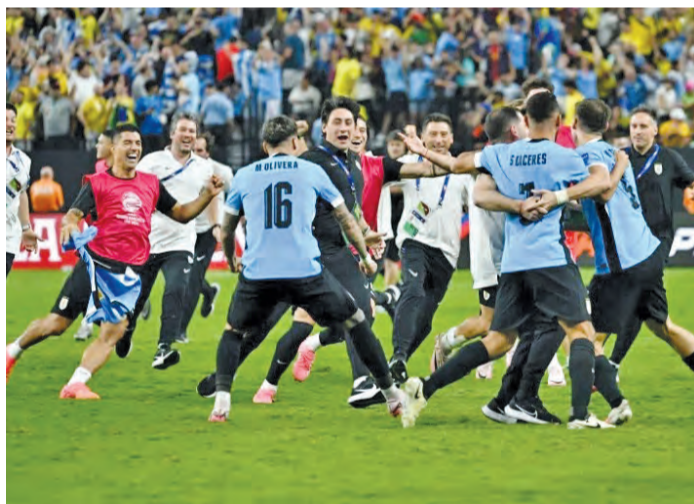
Uruguay celebrated a penalty shoot out victory over Brazil

For five-times world champions Brazil it was a disappointing early end to a tournament in which they never truly clicked, and a lot of work remains to be done if Dorival Junior's team are to be in shape to compete for the title in the 2026 World Cup.