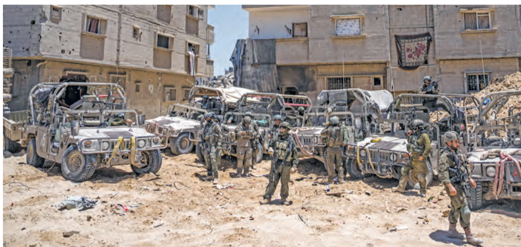
Israeli soldiers are seen during a ground operation in the southern Gaza Strip

The damage threatens Gaza's food sovereignty, Matieu Henry of the Food and Agriculture Organization told AFP, because 30 percent of the Palestinian territory's food consumption comes