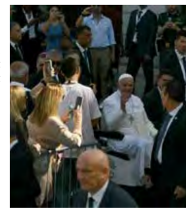
Pope Francis arrives to lead a mass in Trieste

Pope Francis decried the state of democracy and warned against "populists" during a short visit to Trieste in Italy's northeast yesterday ahead of a 12-day trip to Asia -- the longest of his papacy. "Democracy is not in good health in the world today," Francis said during a speech at the city's convention centre to close a national Catholic event. Without naming any countries, the pope warned against "ideological temptations and populists" on the day that France holds the