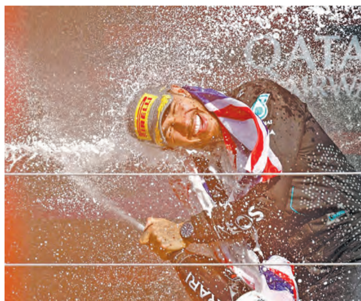
Mercedes' British driver Lewis Hamilton celebrates on the podium

In a roller-coaster race of changing weather and track conditions, Lando Norris came