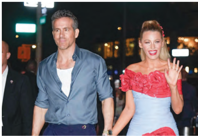
Blake Lively and Ryan Reynolds