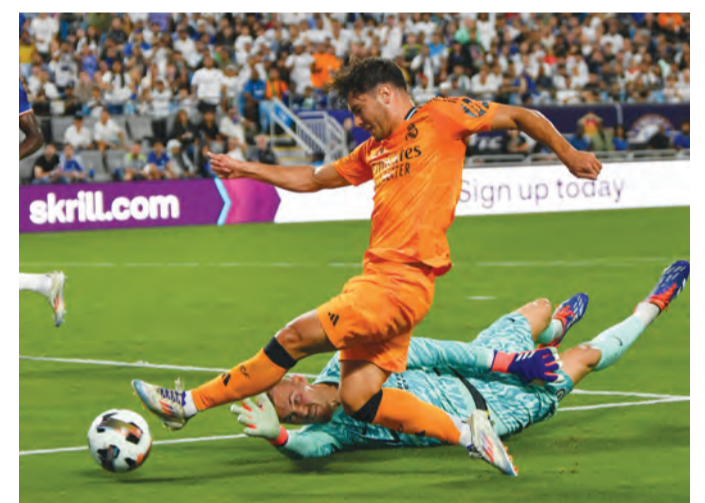
Real Madrid's Brahim Diaz kicks the ball past Chelsea's goalkeeper Filip Jorgensen and scores his team's second goal