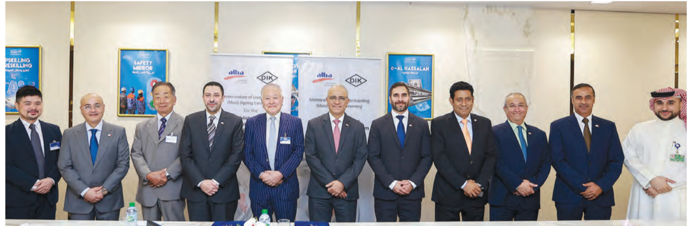
Aluminium Bahrain and Daiki Aluminium Industry Company officials following the deal signing