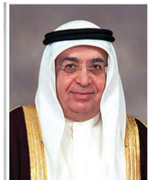
His Highness Shaikh Mohammed bin Mubarak Al Khalifa