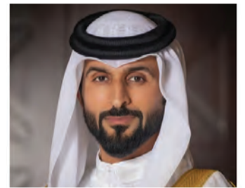
His Highness Shaikh Nasser bin Hamad Al Khalifa