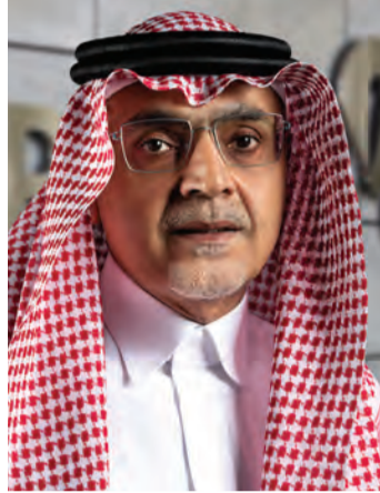
Shaikh Abdullah Saleh Kamel, Chairman of Al Baraka Group's Board of Director

foreign currency translation effect is another factor that contributed to the decline.