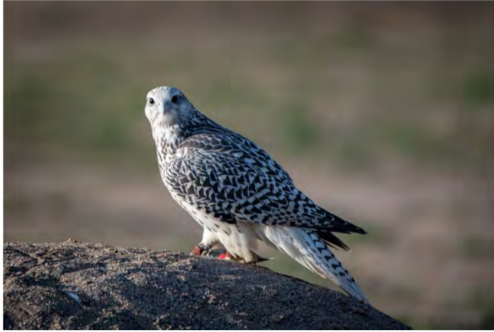
The gyrfalcon is now a shared cultural symbol uniting Bahrain and Russia

Gyrfalcon conservation has gained traction recently, with Bahrain joining the international effort as the seventh country to back this cause, alongside Russia, China, Kyrgyzstan, Kazakhstan, Mongolia, and the United Arab Emirates.