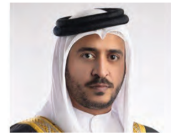
His Highness Shaikh Khalid bin Hamad Al Khalifa

They noted the continued support of HH Shaikh Nasser and HH Shaikh Khalid in advancing Bahraini sports, including athletics, which enhances Bahrain's accomplishments in international competitions and elevates the Kingdom's profile in global sporting events.