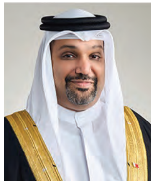
HE Shaikh Salman bin Khalifa Al Khalifa