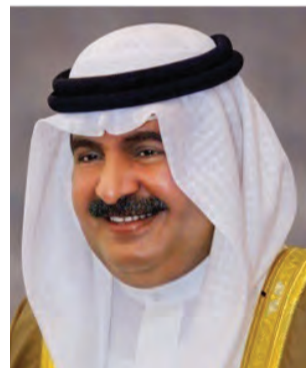
His Highness Shaikh Ali bin Khalifa Al Khalifa