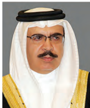
HE General Shaikh Rashid bin Abdullah Al Khalifa