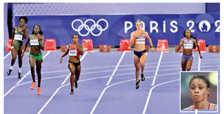
Bahrain's Salwa Eid Naser leads the pack

As the nation eagerly anticipates the final, Naser's achievement stands as a beacon of national pride.