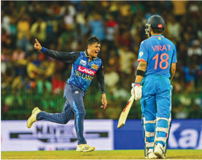
Sri Lanka's Jeffrey Vandersay (L) celebrates with teammates after taking the wicket of India's Virat Kohli (R)

Sri Lanka, who last registered a bi-lateral series triumph over India in the 50-over format in 1997, won the series 2-0 after the opener ended in a tie.