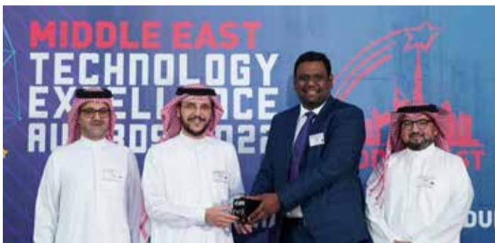
The award ceremony

of BNET's efforts to achieve the separation project from Bahrain Telecommunications Company (Batelco). The project included the separation of Information Technology, finance, broadband services, staff and data separation.