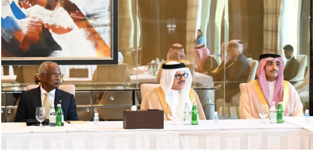
The deal signing

Accordingly, Beyon Cyber, one of Batelco's recently launched digital companies, will provide cyber security services in the Republic of Maldives.