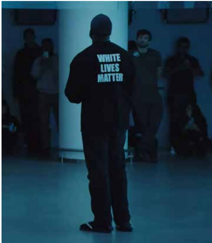
Kanye West wears the 'White Lives Matter' T-shirt

Page Six reports that front-row guest Jaden Smith left the show immediately when he saw the designs. Later, Kanye was criticized by many journalists,