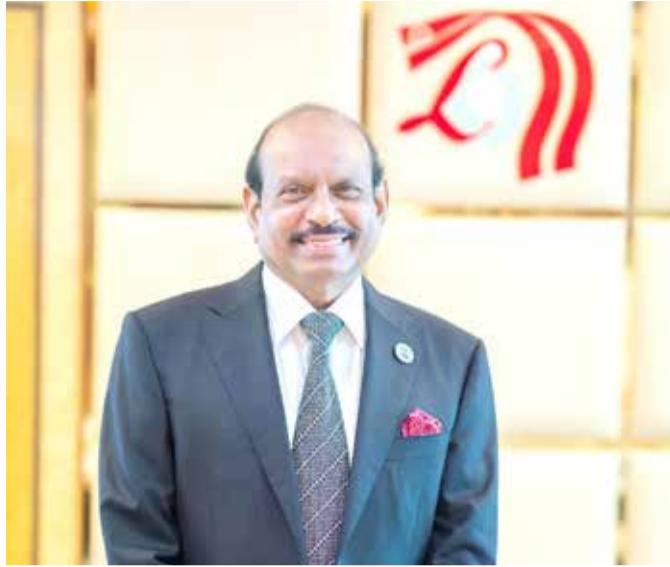
Yusuff Ali M.A., Abu Dhabi based Chairman of LuLu Group

Mark Zuckerberg surpasses Bezos to become world's second richest person