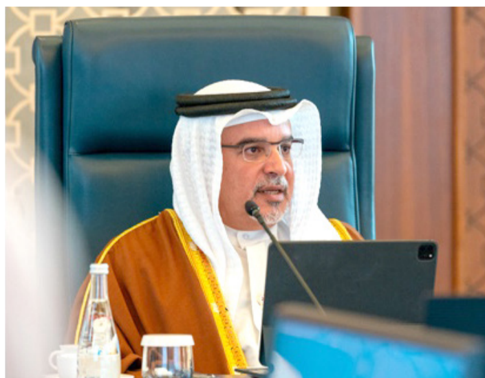
HRH the Crown Prince and Prime Minister chairs the weekly Cabinet meeting

The Cabinet also approved a memorandum concerning negotiations for a free trade agreement between the Gulf Cooperation Council (GCC) countries