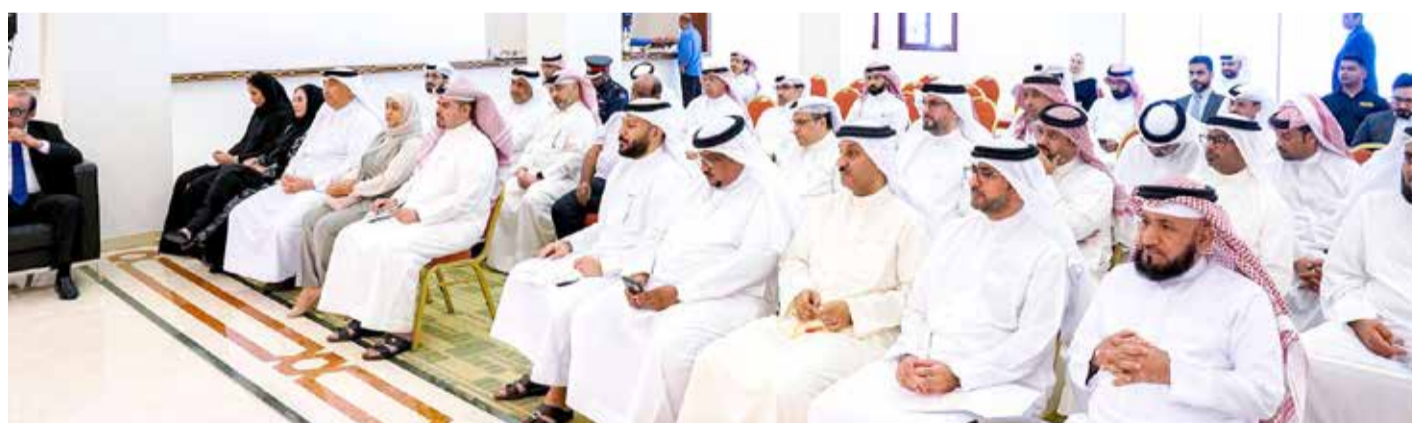
MPs attend a preparatory committee meeting to oversee arrangements for the opening ceremony