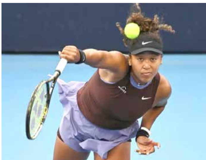
Naomi Osaka in action

against eventual champion Coco Gauff, Osaka retired at the end of the second set because of a back injury.