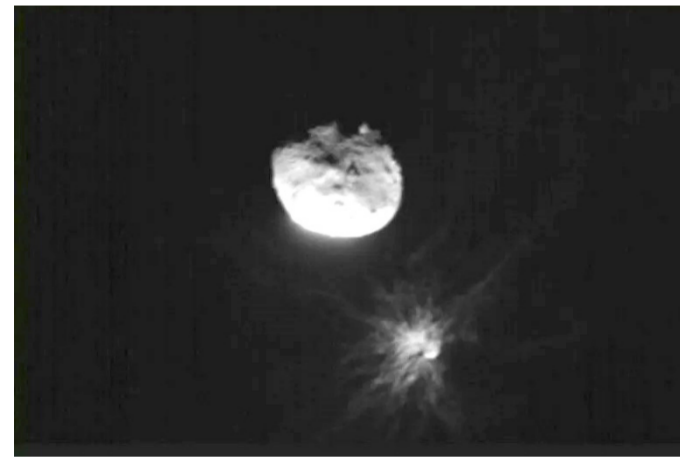
NASA's Double Asteroid Redirection Test (DART) mission just before its closest approach to the Dimorphos asteroid