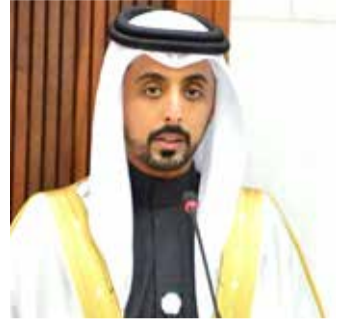
MP Ali Al Nuaimi

Article one outlines a levy of $1 per barrel of crude oil exported from Bahrain, applicable to barrels exceeding $40 in value, starting from the first