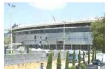
Construction work underway at Barcelona's Camp Nou stadium

Barcelona fans will be able in the coming days to register to