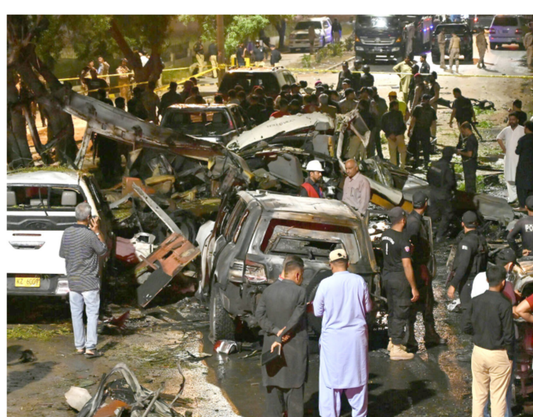
Security officials examine the site of an explosion which occurred near Karachi airport in Karachi

AFP | Karachi A massive blast that targeted a convoy of Chinese engineers and investors' coming from Karachi's international airport. Karachi borders Balochistan province, the largest but poorest region of the country, where billions of dollars have been funnelled into transport, energy and infrastructure projects as part of the China-Pakistan Economic Corridor (CPEC). The BLA is waging a war of independence against the state, which it accuses of permitting unfair exploitation of resources by outsiders in the mineral-rich region. In August, it carried out coordinated attacks across Balochistan that killed dozens of mostly Punjabis, the largest ethnic group in Pakistan, who were working in the region.