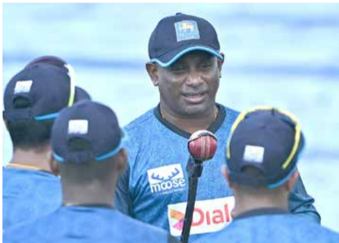
Sri Lanka's head coach Sanath Jayasuriya (2R) attends a practice session

"It is a challenging job, I know that... but I want to take the challenge and move forward