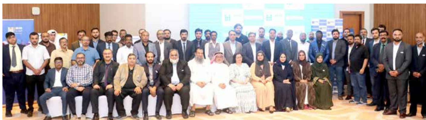
Officials and attendees pose for a photo

The forum fostered collaboration among IT leaders, offering a unique platform for knowledge sharing and networking. Attendees left empowered with actionable insights to better protect their organizations against future cyberattacks, marking the event as a significant success in strengthening regional cybersecurity efforts.