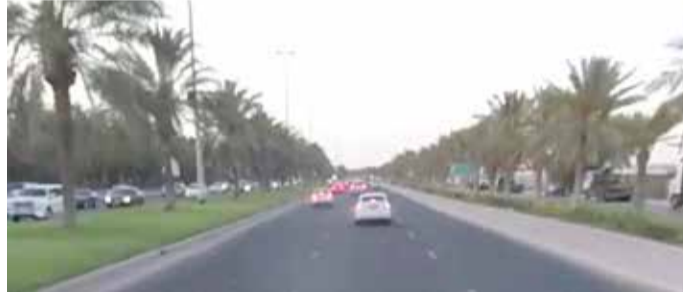
Actual view of the highway

The speed limit along this road is 100 km/h, and pedestrians frequently misjudge the speed of approaching vehicles,