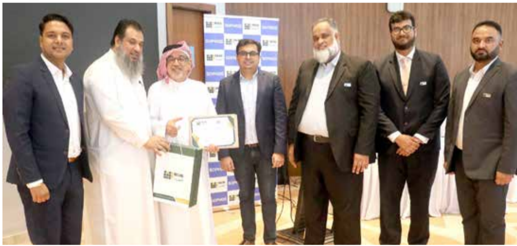
Officials present a certificate to a participant

The event highlighted the latest cyber threats and effective strategies for safeguarding critical systems.