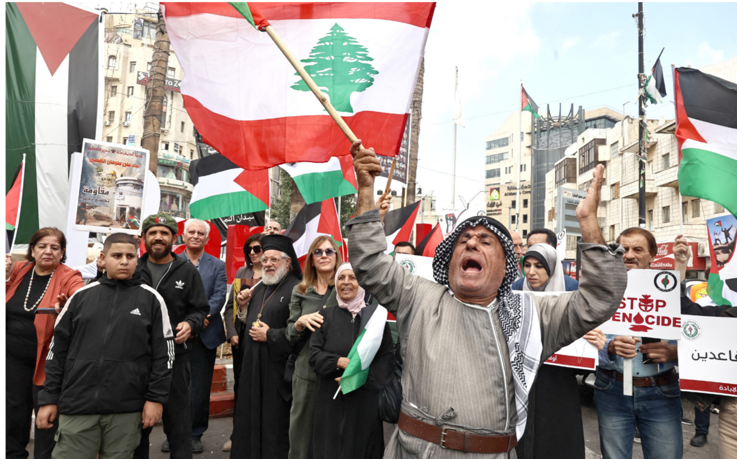
Protesters carry Lebanese flags during a rally to mark the anniversary of Palestinian militant group Hamas's October 7, attack on Israel, in Ramallah in the occupied West Bank. Beyond the characteristic yellow and green flags of the Lebanese armed group Hezbollah and of the Palestinian Islamist movement Hamas, protesters also waved the flags of Lebanon, Iraq, Iran Islamic Resistance in Iraq and Yemen. Hezzbollah, as well as the pro-radically fired rockets and missiles at Israel since the start of the Gaza war.

Waving Hamas flags and carrying portraits of slain Hezbollah leader Hassan Nasrallah, hundreds rallied in support of the Palestinian struggle in the occupied West Bank city of Ramallah yesterday, the first anniversary of Hamas's attack on Israel. About 400 Palestinian protesters of all ages and representing various political factions marched in the de-facto Palestinian capital, which is controlled by long-time Hamas rival the Palestinian Authority, an AFP correspondent reported. Activists organised the rally on the first anniversary of Hamas's unprecedented attack on Israel under the slogan "we will not lose faith in the revolution".