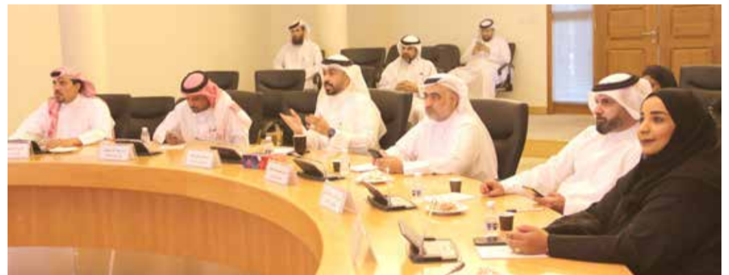
Muharraq Municipal Council's session in progress

The Muharraq Municipal Council has unanimously voted to urge the Ministry of Municipalities Affairs to address this pressing need, seeking to create a shared space that ca-