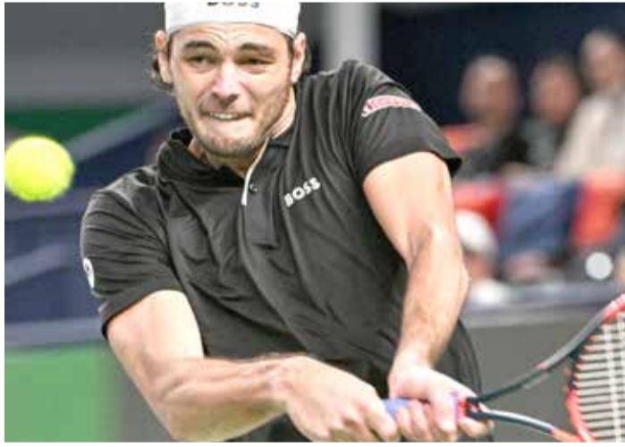
Taylor Fritz in action

World number 10 Grigor Dimitrov also managed to finish a delayed match yesterday, beating Belgium's Zizou Bergs 6-3,