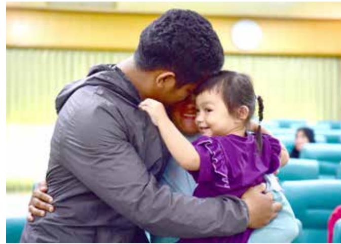
A Thai student returning from Israel hugs family members during a meeting at Rajanagarindra University in Thailand's southern province of Narathiwat