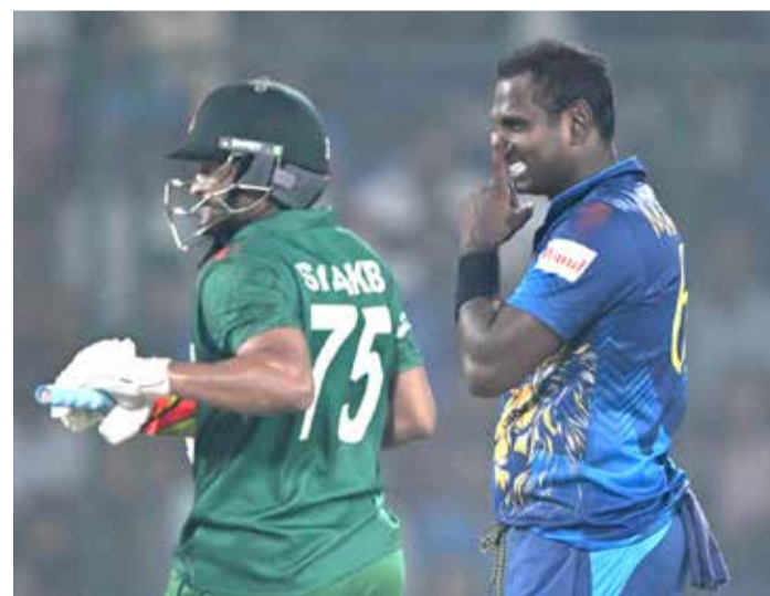
Sri Lanka's Angelo Mathews (R) watches as Bangladesh captain Shakib Al Hasan takes a run

"It is a weak argument often used by those that are ignorant