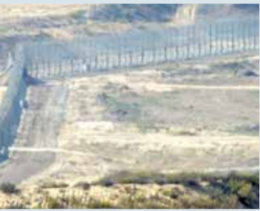
the border with the Gaza Strip shows Israel from Gaza

by AFP, telling civilians to flee to the south.