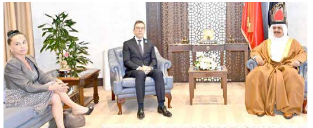
His Excellency Interior Minister, General Shaikh Rashid bin Abdullah Al Khalifa, received the newly appointed French Ambassador to Bahrain, Eric Giraud-Telme, yesterday. He welcomed the envoy, hailing the distinguished ties, cooperation and coordination between Bahrain and France, especially in security. He wished the ambassador the best in his new assignments. The two sides reviewed security cooperation and topics of common interest.