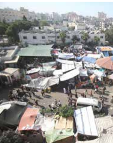
An aerial view shows the compound of AI-S... immediate release of hostages seized by Hamas. "They play no part in this conflict and we reiterate our offer as neutral actor to facilitate any future release operation," she said. "Until then we continue all our efforts to urge Hamas and all those with influence to allow ICRC personnel to visit the hostages," she added.