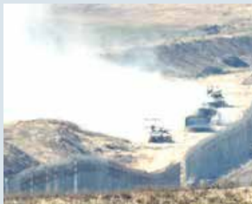
A picture taken from southern Israel near Israeli army vehicles crossing back into Israel with around 1.5 million fleeing within the territory according to the United Nations.

The majority of the Gaza Strip's 2.4 million residents have been displaced by the fighting,