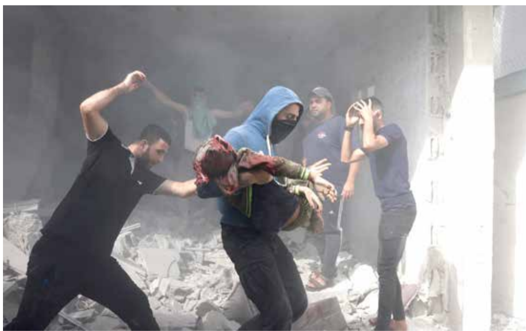
A Palestinian man carries a victim of an Israeli bombardment in the southern Gaza Strip yesterday.

The announcement comes as the US State Department spokesman Vedant Patel declared Washington's opposition to a new long-term occupation of the Gaza Strip by Israel, which