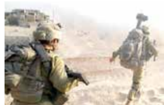
Israeli soldiers during operations in northern Gaza