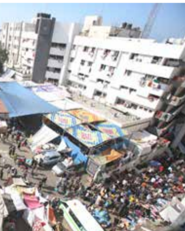
Al-Shifa hospital in Gaza City

siege of Gaza had deprived people there of food, water and medicine, and warned that the "sparse aid" trickling in was not able to provide people with the essentials to survive.