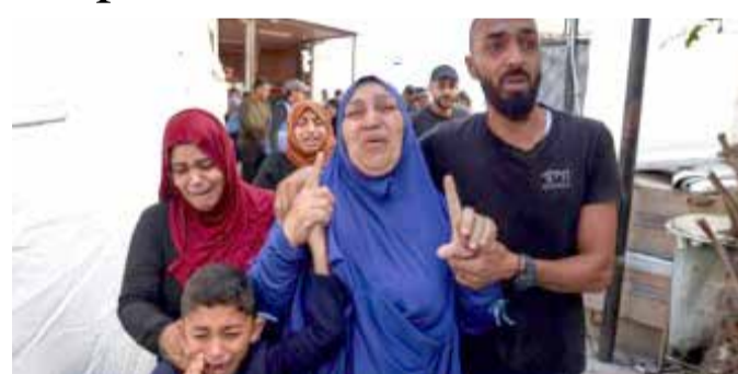
Palestinians cry following the death of relatives