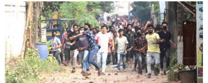
Garment workers clash with police personnel during a rally, demanding a near-tripling of their wages in Ashulia. Police said at least 300 factories had been shut down in the weeklong protests, which have so far left two workers dead and dozens more injured

The figure was immediately rejected by unions, which have been demanding a 23,000 taka minimum.