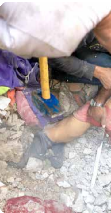
Palestinians pull a child from debris