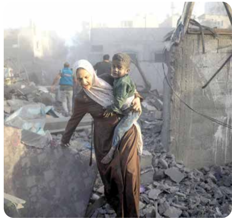
People flee following air strikes on a neighbourhood in the al-Maghazi refugee camp