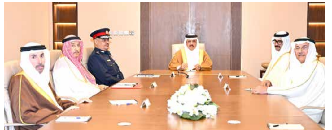
Interior Minister, General Shaikh Rashid bin Abdullah Al Khalifa, yesterday held a meeting with governors, in the presence of the Chief of Public Security. The minister hailed the role of the governors in promoting interaction with citizens and residents, as well as meeting the needs of residents of the governorates in coordination with concerned authorities. He said that the active presence of the governorates on all occasions promotes cooperation and interaction with all segments of society. The meeting also discussed the governorates' topics and projects.