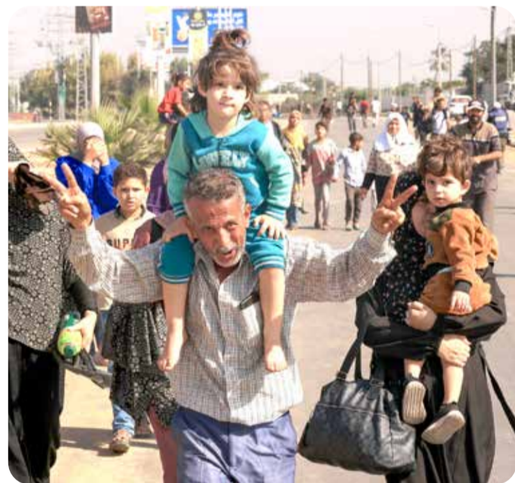
Palestinians fleeing Gaza City towards the southern areas walk on a road

Iqbal refuted the claims about the hospital, which, like other medical centres in war-ravaged