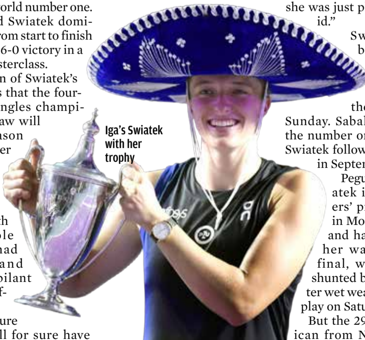
Iga's Swiatek with her trophy

But the 29-year-old American from New York never