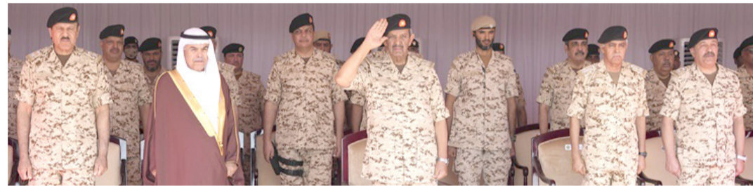
Field Marshal Shaikh Khalifa bin Ahmed with senior officials and BDF officers

On behalf of HM the King, the BDF chief presented the fallen servicemen's families and the wounded with medals bestowed upon them by HM the King. He also presented them with com-