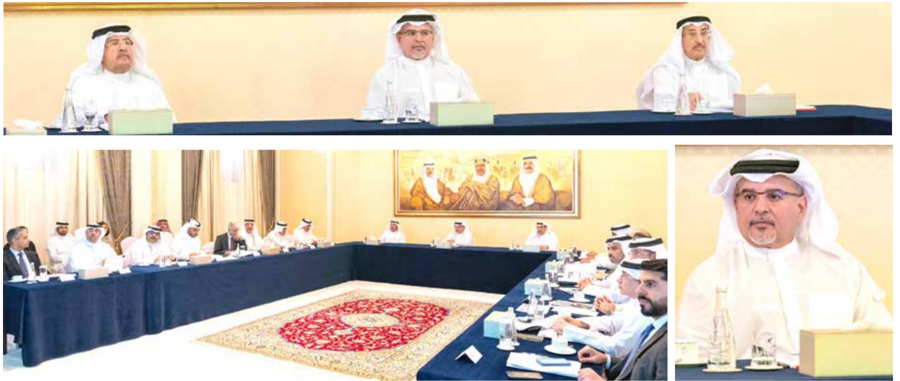
His Royal Highness Prince Salman bin Hamad Al Khalifa, the Crown Prince and Prime Minister, chairs the 469th Government Executive Committee meeting. Developments on the distinguished government employees in customer service programme, development projects in the real estate sector, updates on priority competitiveness indicators, and a project to establish a College of Engineering at the University of Bahrain were reviewed.

Takaful International's profit rises 15% to BD1.149 million