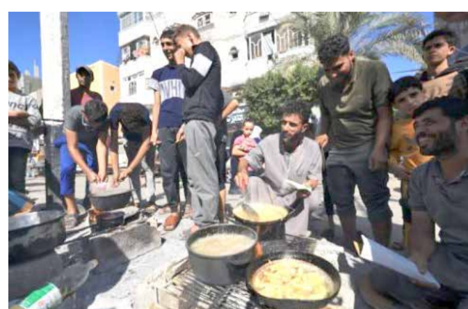
Displaced Palestinians prepare food in front of the United Nations Relief and Works Agency (UNWRA) school at the Nuseirat refugee camp in the central Gaza Strip

As they remembered the dead, the bloodiest Gaza war yet raged on in Israel's campaign to destroy Hamas and has claimed more than 10,300 lives according to the Hamas-run health ministry.