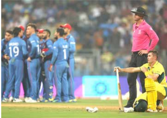
Marnus Labuschagne of Australia reacts after being dismissed

He made Afghanistan pay with an astounding 128-ball innings featuring 21 fours and 10 sixes as he became just the third