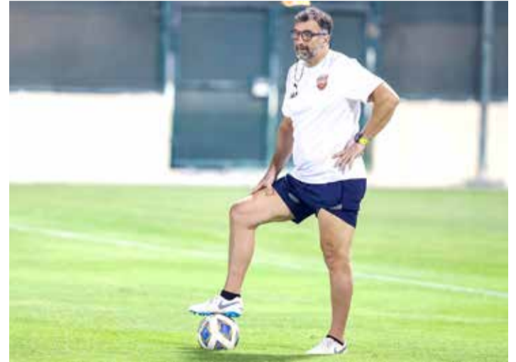
Juan Antonio Pizzi supervises a training session

Aside from FIFA World Cup qualification, Bahrain are also