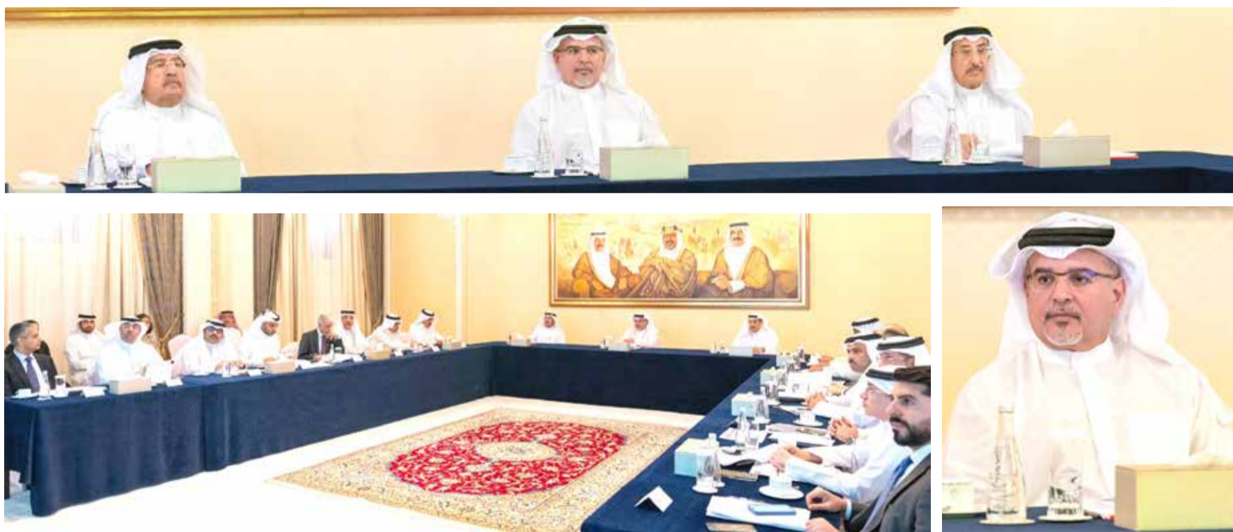
His Royal Highness Prince Salman bin Hamad Al Khalifa, the Crown Prince and Prime Minister, chairs the 469th Government Executive Committee meeting. Developments on the distinguished government employees in customer service programme, development projects in the real estate sector, updates on priority competitiveness indicators, and a project to establish a College of Engineering at the University of Bahrain were reviewed.