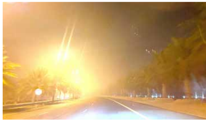
The fog significantly reduces visibility on the road

However, the significantly reduced visibility calls for extra vigilance from all residents and motorists. It is crucial for