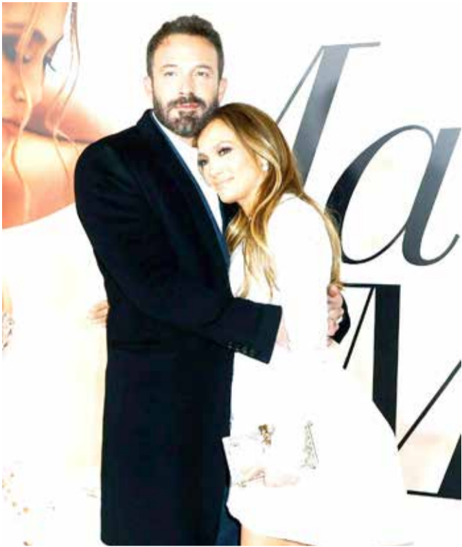
Ben Affleck and Jennifer Lopez