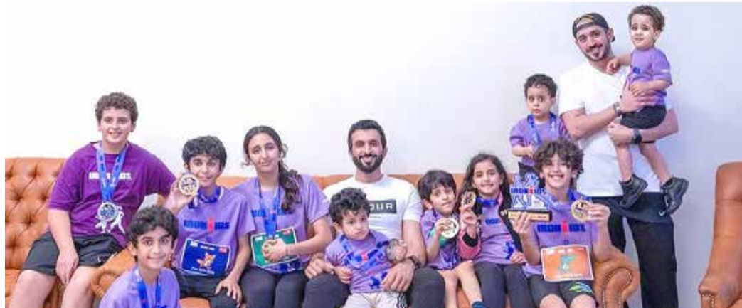
HH Shaikh Nasser bin Hamad Al-Khalifa, Representative of HM the King for Humanitarian Affairs and Youth Affairs, and HH Shaikh Khalid bin Hamad Al Khalifa, First Deputy to the Chairman of the Supreme Council for Youth and Sports, Chairman of the General Body for Sports, and Chairman of Bahrain Olympic Committee, with the participants of Iron Kids 70.3 Middle East Ironman Championship on Thursday. More than 300 children aged 17 and under participated in the championship. HH Shaikh Nasser said the championship contributes to promoting sports culture in children and instill in them a passion to continue practicing.