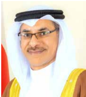
H.E. Osama Al-Asfoor Compiled by Safna Mujeeb TDT | Manama

A wave of parliamentary inquiries has swept through the Kingdom of Bahrain as Members of Parliament (MPs) pose pressing questions to government officials, shedding light on critical issues affecting the nation.