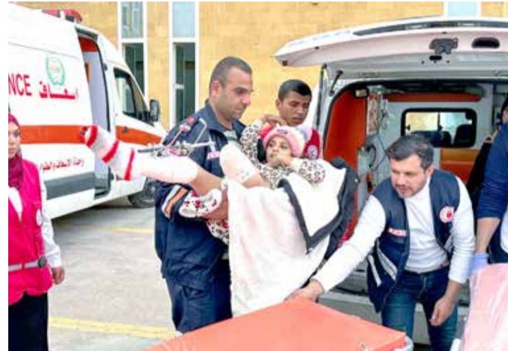
An injured Palestinian girl is helped onto a stretcher by Egyptian paramedics on the Egyptian side of the Rafah border crossing