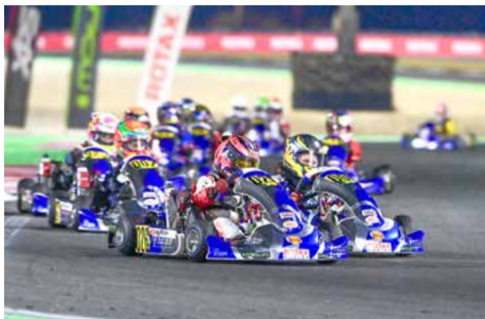
Karters in action at BIKC in the RMC GF this week

eliminations will be taking place along BIC's world-class NHRA drag strip as the BDRC holds Race Day as an exciting culmination to the first meeting's events.