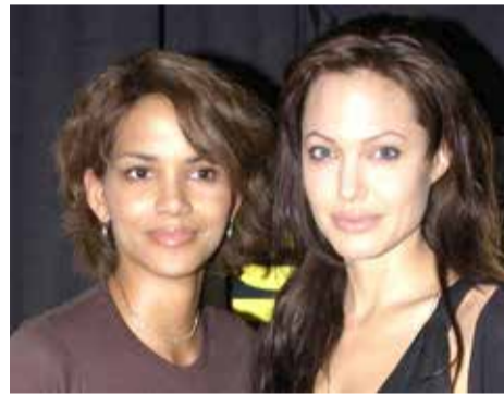
Halle Berry and Angelina Jolie

The Hollywood actress - whose co-star has also been married three times - shared: "We had a rocky start and I think that is going to serve us well in our screen time together."