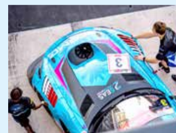
2 Seas' #3 car being rolled out of the pits for yesterday's sessions

More than 200 drag racers from Bahrain, Saudi Arabia, the UAE, Kuwait and Qatar have descended upon the BIC strip this week for heated head-to-head competition in the 14 drag racing categories