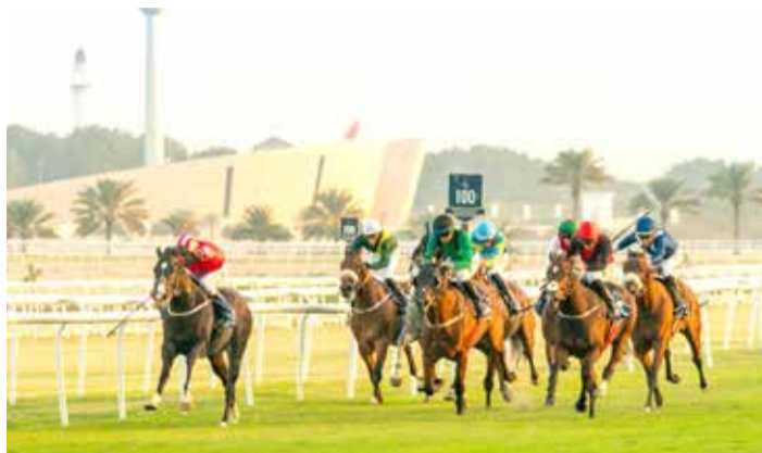
Intense competition at REHC last week