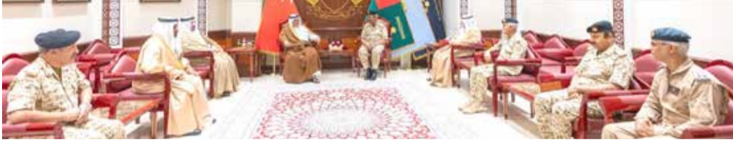
HRH Prince Salman arrives for a meeting with senior BDF officials

HRH Prince Salman briefed on BDF's initiatives to enhance combat readiness efficiency