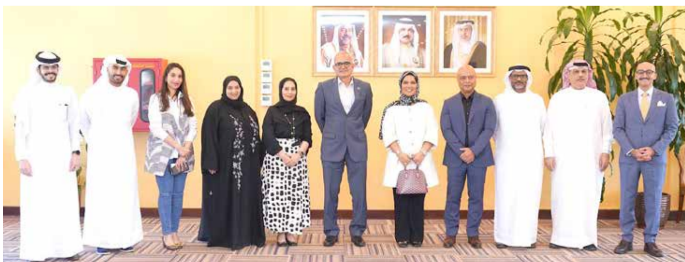
Tamkeen's executive management met with Foulath Holding, an industrial holding company with major steel investments, as part of ongoing visits to introduce the new enhanced programs to private sector enterprises. Tamkeen's executive management showcased the programs, highlighting ways to benefit from them to employ and upskill Bahraini talent.

"We must jointly respond to global challenges and work together to promote world stability and prosperity," Xi said.