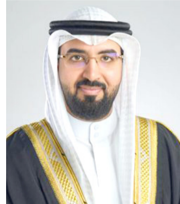
MP Hasan Ebrahim Hasan

The criteria for eligibility, programs for employment and integration, access to education and vocational training, and training programs for specialists in dis-