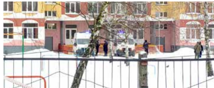
Emergency vehicles are seen on the grounds of Gymnasium Number Five following a shooting, in Bryansk

Moscow has taken steps to tighten already strict gun laws after a series of school attacks. After the Bryansk attack, the Kremlin said it would look into "why the measures did not work". Moscow has voiced