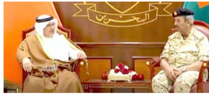
His Royal Highness Prince Salman bin Hamad Al Khalifa, the Crown Prince, Deputy Supreme Commander of the Armed Forces, and Prime Minister, yesterday visited the General Command of the Bahrain Defence Force (BDF), accompanied by His Highness Shaikh Mohammed bin Salman bin Hamad Al Khalifa. (Full report on Page 2)