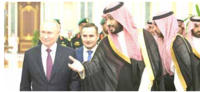
Russian state agency Sputnik shows Russia's President Vladimir Putin and Saudi Crown Prince Mohammed bin Salman attending a welcoming ceremony ahead of their talks in Riyadh

Meeting in Riyadh, Putin and Crown Prince Mohammed bin Salman highlighted the work of the 23-member OPEC+ group of