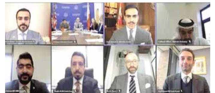
Ambassador Shaikh Abdullah bin Rashid and Ambassador Bondy co-chair the online meeting

The meeting discussed bilateral cooperation, including in security, economic, culture, education and tourism sectors. It also discussed the completion of procedures to launch direct flights between the two countries, as well as cooperation in combatting human trafficking,