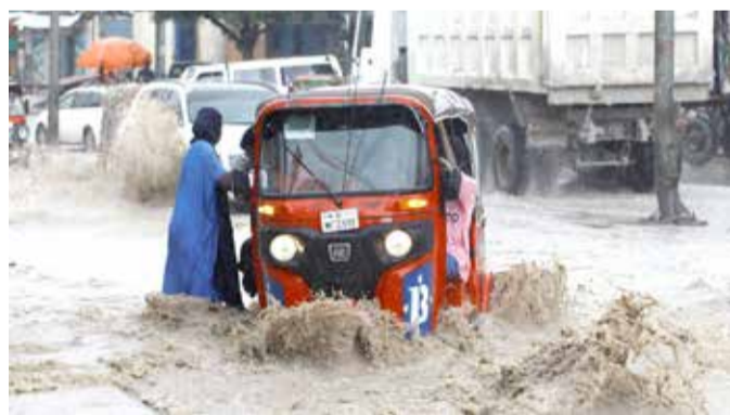
Representative picture Nairobi, Kenya

Climate change caused by human activity made torrential rains that have lashed East Africa since October and killed more than 300 people up to twice as intense, a scientific study said Thursday. Somalia, Kenya and Ethiopia are grappling with heavy rainfall that has caused flooding in the latest devastating climate disaster to strike the region after a record drought. Scientists from the World Weather Attribution (WWA) group said the current rainfall "was one of the most intense ever recorded in the region" between October and December. "Climate change also contributed to the event, making the heavy rainfall up to two times more intense," they said, adding that the exact contri-