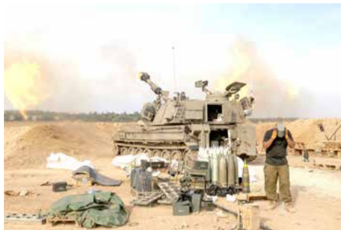
An Israeli army self-propelled artillery howitzer fires rounds from a position near the border with the Gaza Strip in southern Israel

Two Israeli tank rounds were used in the attack that killed a Reuters journalist and wounded six others in southern Lebanon on October 13, an investigation published yesterday by the news agency found. Issam Abdallah, 37, was killed instantly in the incident. The others present -- two other Reuters journalists, two from Qatari broadcaster Al Jazeera, and two from AFP -- were all injured. AFP photographer Christina Assi, 28, was seriously wounded, later had a leg amputated and is still in hospital. An AFP investigation conducted with Airwars, an NGO that investigates attacks on civilians in conflict situations, showed that the first strike involved a 120-mm tank shell only used by the Israeli army in this region. Amnesty and Human Rights Watch also concluded that the first strike that killed Abdallah and severely wounded Assi was most likely a tank round fired from Israel. For its investigation, Reuters worked with the Netherlands Organisation for Applied Scientific Research (TNO), an independent research institute which works with the Dutch defence ministry. The probe pointed to "the tail fin of a 120 mm tank round