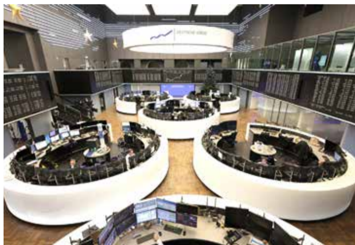
Traders work in front of a chart of Germany's share index DAX that is displayed (in background) at the stock exchange in Frankfurt am Main, western Germany

vate payroll firm ADP reinforced the view that the labour market and economy were slowing as inflation comes down. Jobless benefits claims data held steady. "The slowdown in hiring continues and is becoming more obvious," said Peter Boockvar,