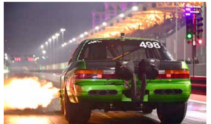
A drag racing participant gets ready to power down the strip

The trio posted a fastest lap of one minute 53.208 seconds in the session behind the wheel of their Mercedes AMG-GT3 contender. They were also second-fastest in class, behind only