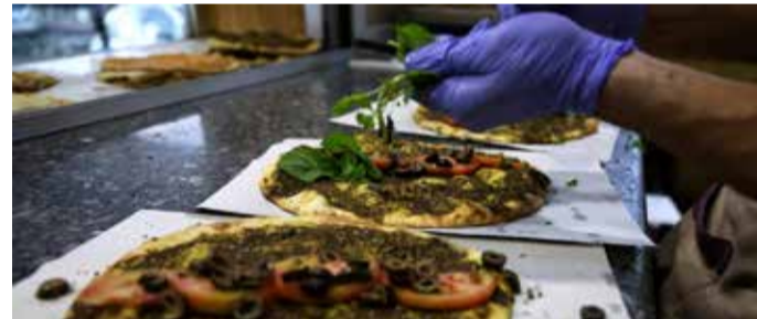
A baker tops traditional Lebanese manoushe flatbreads with mint, tomatoes and olives

"While preparing the dough, the practitioners pray that it