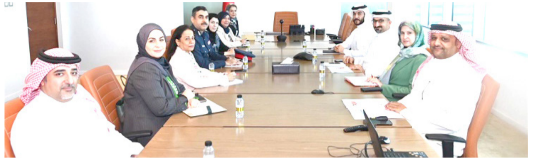
Mr Fakhro and Brigadier-General Bin Dinah with other participants in the meeting

The Minister affirmed the prominent role of the National Plan to Promote the Spirit of Belonging to the Nation and Reinforce the Values of Nationalism (Bahrainouna), headed by General