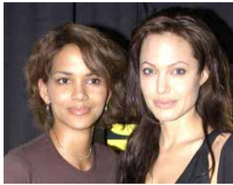
Halle Berry and Angelina Jolie

The Hollywood actress - whose co-star has also been married three times - shared: "We had a rocky start and I think that is going to serve us well in our screen time together."