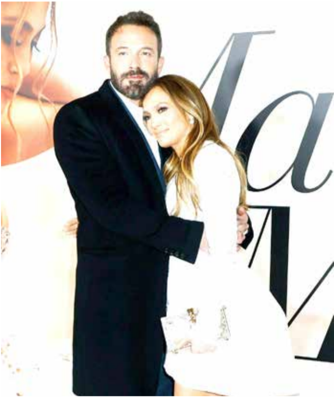
Ben Affleck and Jennifer Lopez