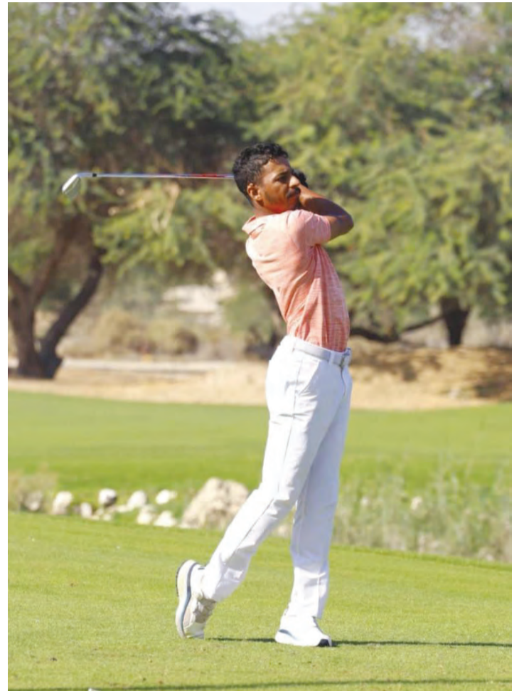
Action from a previous event