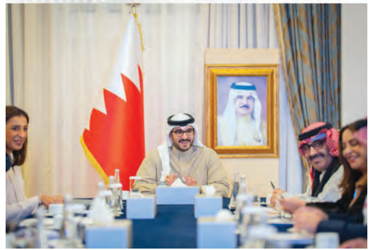
HH Shaikh Isa bin Salman bin Hamad Al Khalifa chairs the Board of Trustees meeting

He affirmed the importance of partnerships between the public and private sectors and their role in supporting educational initiatives that contribute to the development of human resources and the preparation of the national workforce to address future challenges.