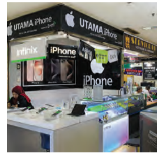
Vendors wait for customers at a mobile phone shopping centre in Jakarta

Indonesia upholds iPhone 16 sales ban after Apple offers $1 bn investment