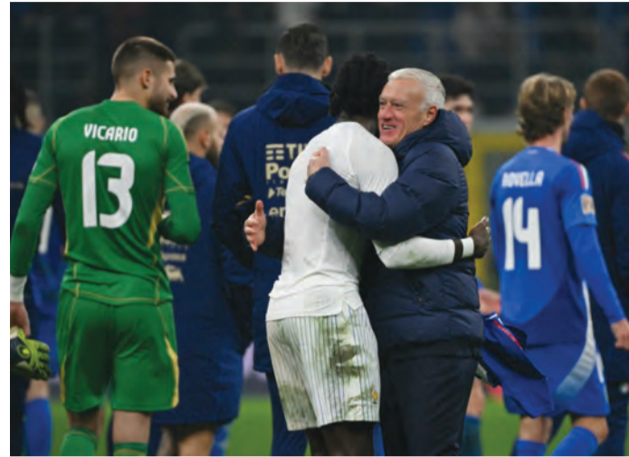
France's head coach Didier Deschamps (C,R) celebrates his team's victory after a match (file photo)

sally welcomed and criticism grew following last year's Euros when France were beaten in the semi-finals.