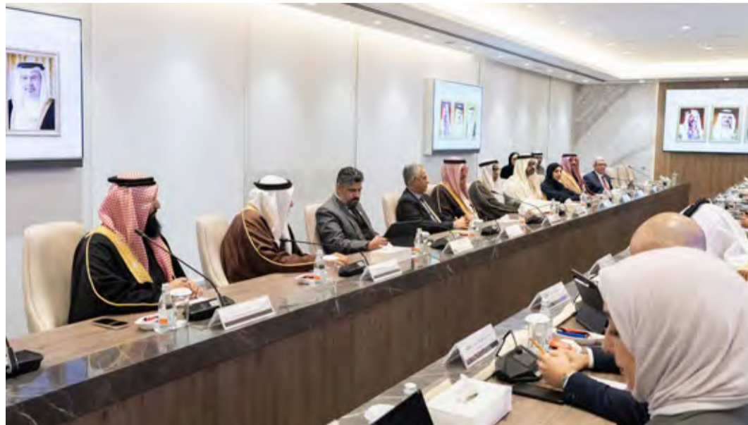
Government-Parliament joint meeting in progress

The government delegation included H.E. Shaikh Salman bin Khalifa Al Khalifa, Finance