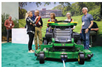
Attendees look at a John Deere autonomous lawnmower