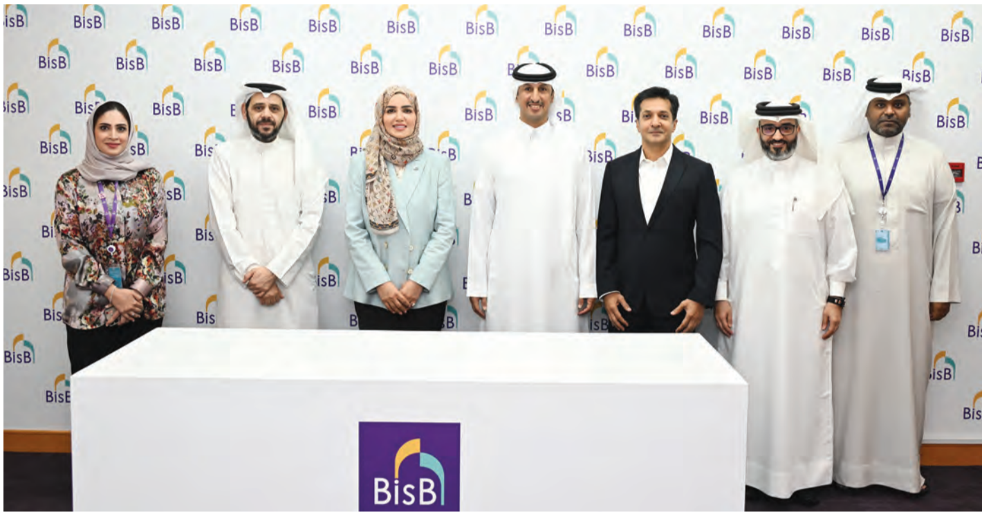
Officials following the deal signing

The Memorandum of Understanding (MoU) aims to strengthen national efforts to combat food poverty, reduce waste, and promote conscious production and consumption. By ensuring fair and responsible redistribution of surplus food to vulnerable communities, it contributes to the attainment of UN's Sustainable Development Goals (SDGs), particularly SDG 2: Zero Hunger. Both organisations will also work on raising public awareness about the importance of food preservation. BisB's volunteer team 'Jood' will actively help Conserving Bounties by participating in food distribution and providing administrative and logistical as-