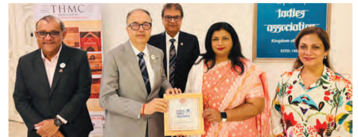
ILA and THMC representatives at the MoU-signing ceremony