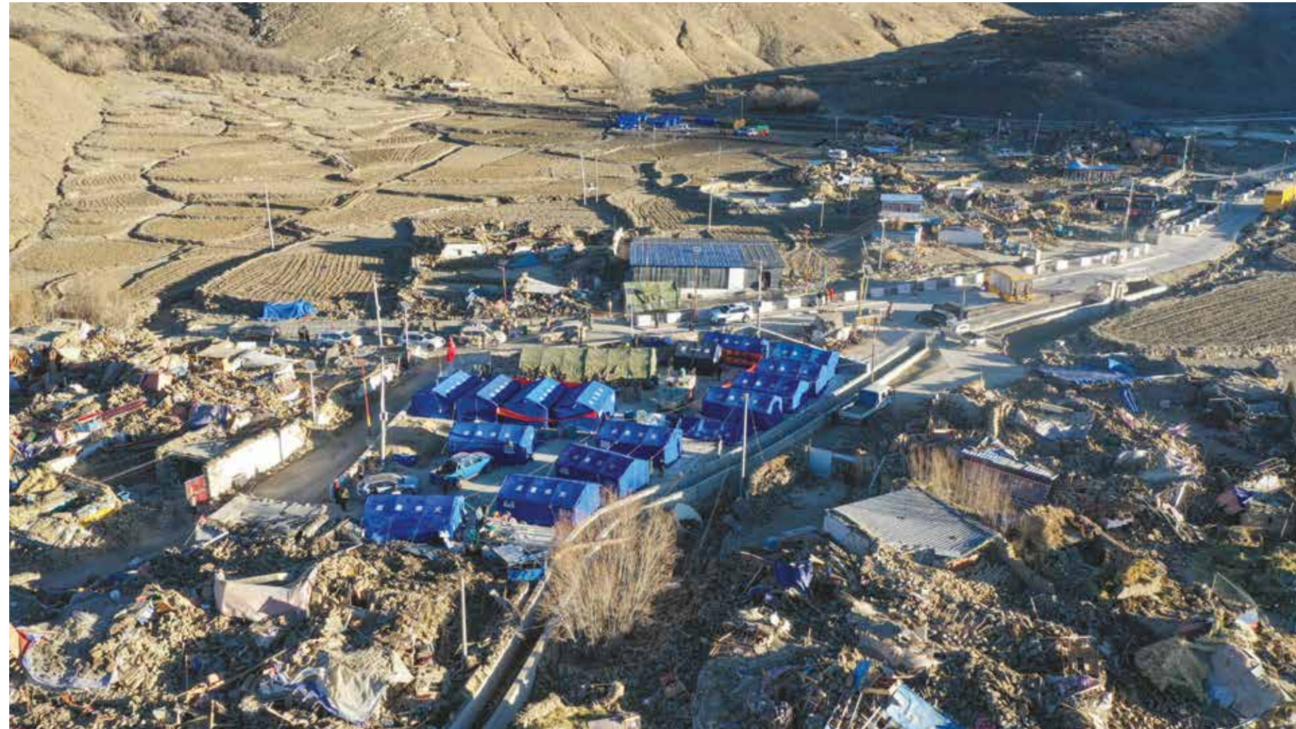
An aerial view shows collapsed buildings after an earthquake and newly-erected aid tents at Cuoguo township in Shigatse, southwestern China's Tibet region