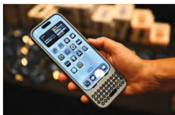
The Clicks physical keyboard for Apple iPhone

An Autonomous Refuse Robot runs through a demonstration at Oshkosh's booth