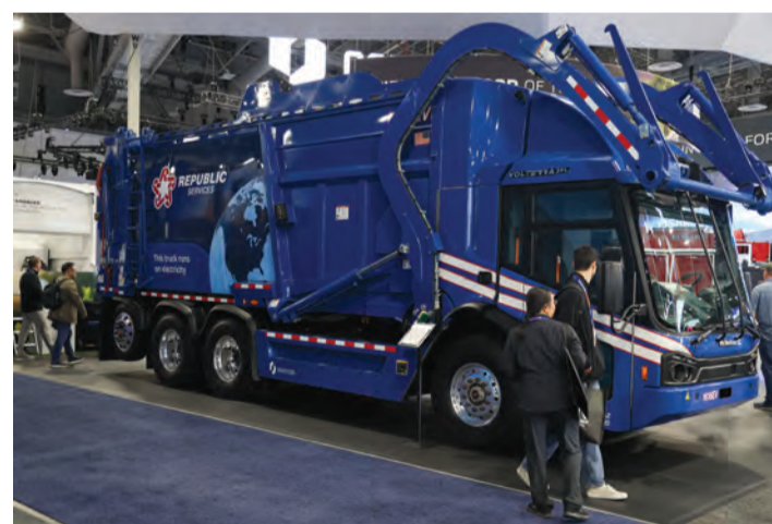
Spectators walk past an Electric Refuse Collection Vehicle at the Oshkosh booth