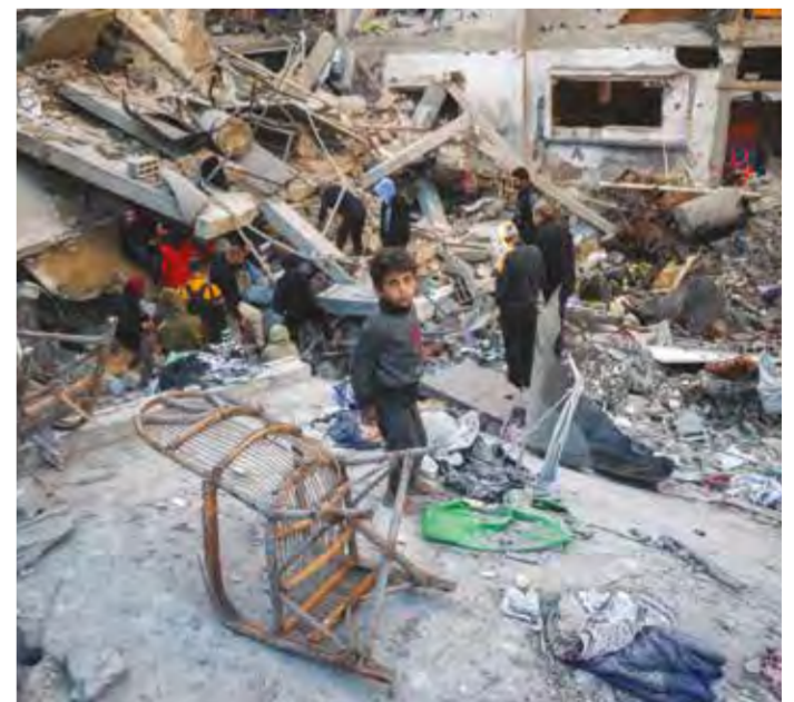
People search the rubble of a building destroyed in an Israeli strike on the Bureij camp for Palestinian refugees in the central Gaza Strip

The Red Cross called yesterday for safe and unhindered access to Gaza to bring desperately needed aid into the war-torn Palestinian territory wracked by hunger and where babies are freezing to death. Heavy rain and flooding have ravaged the makeshift shelters in Gaza, leaving thousands with up to 30 centimetres (one foot) of water inside their damaged tents, the International Federation of Red Cross and Red Crescent Societies said. The dire weather conditions were "exacerbating the unbearable conditions" in Gaza, it said, pointing out that many families were left "clinging on to survival in makeshift camps, without even the most basic necessities, such as blankets". Citing the United Nations, the IFRC highlighted the deaths of eight newborn babies who had been living in tents without warmth or protection from the rain and falling temperatures. Those deaths "underscore the critical severity of the humanitarian crisis there", IFRC Secretary-General Jagan Chapagain said in a statement. "I urgently reiterate my call to grant safe and unhindered access to humanitarians to let them provide life-saving assistance," he said. "Without safe access -- children will freeze to death. Without safe access -- families will starve. Without safe access -- humanitarian workers can't save lives." According to a UN count, more than 330 humanitarian workers have been killed in Gaza since Israel unleashed its war there following Hamas's October 7, 2023 attack.