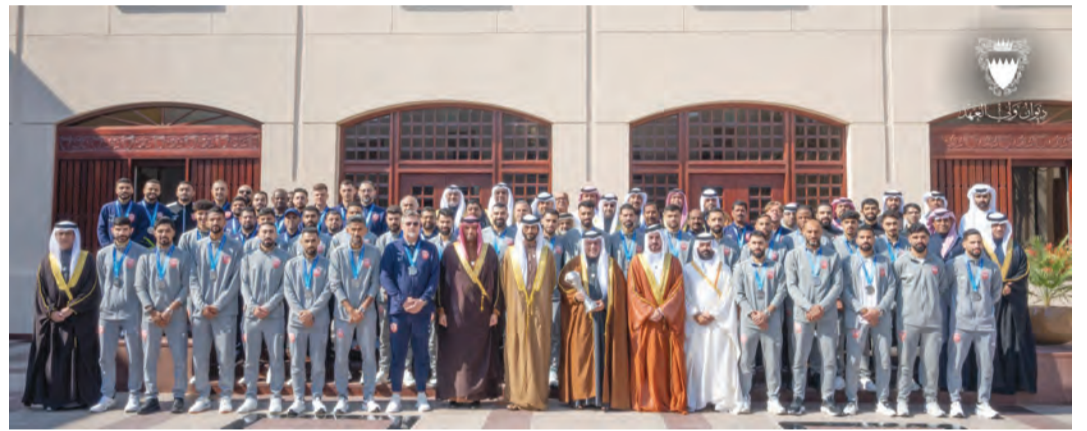
HRH the Crown Prince and Prime Minister with the Bahrain national football team

He affirmed the dedication and commitment of His Majesty the King's Representative for Humanitarian Work and Youth Affairs, Chairman of the Supreme Council for Youth and Sports, His Highness Shaikh Nasser bin Hamad Al Khalifa and the First Deputy Chairman