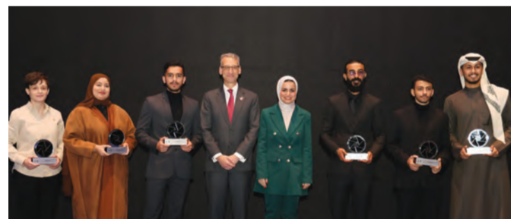
'Heroes Behind the Track' Documentary Team