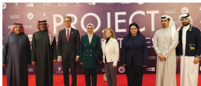
Ambassador Bondy and the Minister of Youth Affairs at the red carpet ceremony with other officials

and awards ceremony highlighted the power of storytelling in bridging cultures and celebrating local heritage.