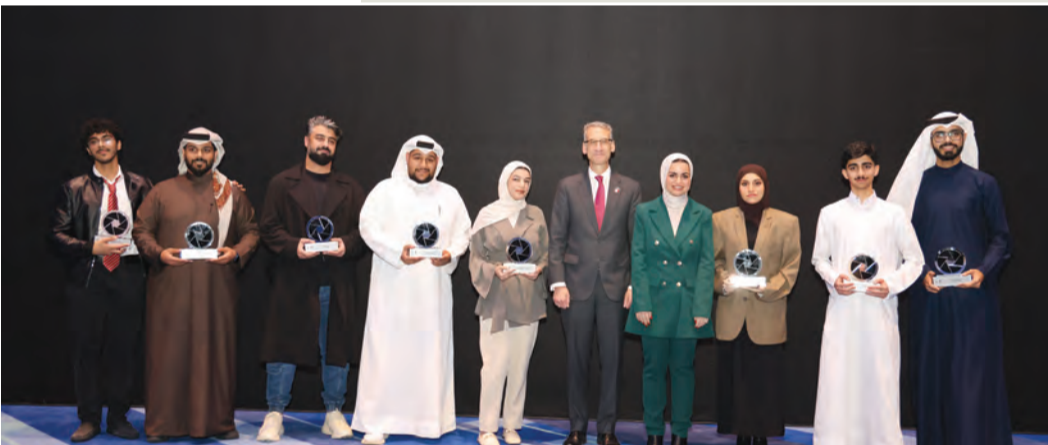
'Hope from the Ashes' Documentary Team