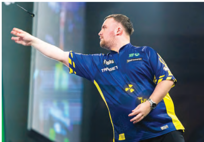
Luke Littler in action (file photo)

● Luke Littler returns as reigning World Champion after stellar 2024/25 season