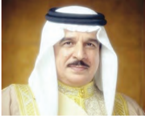
HM the King