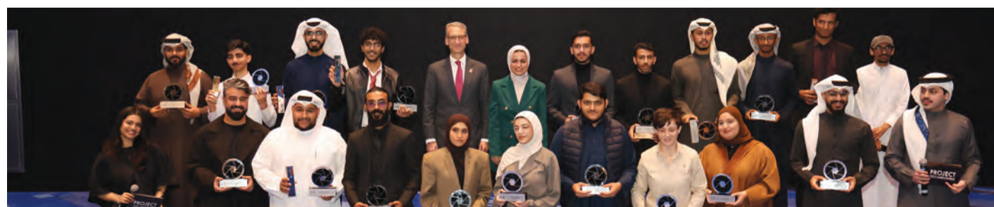
Young Bahraini filmmakers with the Minister of Youth Affairs, Her Excellency Rawan bint Najeeb Tawfiq