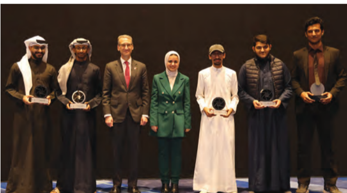
'AlDana' Documentary Team

The event underscored the importance of collaboration,