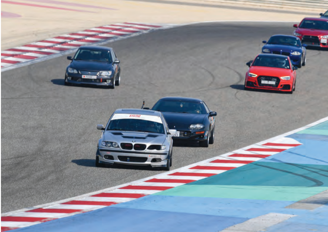
Action from a previous event at BIC

National Race Day is organised and run by BIC, in cooperation with the Bahrain Motor Federation, the Circuit Racing