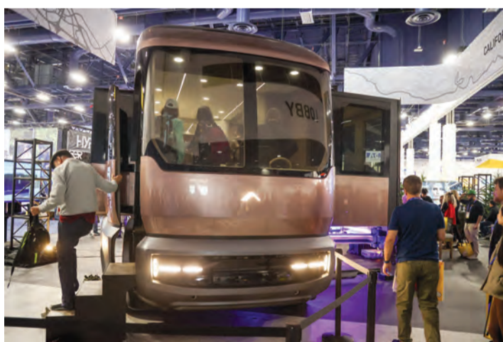
Attendees tour the inside of the AC Future's AI-Transformable Home RV

"We see space not merely as a physical location but as an environment where holistic experi-