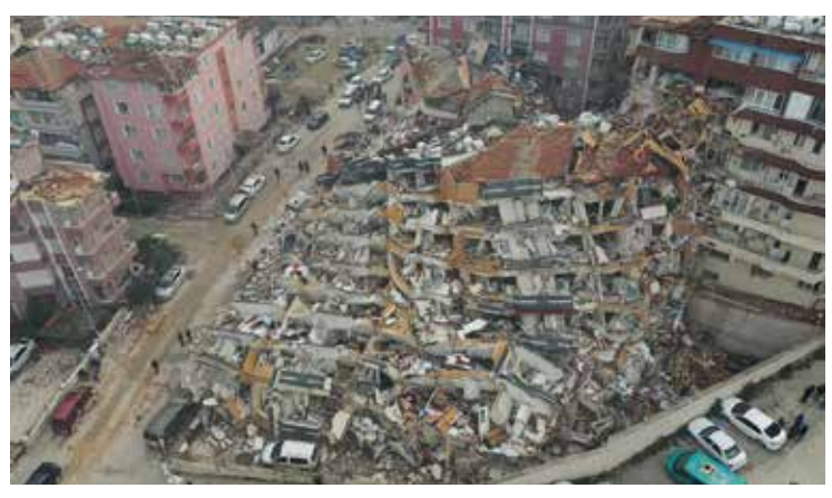
An aerial view shows damaged and collapsed buildings following an earthquake, in

"My father, my mother, my wail of ambulance sirens in the Antakya, saying she had not seen children. The wife and two kids had been problems with roads of my brother who got out with and airports but "we are better