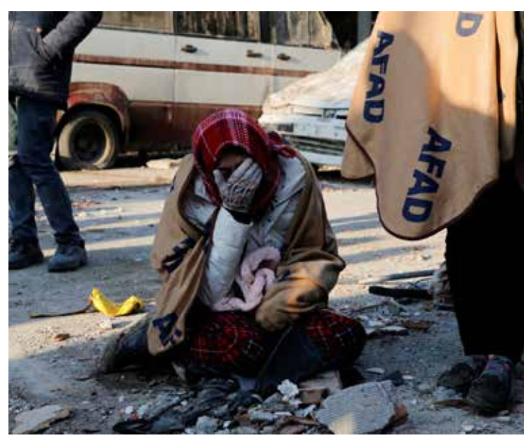
A woman reacts as she sits next to the site of a collapsed building following an earthquake in Kahramanmaras, Turkey