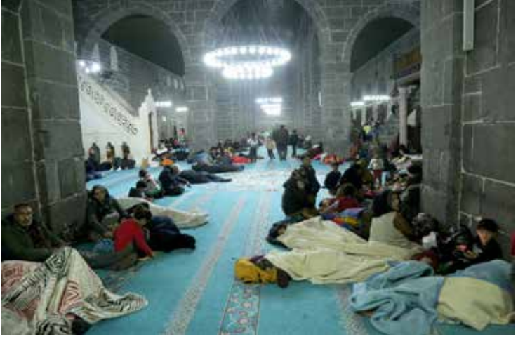
People take shelter at the historical Ulu Mosque following an earthquake, in Diyarbakir, Turkey