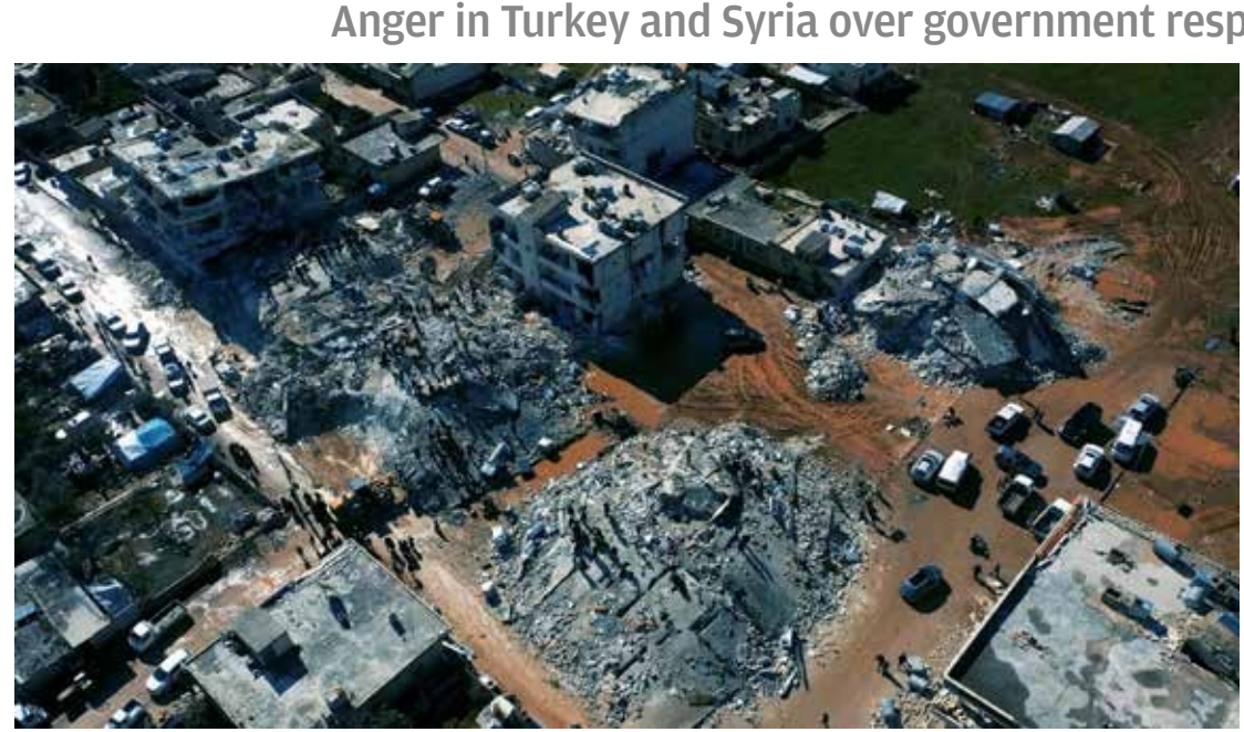
Damaged buildings and rescue operations are seen in the aftermath of the earthquake, in Aleppo, Syria February 7, 2023, in this

In the Turkish city of Antakya, dozens of bodies, some covered in blankets and sheets and others in body bags, were lined up on the ground outside a hospital.