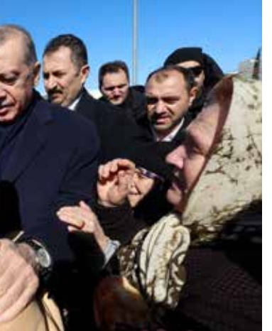
vith people in the aftermath of a deadly