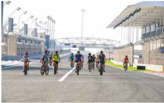
Participants ride their bicycles on track at BIC (file photo)

The running and cycling will take place on separate track layouts. Runners and walkers will be utilising the 2.550-kilometre Inner Track, while cyclists will be able to ride their bikes along BIC's 3.543-kilometre Outer cir-