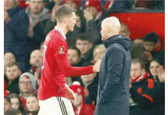
Manchester United manager Erik ten Hag shakes hands with Wout Weghorst after he was substituted (file photo)