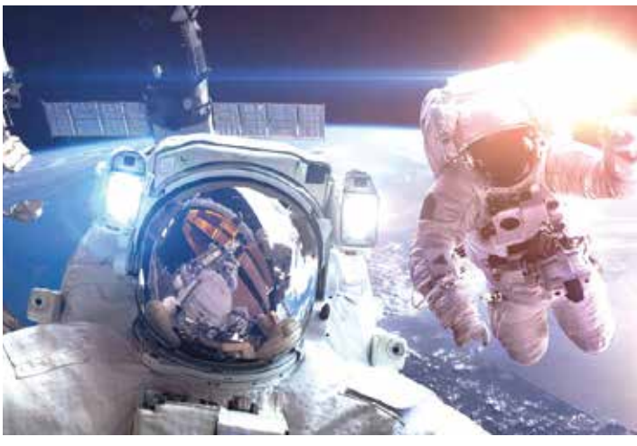
The accords will shape Bahrain's vision for the advancement of space science

Bill Nelson in a statement posted on its website.