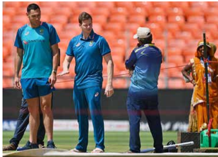
Australia's Steven Smith (2L) speaks with ground staff at the pitch of the Narendra Modi stadium in Ahmedabad

Stand-in Australia skipper Steve Smith said yesterday the pitch for the fourth Test looks good for batsmen and different from the usual day-one turners in the previous matches in India. Australia will look to level the series at 2-2 in the final Test starting Thursday in Ahmedabad after they bounced back from two losses to win the third Test on a viciously turning pitch. "It's just playing what's in front of us really, obviously the scores haven't been big throughout this whole series. India scored 400 in that first Test match and Rohit got 100 and 400 proved to be way too many," Smith told reporters. "This wicket may be a little bit different. Perhaps it may not spin as much from the first ball or the first day but I do think it will spin as the game goes on."