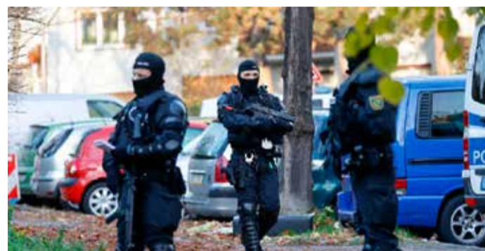
Representative picture courtesy of NBC News

Gemal D. and three others were arrested in the southwestern region of Pyrenees-Orien-