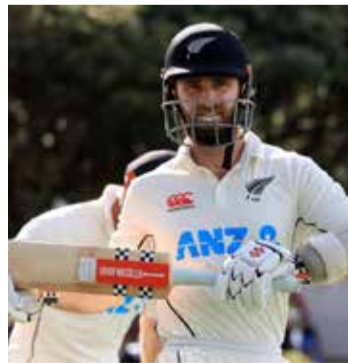
New Zealand's Kane Williamson prepares to take the field (file photo)

New Zealand expect record-breaking batsman Kane Williamson will be "ready to go" when their Test series starts against Sri Lanka on Thursday, despite his late arrival because of a bereavement. Williamson remained at home in the build-up to attend a memorial service yesterday for his grandmother. Ahead of the opening Test in Christchurch, captain Tim Southee said the Black Caps were "feeling for Kane at the moment". Southee said that while Williamson had not been part of the team's preparations he had