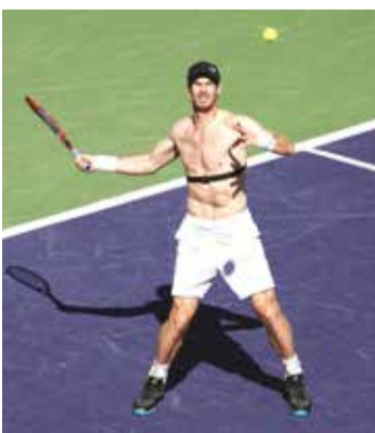
Andy Murray of Great Britain in a practice session during the BNP Paribas Open

Murray, 35, received the ATP's Arthur Ashe Humanitarian Award for 2022 after donating more than £500,000 ($592,000, 562,000 euros) in prize money to help children in Ukraine affected by Russia's invasion, but