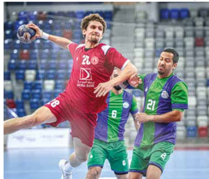
Action from Al Arabi's win over Al Ahli Sidab