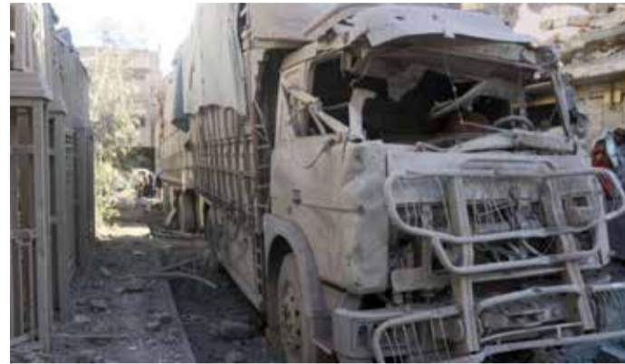
Aftermath of drone strike reveals destruction and wreckage of vehicles

peated air and missile strikes against government forces and their Iran-backed allies. A US-led coalition has also carried out strikes.