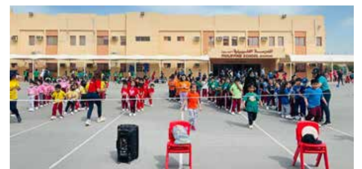
Kindergarten students performing their limbo rack game