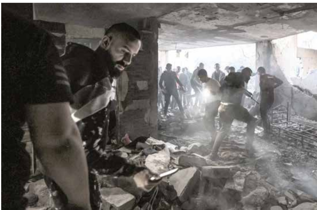
People inspect the wreckage of a building that was hit by rockets during an Israeli army raid in the Jenin camp for Palestinian refugees.