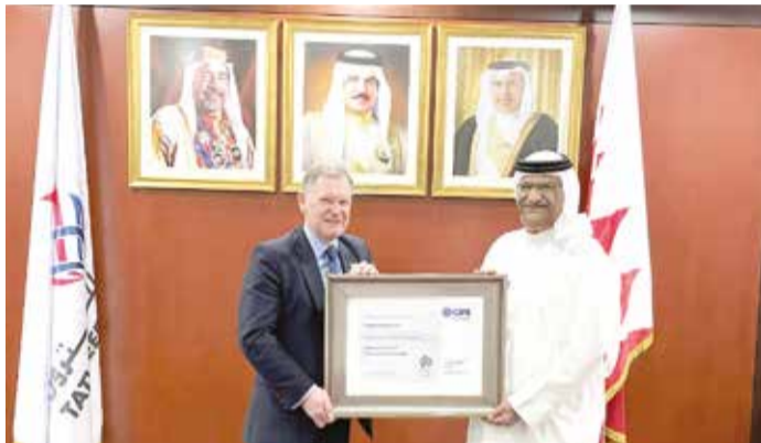
The CIPS certificate