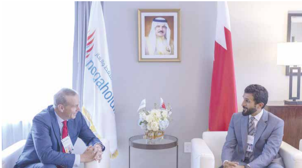
HH Shaikh Nasser holds talks with Bechtel

The meetings were in line with the vision of His Majesty King Hamad bin Isa Al Khalifa and His Royal Highness the Crown Prince and Prime Minister Prince Salman bin Ham-