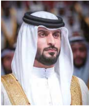
HH Shaikh Nasser bin Hamad Al Khalifa