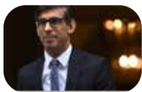
Australia, US, Britain leaders to meet, submarine deal expected

◆ The leaders of the United States, Britain and Australia will meet in the United States next week to discuss security and foreign policy, the British Prime Minister's office announced on Wednesday, ahead of an expected nuclear submarine deal aimed at countering China's growing assertiveness in the Pacific. After 18 months of negotiations, it is anticipated that Australia will reveal plans to obtain eight nuclear-powered submarines, in what Australian Prime Minister Anthony Albanese has called "the single biggest leap" in defence capability in his country's history. The deal is part of the fledgling regional security pact between Australia, the United Kingdom and the United States known as AUKUS.