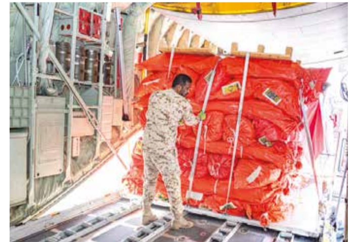
Delivery of relief aid to Turkey

● Part of royal directives to help quake victims