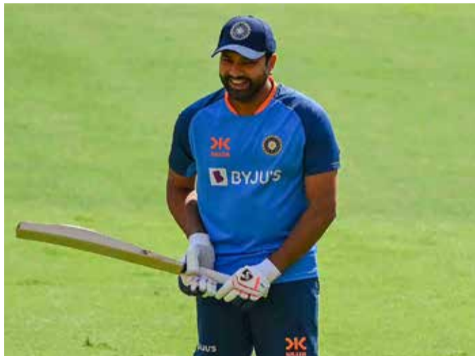
India's captain Rohit Sharma attends a training session