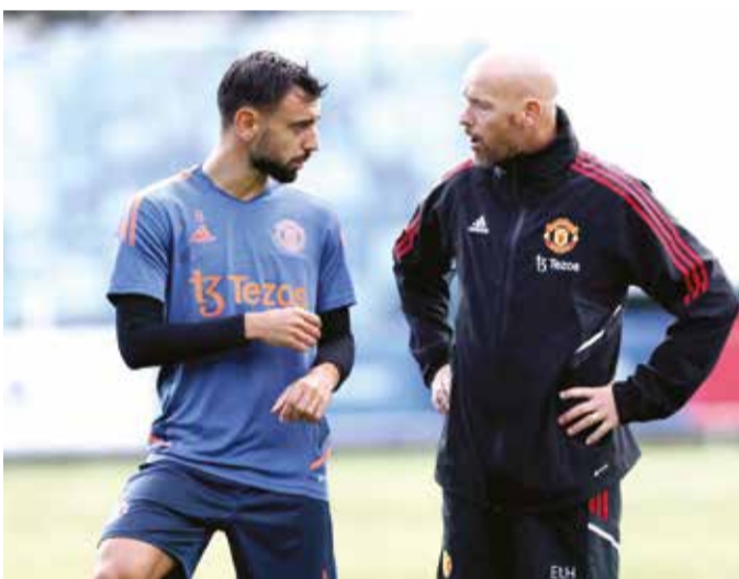
Manchester United's Bruno Fernandes (L) talks to the team's manager Erik ten Hag during a training session (file photo)