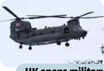
UK opens military base in northern Norway

◆ The UK yesterday announced the opening of a military base in the far north of Norway to strengthen NATO's capabilities in the Arctic amid concerns following Russia's invasion of Ukraine. The newly established Norwegian site, called Camp Viking, will serve as a hub for Royal Marines Commandos, said Britain's Royal Navy. It described the troops as "the tip of the Arctic spear" and "the unit the UK turns to when it needs troops able to fight in cold weather extremes. "A new Arctic operations base will support Britain's commandos for the next 10 years as the UK underscores its commitment to security in the High North," the statement added. Norway, which borders Russia, refuses to host permanent bases for foreign soldiers, so Camp Viking is due to remain open for just a decade. The purpose-built base, located around 40 miles (65 kilometres) south of Tromsø, will be able to accommodate all personnel from the elite commando-led Royal Marines force which reacts to emerging crises in Europe.