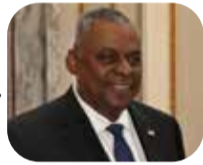
Austin and Sisi reaffirm US-Egypt military ties: presidency