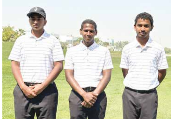
Bahrain's junior national golf team members