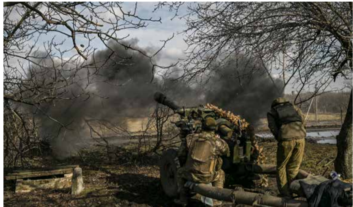
Ukrainian servicemen fire a 105mm Howitzer towards Russian positions, near the city of Bakhmut

NATO Secretary General Jens Stoltenberg warned yesterday the eastern Ukrainian city of Bakhmut may fall into Russian hands in the coming days following months of intense fighting. His remarks come as Russia's Wagner mercenary group, which has spearheaded the attack on Bakhmut, claimed to have captured the eastern bank of the industrial town that has been devastated in the longest battle since Moscow invaded. In Stockholm, EU ministers were discussing plans to ramp up defence production and rush ammunition to Ukraine as it burns through thousands of howitzer shells each day. Wagner chief and Kremlin ally Yevgeny Prigozhin said on social media Wednesday that his forces "have taken all of the eastern part of Bakhmut", a salt-mining town with a pre-war population