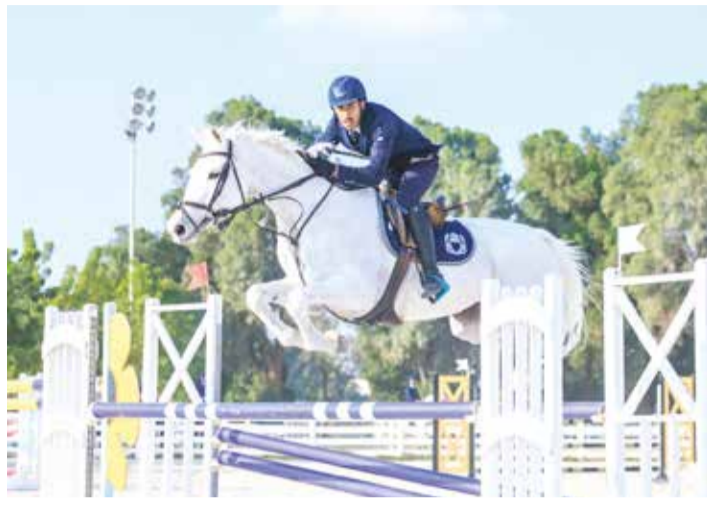
Action from a previous show jumping event