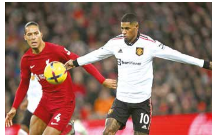
Manchester United's Marcus Rashford (R) vies with Liverpool's Virgil van Dijk

Marcus Rashford defended Manchester United's effort in a historic 7-0 thrashing at the hands of Liverpool, with the Red Devils' top scorer putting a second half collapse down to a lack of organisation.