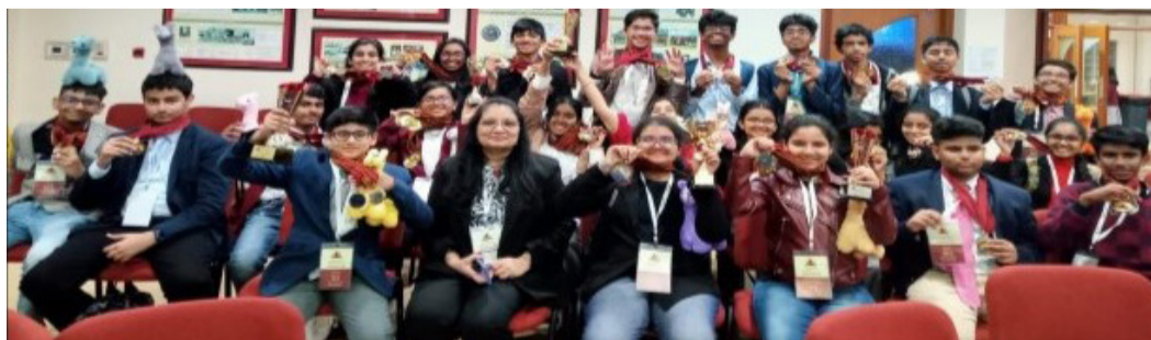
Triumphant Bhavans-Bahrain Indian School students with their proud teachers

ment of Champions. The program enabled students to explore beyond the academic curriculum and interact with students from different