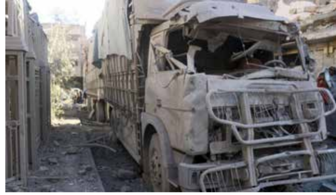
Aftermath of drone strike reveals destruction and wreckage of vehicles

peated air and missile strikes against government forces and their Iran-backed allies. A US-led coalition has also carried out strikes.