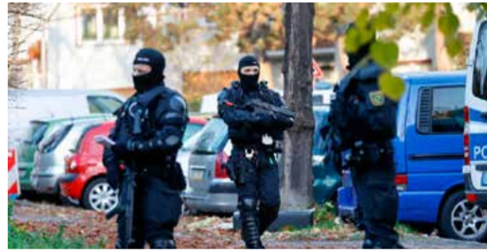
Representative picture

Gemal D. and three others were arrested in the southwestern region of Pyrenees-Orien-