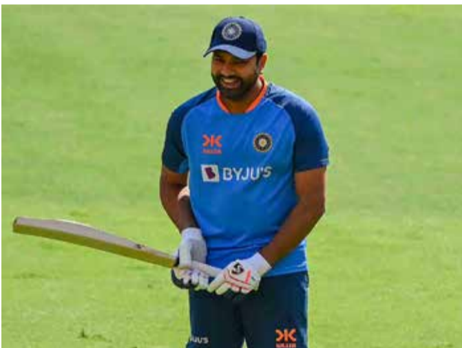
India's captain Rohit Sharma attends a training session