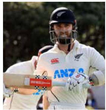
New Zealand's Kane Williamson prepares to take the field (file photo)

Southee said that while Williamson had not been part of the team's preparations he had