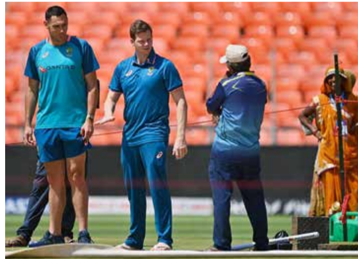
Australia's Steven Smith (2L) speaks with ground staff at the pitch of the Narendra Modi stadium in Ahmedabad

"This wicket may be a little bit different. Perhaps it may not spin as much from the first ball or the first day but I do think it will spin as the game goes on.