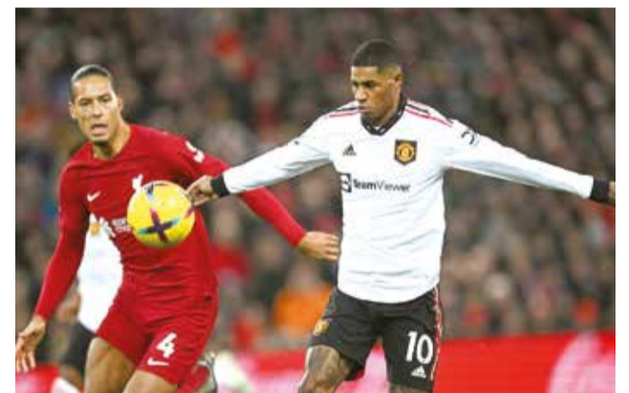
Manchester United's Marcus Rashford (R) vies with Liverpool's Virgil van Dijk