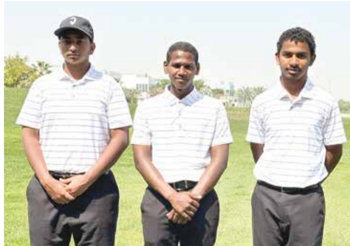
Bahrain's junior national golf team members