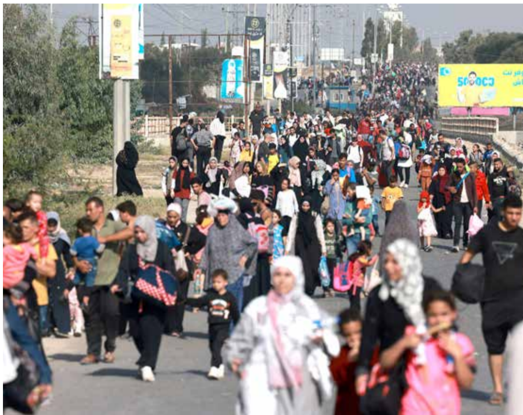
Palestinians fleeing Gaza City and other parts of northern Gaza towards the southern areas, walk on a road yesterday amid the ongoing fighting.

A source told AFP that talks were underway for the release of a dozen of the hostages, including six Americans, in return