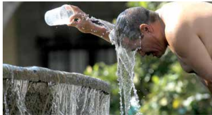
A man cools himself down from a water fountain during one of the hottest days in Guadalajara, Mexico.

Sea surface temperatures were the highest ever recorded for the month, a phenomenon driven by global warming that scientists say plays a key role in driving storms to be more fero-