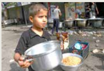
A child carries a pot as Palestinians cook in a street in Rafah

Paris, France Israeli representatives will not participate at today's "humanitarian conference" for Gaza in Paris organised by French President Emmanuel Macron, his office said.