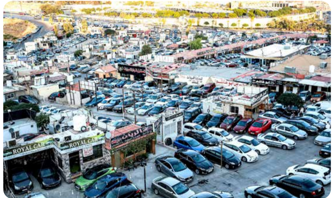
A view of the "Haraj Tabbour" complex in Amman where traders and customers of traditional fuel cars sell and buy used cars.

I used to spend on gasoline." With Octane 90 unleaded petrol selling at about $1.40 per litre, Zatari said he used to spend about 120 dinars ($170) on fuel per month. He has slashed this to 40 dinars -- the average rise in his monthly electricity bill -- and is able to drive longer distances at no additional cost.