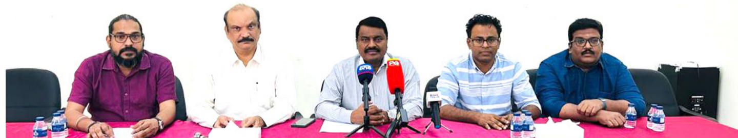
Bahrain Keraleeya Samajam officials speak about the event