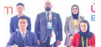
The deal signing

Export Bahrain, the Kingdom of Bahrain's national export promotion agency and Alibaba.com, a leading platform for global business-to-business (B2B) e-commerce, yesterday signed a Memorandum of Understanding (MoU) to boost global trade and economic growth in Bahrain.