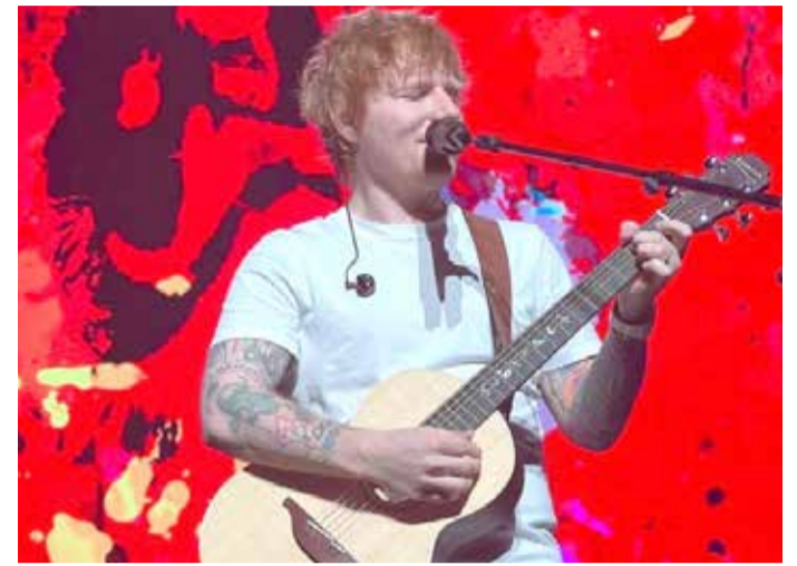
Sheeran set to captivate audience with his mesmerising live performances

Ticket sales for the event will commence on November 10, 2023, at 10 a.m. through the official Al Dana Amphitheatre website.