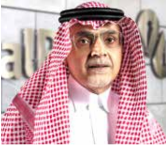
Sheikh Abdullah Saleh Kamel