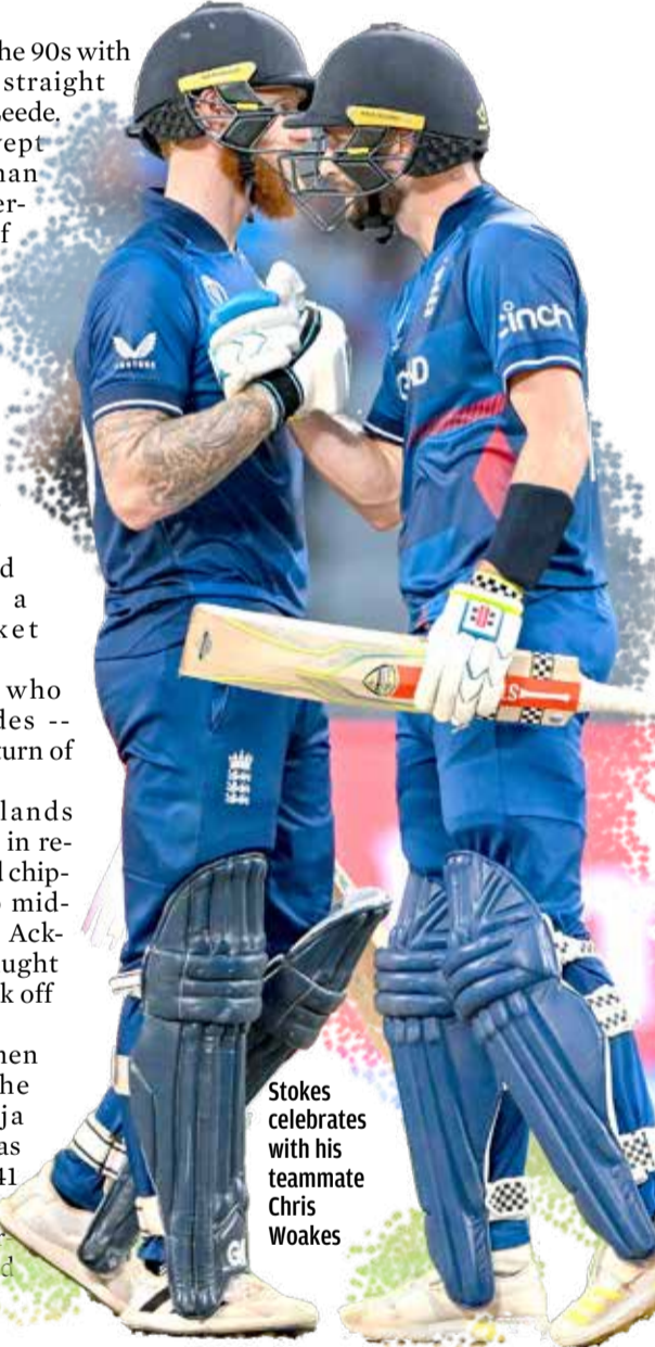
Stokes celebrates with his teammate Chris Woakes

Several batsmen made it into the 30s, while Teja Nidamanuru was left stranded on 41 not out when the man van Meekeren was stumped off Moeen.