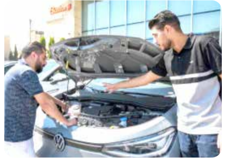
A salesman at a car dealership assists a customer inspecting an electric vehicle