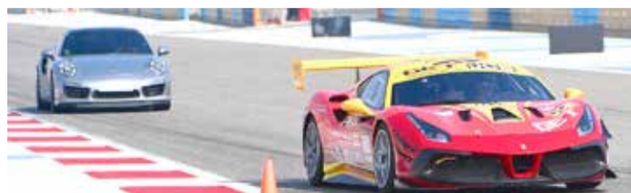
Cars in an Open Track event at BIC

Those participating will have the chance to exercise either on foot or on a bicycle within BIC's safe and controlled envi-