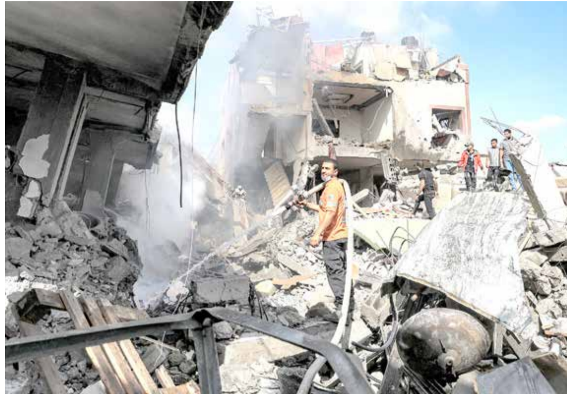
A Palestinian civil defence member sprays a building with a hose to put out a fire in a collapsed building in the aftermath of Israeli bombardment in Khan Yunis in the southern Gaza Strip

Rajagopal stressed that civilian housing in Israel was also not a