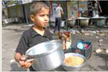
A child carries a pot as Palestinians cook in a street in Rafah

The French leader had also spoken to Egypt's President Abdel Fattah al-Sisi and Qatar's