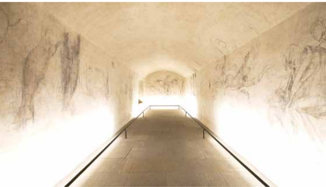
Sketches in the so-called 'secret room' of Michelangelo

Qatar also hosts the political office of Hamas and is the main residence of its self-exiled leader Ismail Haniyeh.