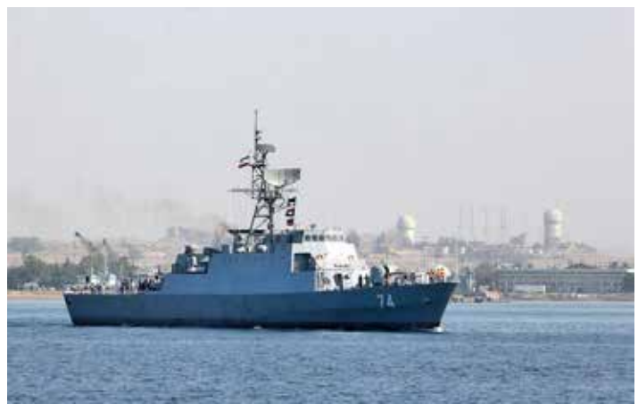
The Iranian ship where thousands of weapons were seized

The UN imposed an arms embargo on the Houthis in 2015.