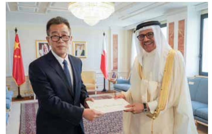
New Chinese envoy presents credential to minister TDT | Manama

Ni Ruchi, who has been appointed as the new Ambassador of the People's Republic of China to Bahrain, presented his credentials to Dr Abdullatif bin Rashid Al-Zayani, the Minister of Foreign Affairs, at the Ministry's headquarters yesterday.