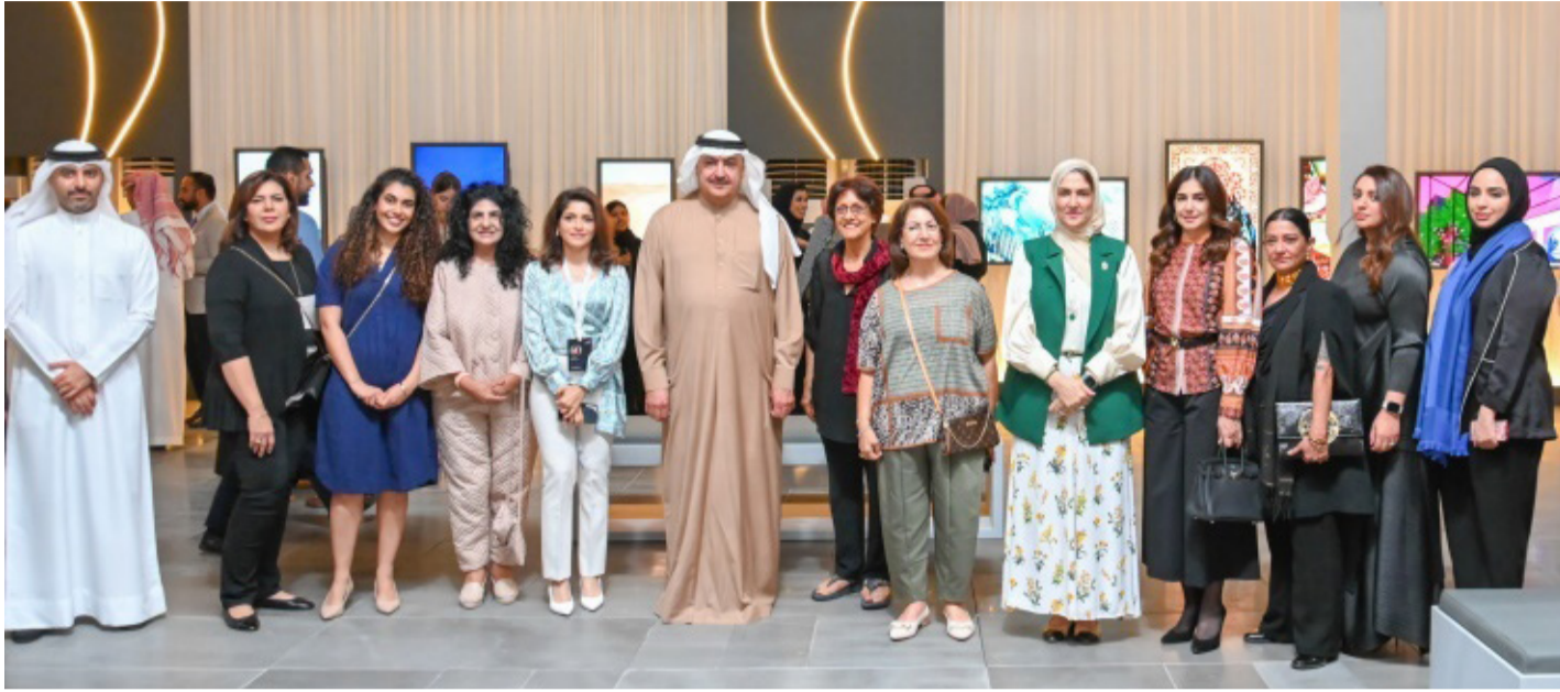
Officials during a photocall at the expo

Council for Women (SCW) in cooperation with the UN Women Regional Office for the Arab States (ROAS) and ROAS' office