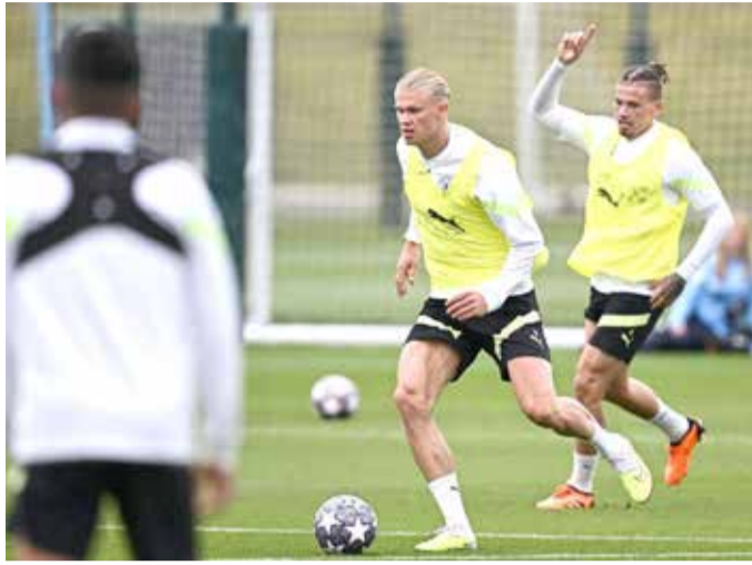
Manchester City's Erling Haaland (C) and Kalvin Phillips (R) take part in a team training session