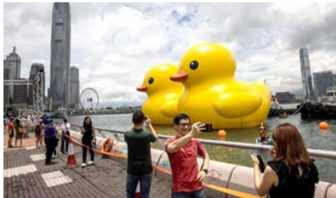
People take photos of two large inflatable yellow ducks called "Double Ducks" by Dutch artist Florentijn Hofman in Hong Kong's Victoria Harbour