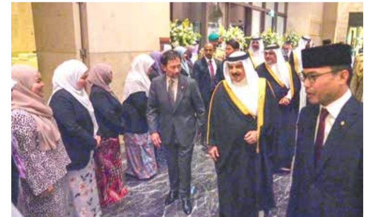
In pictures, His Majesty King Hamad bin Isa Al Khalifa welcomes Sultan Hassanal Bolkiah of Brunei, accompanied by His Royal Highness Prince Abdul Mateen and top delegates, to Bahrain. His Royal Highness Prince Salman bin Hamad Al Khalifa, the Crown Prince and Prime Minister, was present.