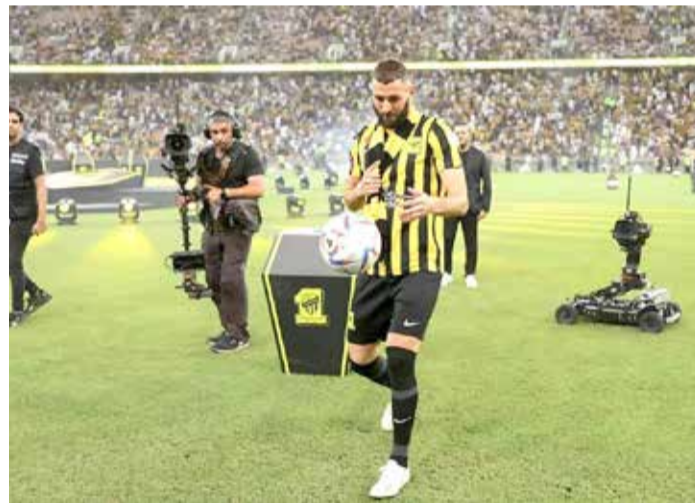
Former Real Madrid striker Karim Benzema, plays with a ball at King Abdullah Sports City stadium in Jeddah

It also comes after Saudi-funded LIV Golf pulled off a shock merger with the PGA Tour and DP World Tour following more than a year of acrimony and legal disputes that divided