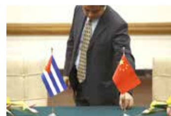
A staff prepares a table before a meeting between Cuban foreign minister Bruno Rodriguez and his Chinese counterpart Wang Yi in Beijing (file photo)

"The United States should reflect on itself and stop interfering in Cuba's internal affairs under the banner of freedom and democracy, and immediately cancel the economic, com-