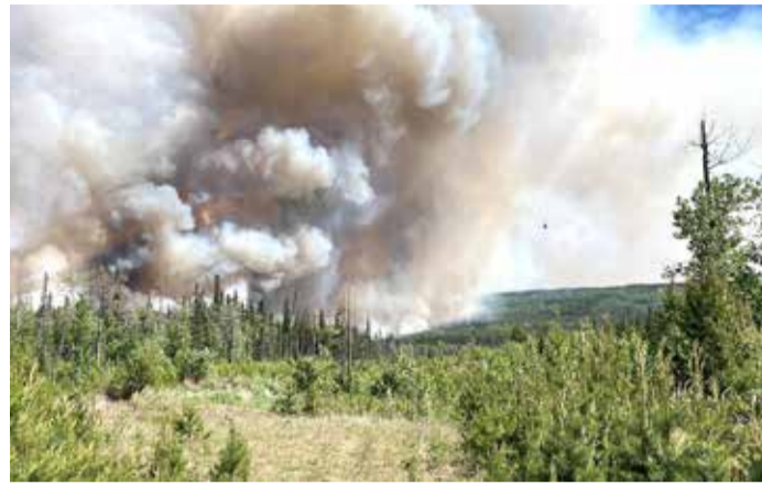
Smoke from the West Kiskatinaw River and Peavine Creek wildfires in the Dawson Creek Zone, British Columbia, Canada

Larger and more powerful wildfires than ever have scorched some 3.8 million hectares of Canadian forests and displaced tens of thousands of residents in recent weeks.