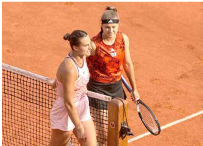
Czech Republic's Karolina Muchova (L) comforts Belarus' Aryna Sabalenka after her victory