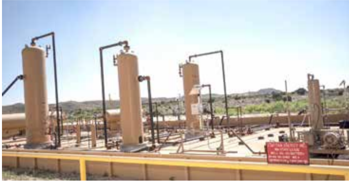
Equipment at a fracking well is pictured at Capitan Energy on May 7, 2020 in Culberson County, Texas.

The UK government yesterday said it would scrap a windfall tax on