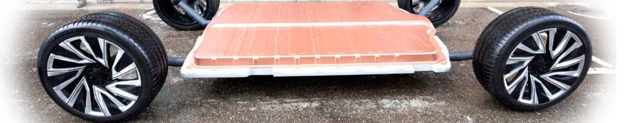
A General Motors Hummer EV chassis sits outside of an event where General Motors CEO Mary Barra announced that GM is making a $7 billion investment, the largest in the company's history, in electric vehicle and battery production in Michigan on January 25, 2022 in Lansing, Michigan.

"We must be laser-focused on phasing out fossil fuel emissions, while phasing up viable, affordable zero carbon alternatives," al-Jaber said at an event in Germany last month.