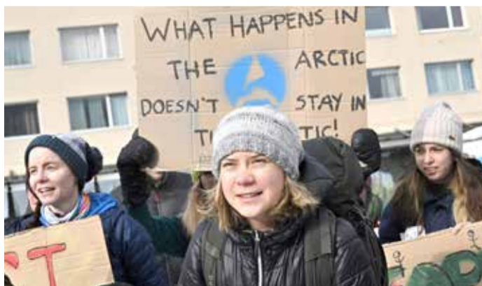
Sweden's Greta Thunberg and other young climate activists stage a demonstration (file photo)

Greta Thunberg was only 15 when she began her "School strike for climate" in front of Sweden parliament in Stockholm