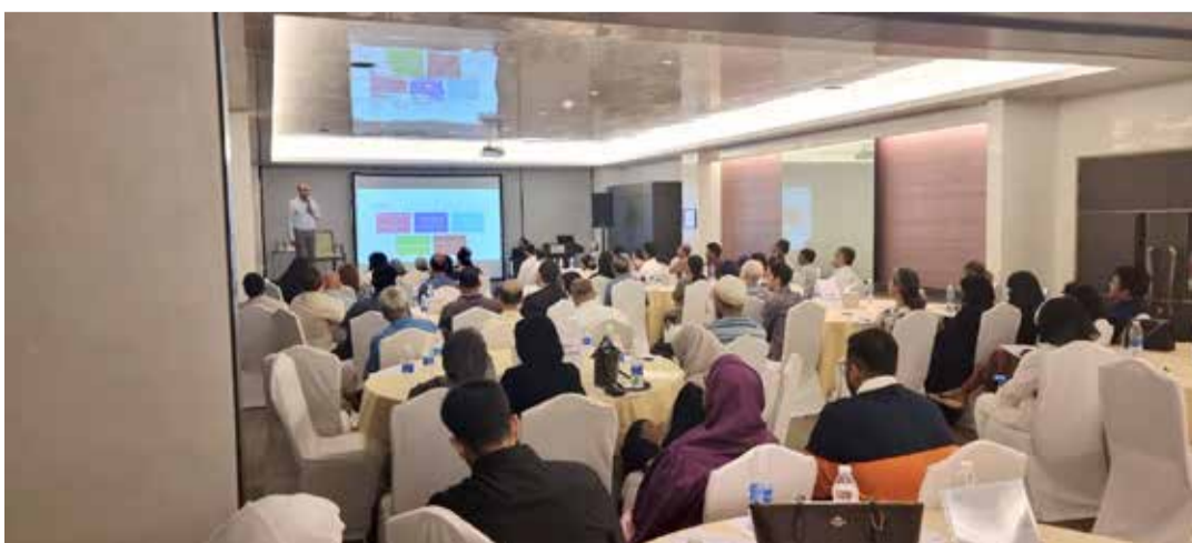
Participants during the seminar