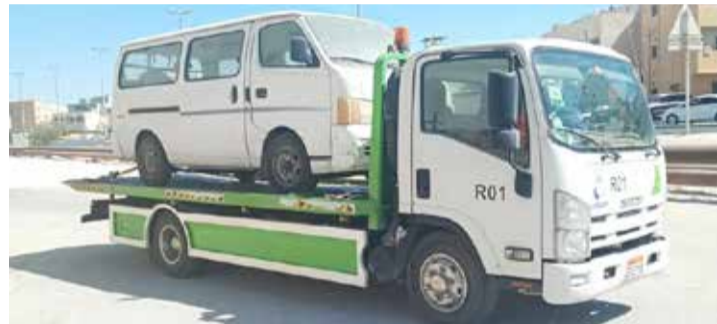
Some of the abandoned vehicles