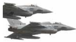
Two British Royal Air Force Typhoon FGR4 aircraft fly over RAF Waddington near Lincoln, England