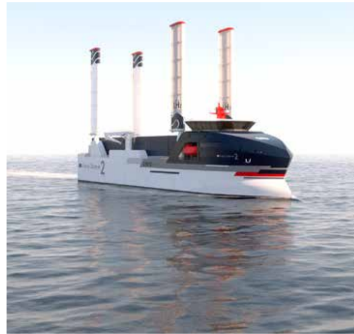
Energy Observer Productions on February 5, 2022, shows a 3D model of the vessel Energy Observer 2, a zero-emission multipurpose cargo ship powered by light liquid hydrogen. The new vessel is planned to be launched in 2025.

These uncertainties, in turn, have unfounded attempts to project global temperature increases, and whether the Paris climate treaty goals of capping global warming at "well below" two degrees Celsius, and at 1.5C if possible, remains within