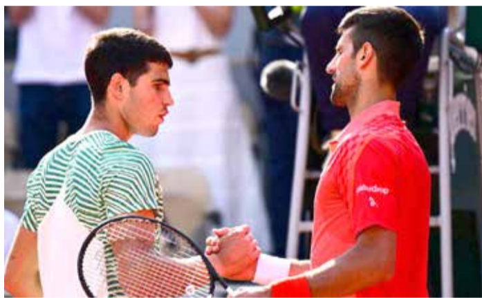
Novak Djokovic (R) shakes hands with Carlos Alcaraz Garfia after his victory

As boos and jeers rained down, Djokovic, playing in his