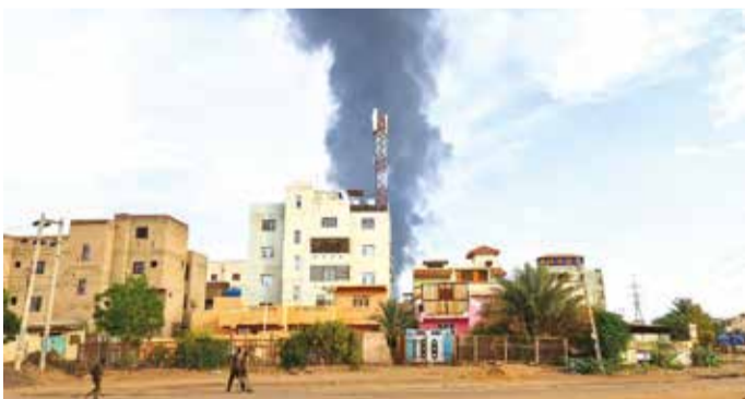
Black smoke billows behind buildings amid ongoing fighting in Khartoum

"Representatives of the Sudanese Armed Forces (SAF) and the Rapid Support Forces (RSF) agreed to a 24-hour country-wide ceasefire beginning on June 10 at 6:00 am (0400 GMT)," said a joint statement from the