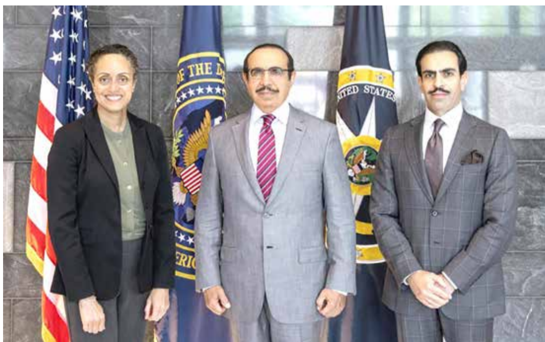
Interior Minister meets US Principal Deputy Director of National Intelligence