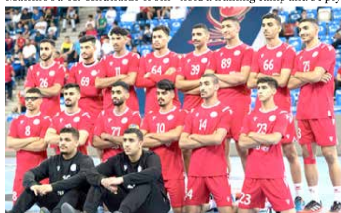
Bahrain's junior national handball team at a previous tournament (File photo)