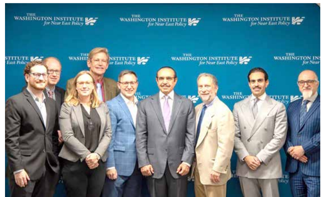
Interior Minister following talks at the Washington Institute for Near East Policy