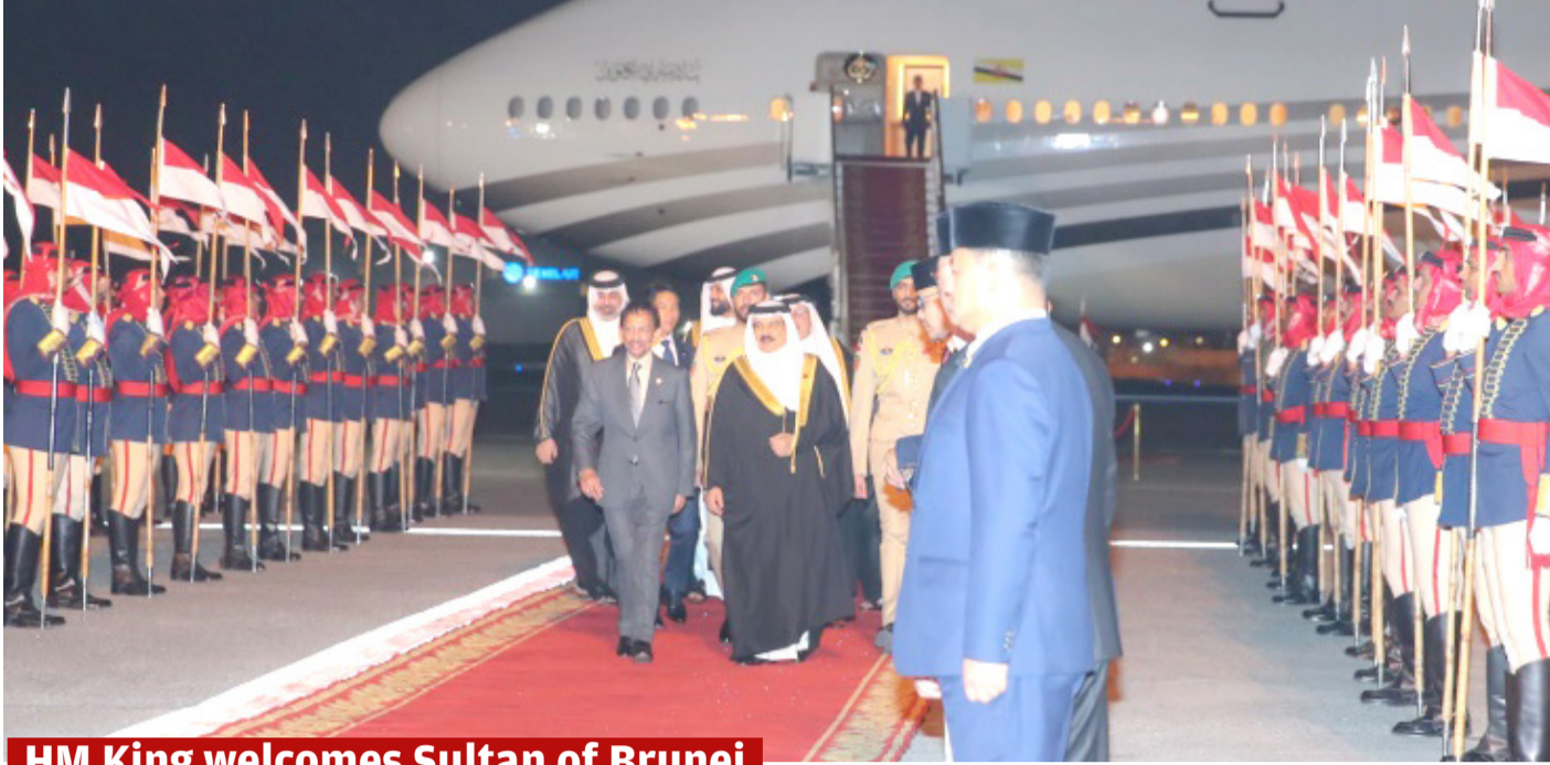
HM King welcomes Sultan of Brunei