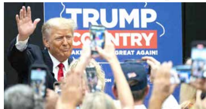
Former US President arrives to a Team Trump Volunteer Leadership Training in Grimes, Iowa

In his post, Trump, who is running for president again, said he has been summoned to a federal courthouse in Miami next Tuesday -- the day before