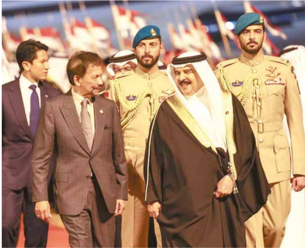
His Majesty King Hamad welcomes Sultan Bolkiah yesterday

comprises Dr Awang Haji Mohd Amin Liew Abdullah, the Minister at the Prime Minister's Office and Minister of Finance and Economy II, Erywan Pehin Yusof, the Minister of Foreign Affairs II, Dr Hajah Romaizah binti Haji Md Salleh, the Minister of Education, Nazmi Mohamad, the Minister of Culture, Youth and Sports and Major general Haji Muhammad Haszaim, the