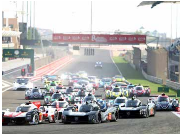
Action from a previous WEC event at BIC

The Kingdom has been a part of the WEC campaign ever since