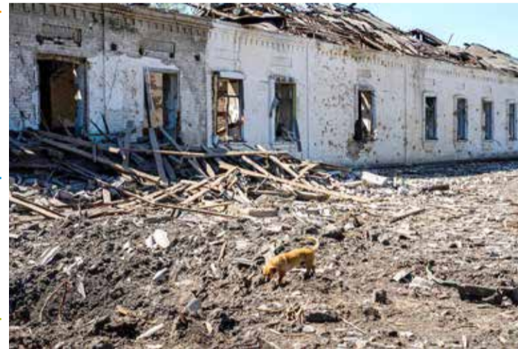
A dog walks on the debris of a destroyed building in the town of Orikhiv, in the Zaporizhzhia region (file photo)

Fighting raged yesterday in Ukraine's southern Zaporizhzhia region, a Russian official said, with observers seeing the combat as the possible start of Kyiv's long-expected of-