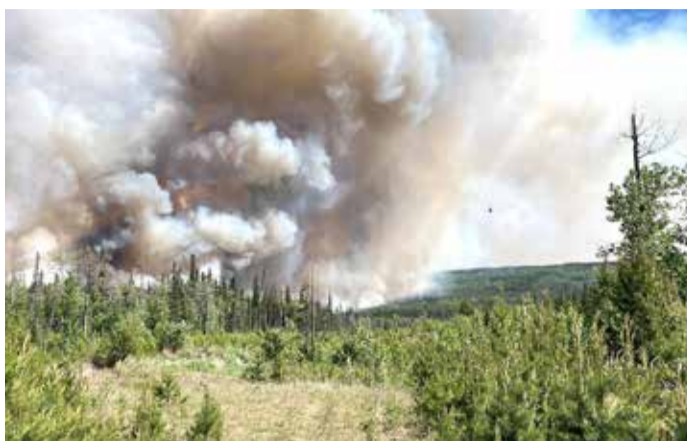
Smoke from the West Kiskatinaw River and Peavine Creek wildfires in the Dawson Creek Zone, British Columbia, Canada

Larger and more powerful wildfires than ever have scorched some 3.8 million hectares of Canadian forests and displaced tens of thousands of residents in recent weeks.