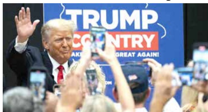
Former US President arrives to a Team Trump Volunteer Leadership Training in Grimes, Iowa

In his post, Trump, who is running for president again, said he has been summoned to a federal courthouse in Miami next Tuesday -- the day before