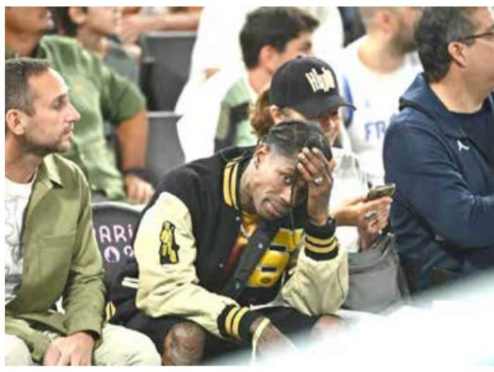
Travis Scott attends the Olympics men's basketball semi-finals

US rapper Travis Scott was arrested early Friday over a fight at a five-star hotel in the French capital, prosecutors said. "Policemen were called to the Georges V hotel and arrested Travis Scott for violence against a security agent. The latter had intervened to separate the rapper from his bodyguard," the Paris prosecutor's office said in a statement. It was not immediately clear if the 33-year-old singer was being detained.