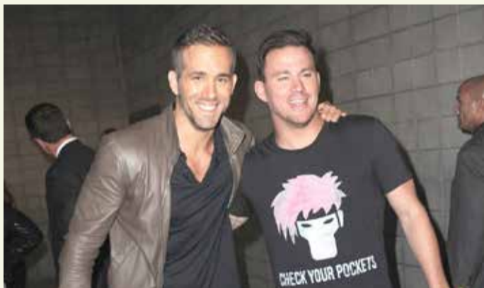
Ryan Reynolds and Channing Tatum

Ryan Reynolds has hailed Channing Tatum as a "once-in-a-generation talent". The 47-year-old actor stars alongside Channing, 44, in 'Deadpool and Wolverine', and Ryan has taken to social media to pay a glowing tribute to his co-star, who plays Gambit in the new Marvel movie. Ryan - who plays Deadpool in the money-spinning film franchise - wrote on X: "Imagine having a front row seat to this guy. He's not only a once in a