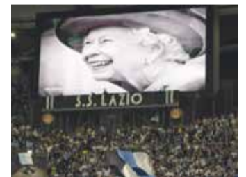
A portrait of Britain's Queen Elizabeth II is displayed on a giant screen during a football match

The queen, Britain's longest-reigning monarch, died peacefully at her home in Scotland on Thursday aged 96.