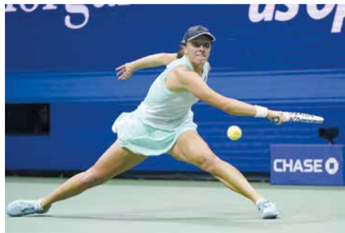
Iga Swiatek returns a shot to Aryna Sabalenka

Swiatek has emerged as a dominant figure in women's tennis, with a 37-match winning streak that brought her six titles in one stretch. If she can defeat Jabeur, Swiatek will become the first woman since Angelique Kerber in 2016 to win two majors in one season