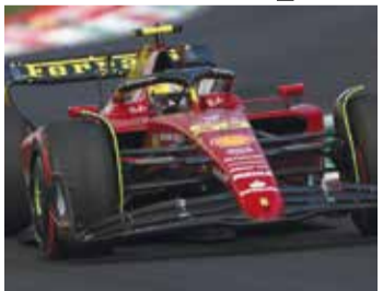
Ferrari's Carlos Sainz steers his car during practice

Red Bull's Verstappen was hit with a five-place grid penalty