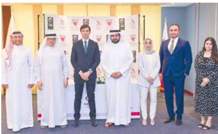
Officials at the signing